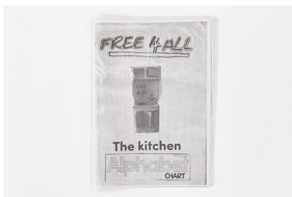
Thato Makatu free4all: the kitchen alphabet edition (2025) Silkscreen on newsprint 59.4 x 42 cm