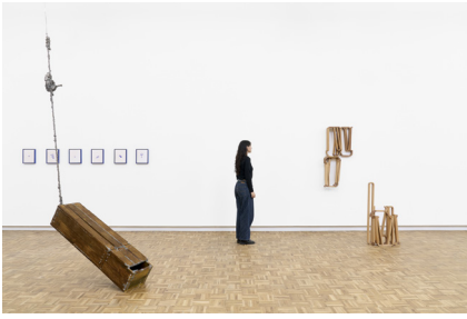
autopoiesis (2025) | Installation view at blank projects, Cape Town