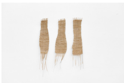
Andisiwe Mgwintenti Ndibambekile ndawonye - Held together (I), (II), (III) (2025) Woven reed grass 112 x 84 x 6 cm