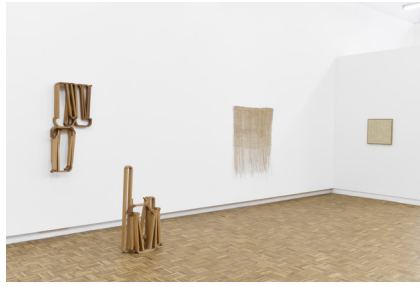
autopoiesis (2025) | Installation view at blank projects, Cape Town