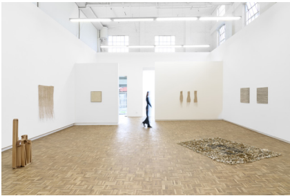
autopoiesis (2025) | Installation view at blank projects, Cape Town