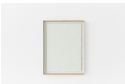
Thato Makatu notes on building a kitchen - exercise sheet 2b (2025) Embossing on munken pure 54 x 40 cm (unframed)