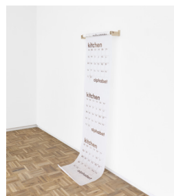
Thato Makatu notes on building a kitchen - exercise sheet 2a (2025) Silkscreen on baking paper 460 x 45 x 11.5 cm