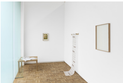
autopoiesis (2025) | Installation view at blank projects, Cape Town