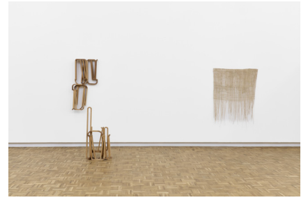
autopoiesis (2025) | Installation view at blank projects, Cape Town