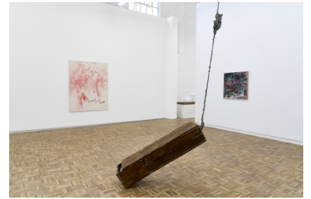
autopoiesis (2025) | Installation view at blank projects, Cape Town