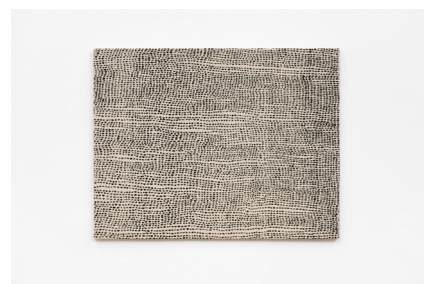
Chuma Adam Untitled Landscapes No. 02 (2025) Acrylic paint on umbaco 66 x 85 x 2 cm