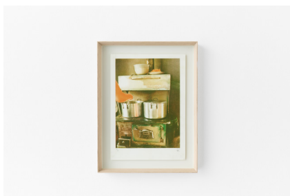
Thato Makatu never enough (2025) Risograph on munken pure 28 x 20 cm (unframed)