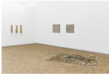
autopoiesis (2025) | Installation view at blank projects, Cape Town