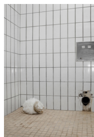
Samuel Georgy Lazarus Elnady (spinning top) 2021 fur, metal, hemp rope