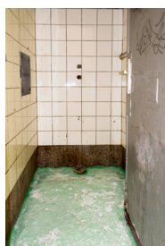
Samuel Georgy Lazarus Elnady (portal) 2022 lye, olive oil, oud, nard, myrrh, pigment