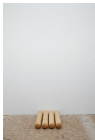
Samuel Georgy Lazarus Elnady (tubular relics) 2022 wood