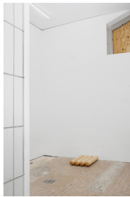
Samuel Georgy Lazarus Elnady (tubular relics) 2022 wood