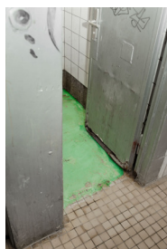
Samuel Georgy Lazarus Elnady (portal) 2022 lye, olive oil, oud, nard, myrrh, pigment