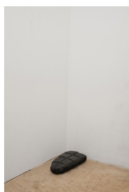
Samuel Georgy Lazarus Elnady (motorcycle seat) 2022 leather, lining