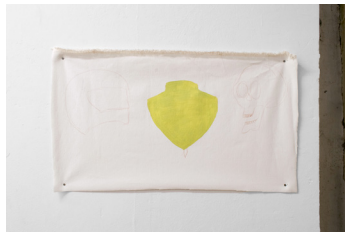
Culture Cafe untitled 2022 drawing and painting on unstretched linen