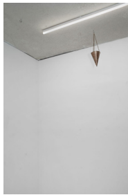
Samuel Georgy Lazarus Elnady (scent) 2022 metal, myrrh resin incense