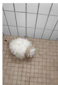
Samuel Georgy Lazarus Elnady (spinning top) 2021 fur, metal, hemp rope