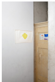
Culture Cafe untitled 2022 drawing and painting on unstretched linen