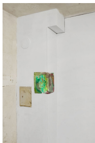
Culture Cafe untitled 2022 painting on unstretched linen