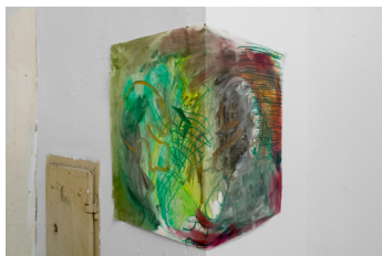
Culture Cafe untitled 2022 painting on unstretched linen Photo by Vers Dor Courtesy of the artist and Culture Cafe.