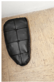
Samuel Georgy Lazarus Elnady (motorcycle seat) 2022 leather, lining