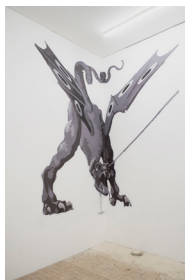
Samuel Georgy Lazarus Elnady (dragon) 2022 poster paper