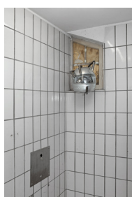
Samuel Georgy Lazarus Elnady (helmet) 2022 motorcycle helmet, metal, paint

Disclaimer: This checklist was created long after the exhibition closed. Therefore, some information may be inaccurate or missing. The objects themselves are no longer available, meaning measurements cannot be taken, and proper titles are not available as the exhibition was conceived as a single, cohesive work.