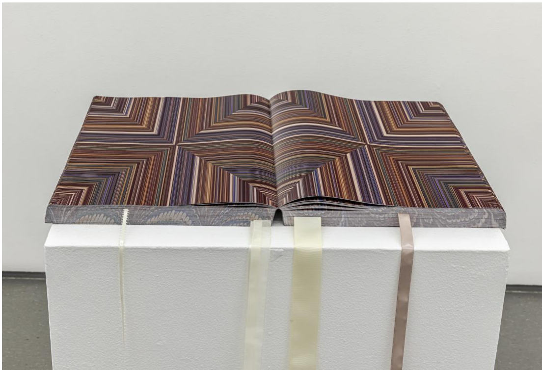
Shannon Garden-Smith, Opposite the spine (book) , 2025, 800-page artist book, digital prints on paper, 19 x 13"