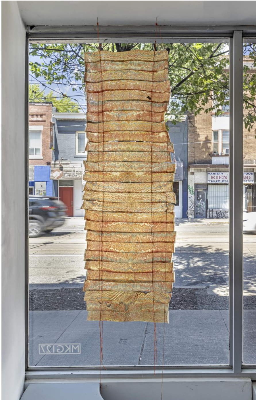
Shannon Garden-Smith, Blinds (wide comb) , 2022, gelatine embedded with collected jewelry, photo transfer (historical marbling sourced from the Thomas Fisher Rare Book Library collection), dyed window blinds, ladder strings, 60 x 21"