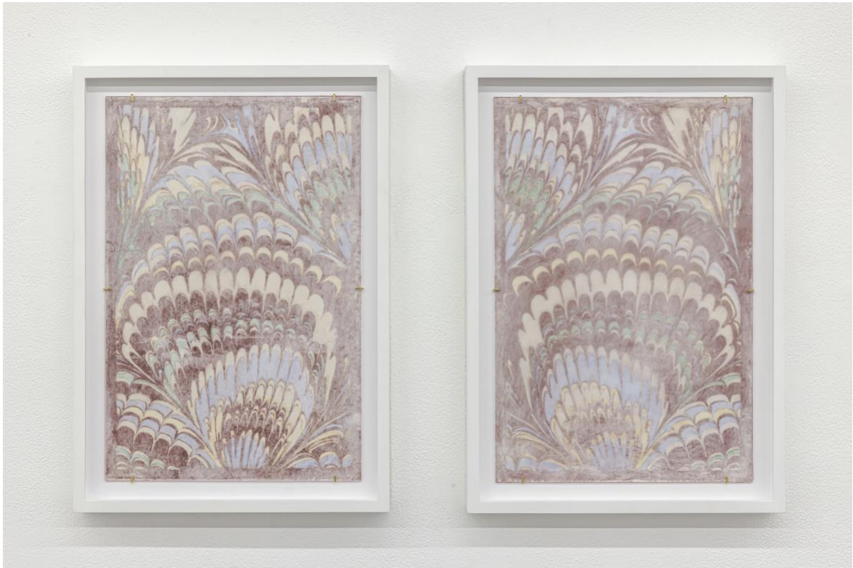
Shannon Garden Smith, Dust Print I (recueil de cartes) , 2025 Pigmented sand dust, acrylic sheet, 18 x 12" (unframed), 20 x 14" (framed)