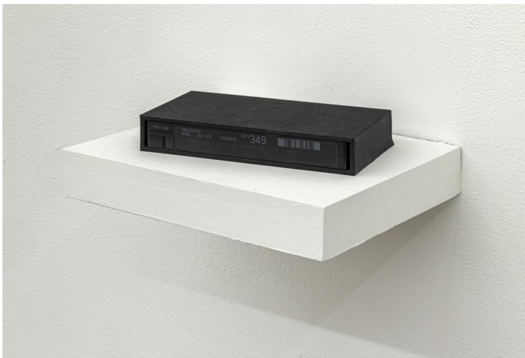
Dave Dymont, Self-erasing Memento (for Clive Wearing) , 2012, VHS tape, magnet, slipcase, 1.25 x 8 x 4.25", Edition of 3