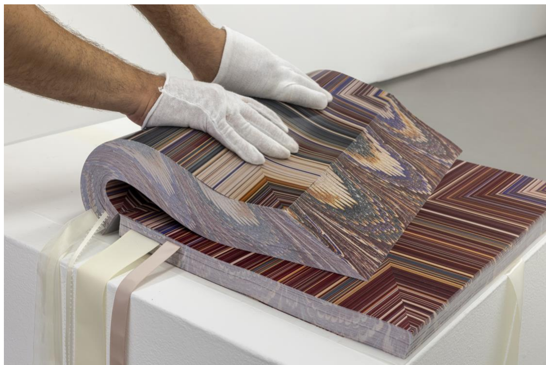
Shannon Garden-Smith, Opposite the spine (book) , 2025, 800-page artist book, digital prints on paper, 19 x 13"