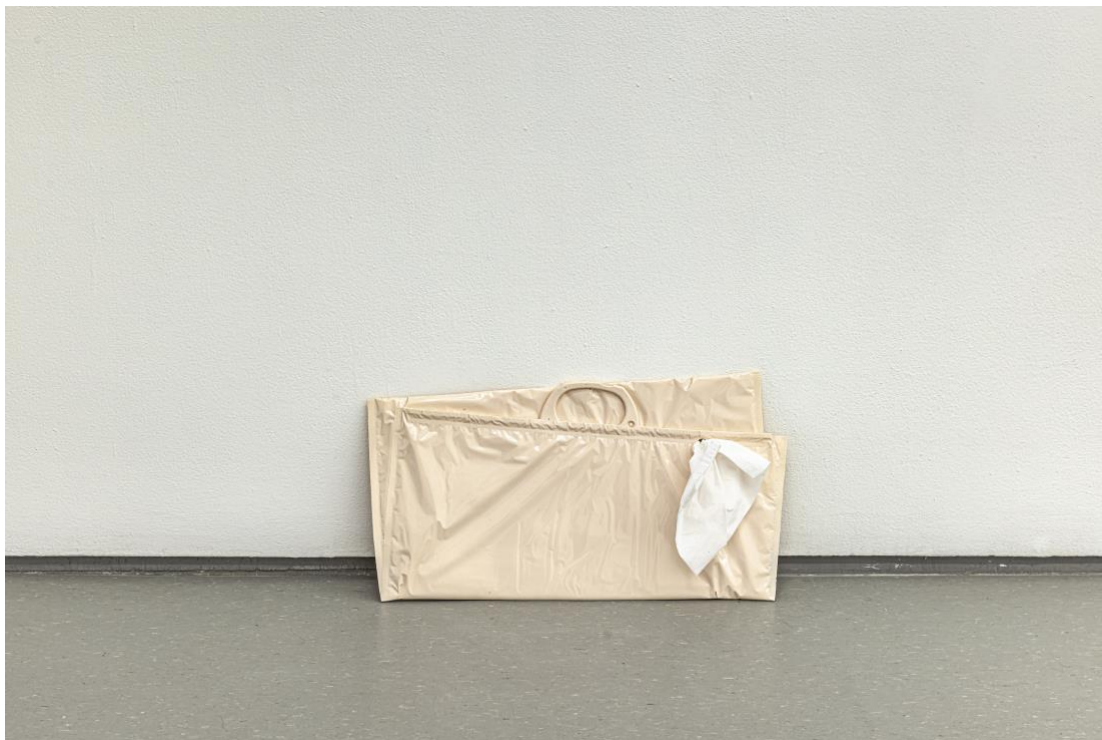
Liza Eurich, Offering , 2025, resin, tint, tissue, dimensions variable