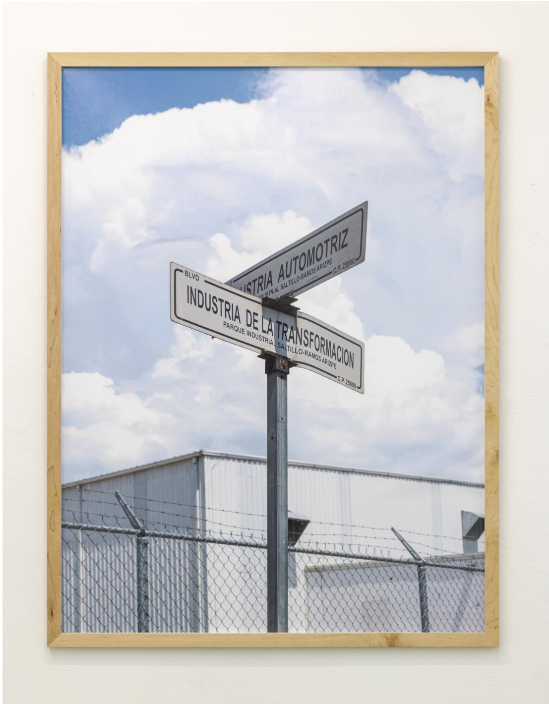
Anahí González, Calle Automotriz , 2022, inkjet print, 40 x 30", Edition of 5