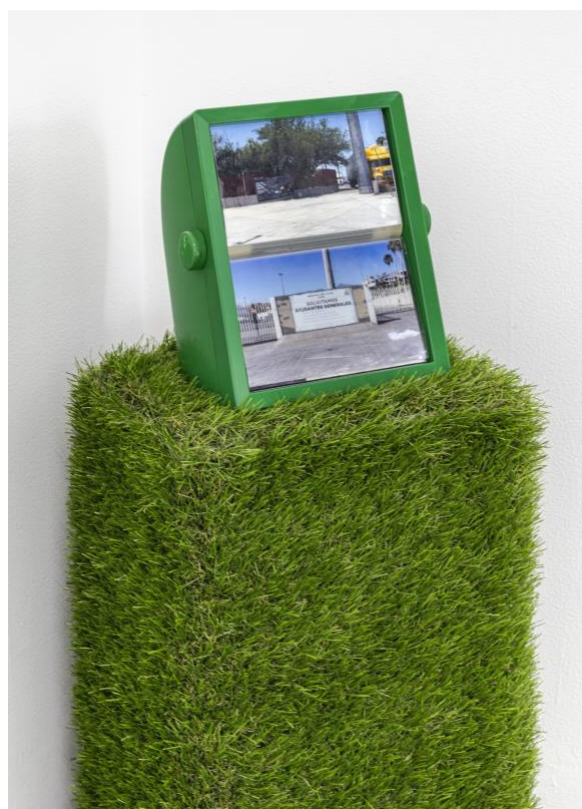
Anahí González, Aquí hay chamba! , 2022, photo rolodex, synthetic grass plinth, synthetic grass carpet, dimensions variable