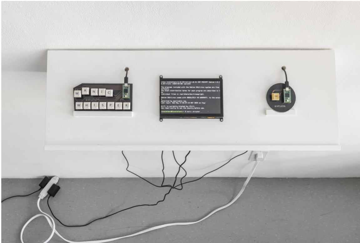
Matt Nish-Lapidus, Love letters 2 (Manic Whisper) , 2022, custom printed circuit boards, keyboard switches, assorted key caps, LCD screens, artist-written software, 2.75 x 6 x 1", AP1, Ed. of 2 + 1AP