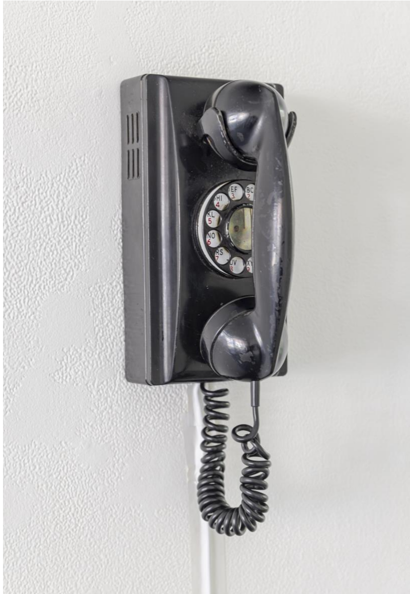
Dave Dymont, Untitled [Eavesdrop] , 2018, wall-hanging rotary phone, MP3 player, 90-minute audio loop, Varied Edition 3 of 5. Collaboration with Stephanie Cormier