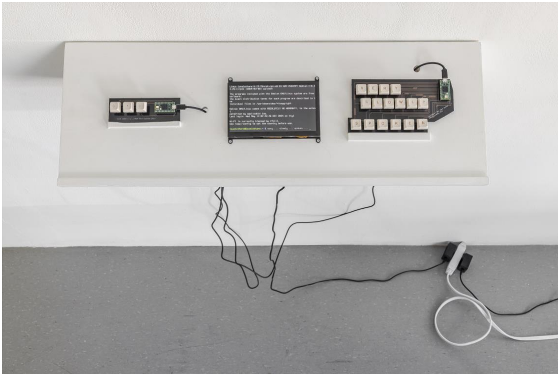
Matt Nish-Lapidus, Love letters 4 (...), 2022, custom printed circuit boards, keyboard switches, assorted key caps, LCD screens, artist-written software, 3 x 5 x 1", AP1, Ed. of 2 + 1AP