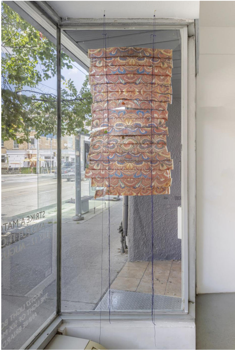
Shannon Garden-Smith, Blinds (bouquet) , 2022, gelatine embedded with collected jewelry, photo transfer (historical marbling sourced from the Thomas Fisher Rare Book Library collection), dyed window blinds, ladder strings, 38 x 21"