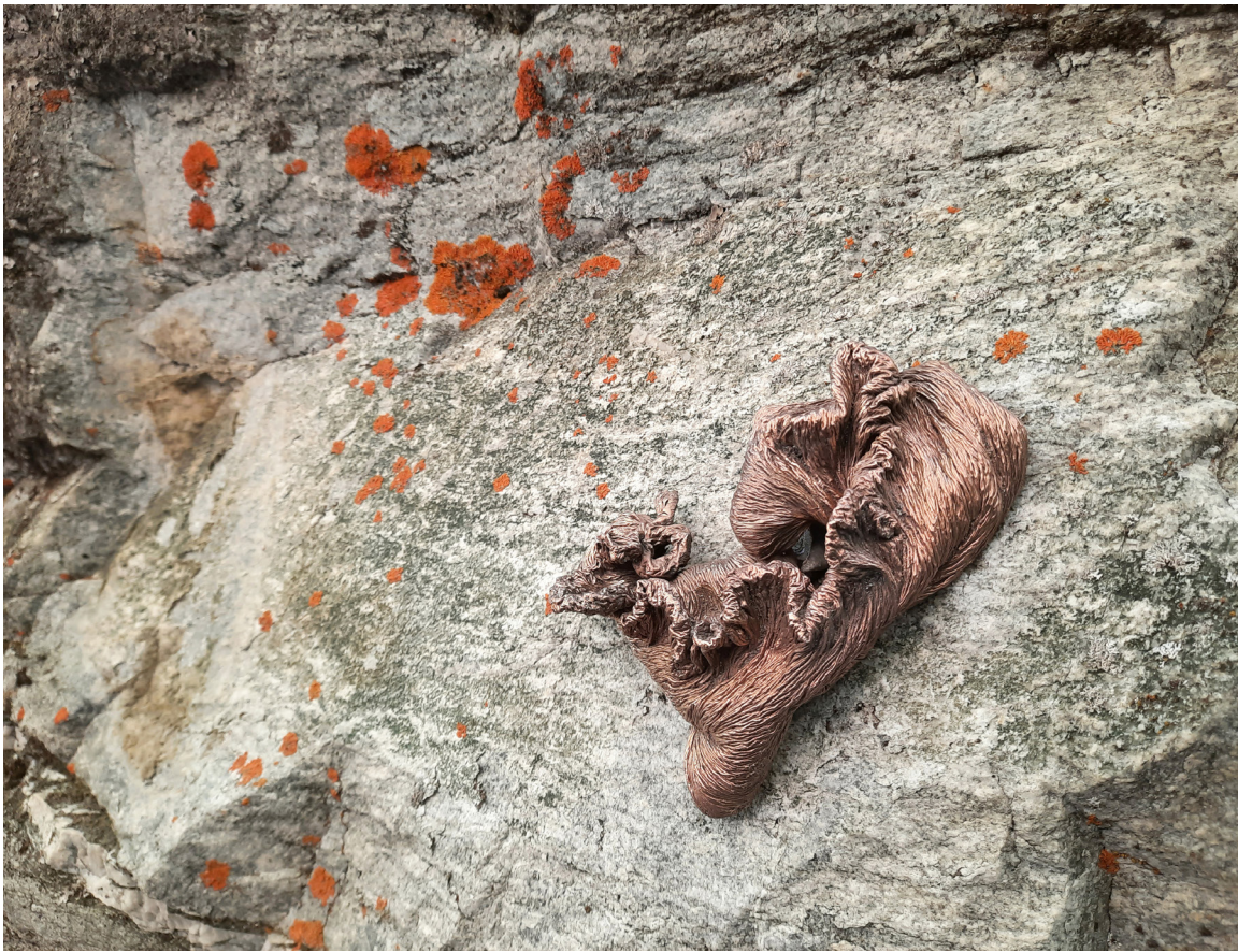
Caretto & Spagna, Domande al Corpo Glaciale [Questions to the Glacial Body] 2022. Bronze. 18 x 12 x 3 cm.