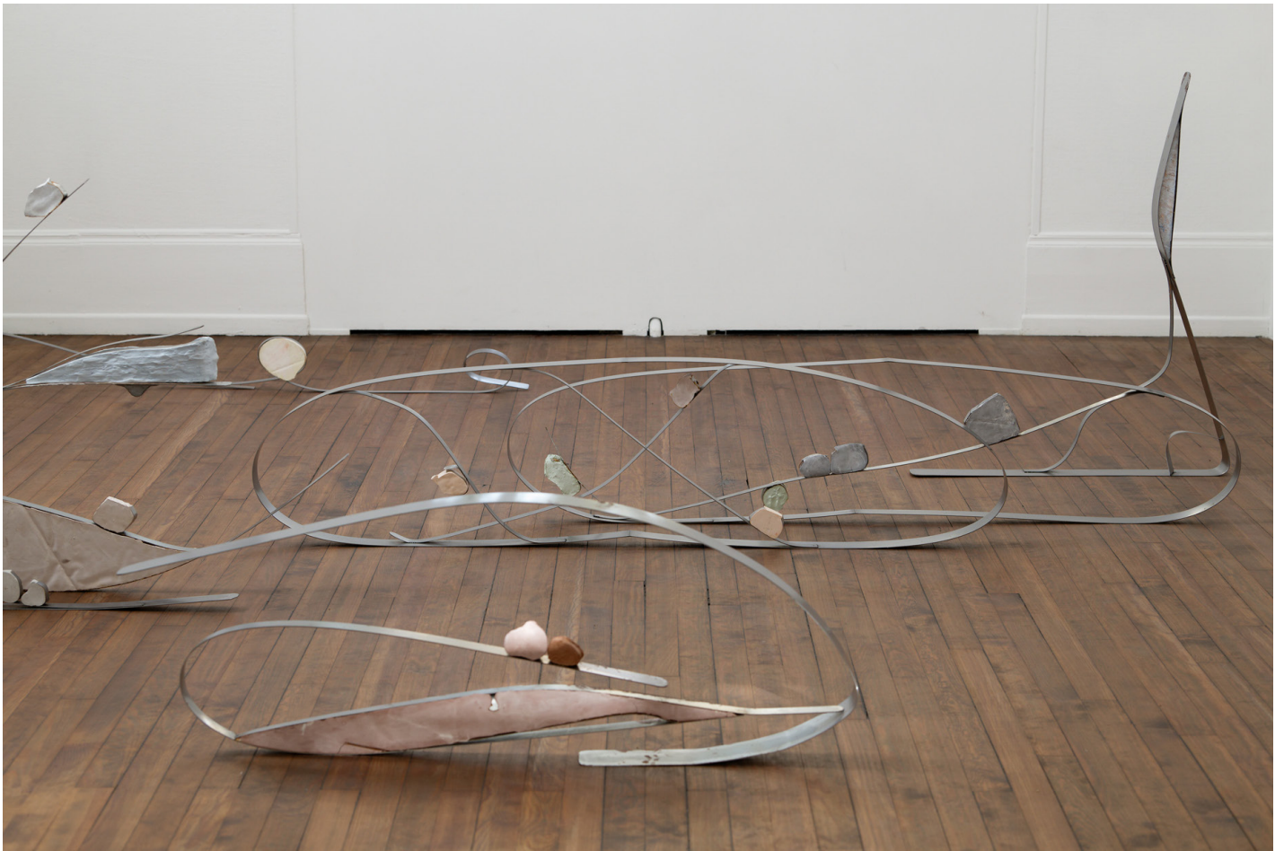
View of the series an e , a e , e by Marie Raffn (2021). Steel and stained plaster. Variable dimensions.