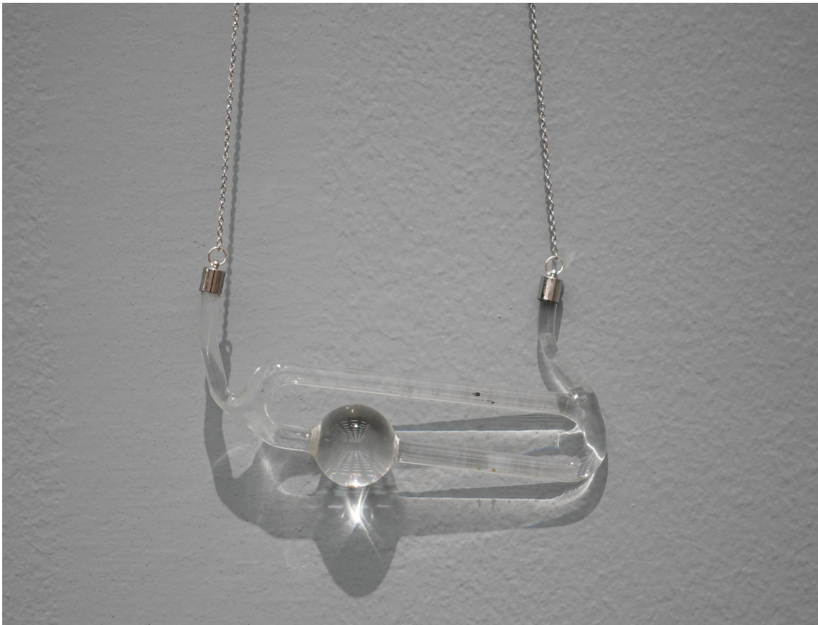
Seulgi Lee, FLUICE_VIII (Altkirch), 2020. Glass pendant containing water from the Ill River. Variable dimensions. Courtesy of the artist and Jousse Entreprise Gallery. Photography by Marc Damage.