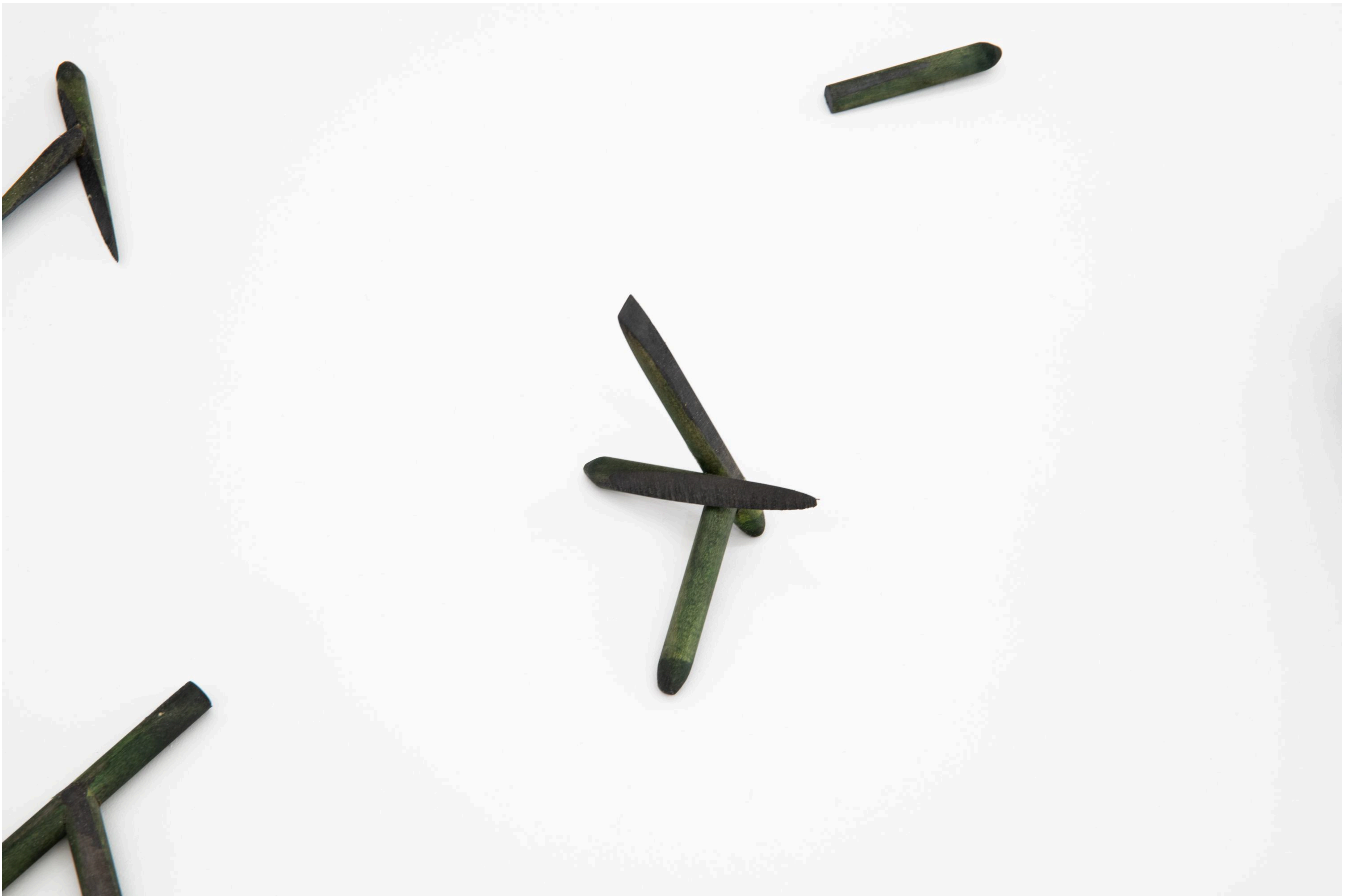
Goodbye Language (Bramble) , 2025 Wood, dye, oil