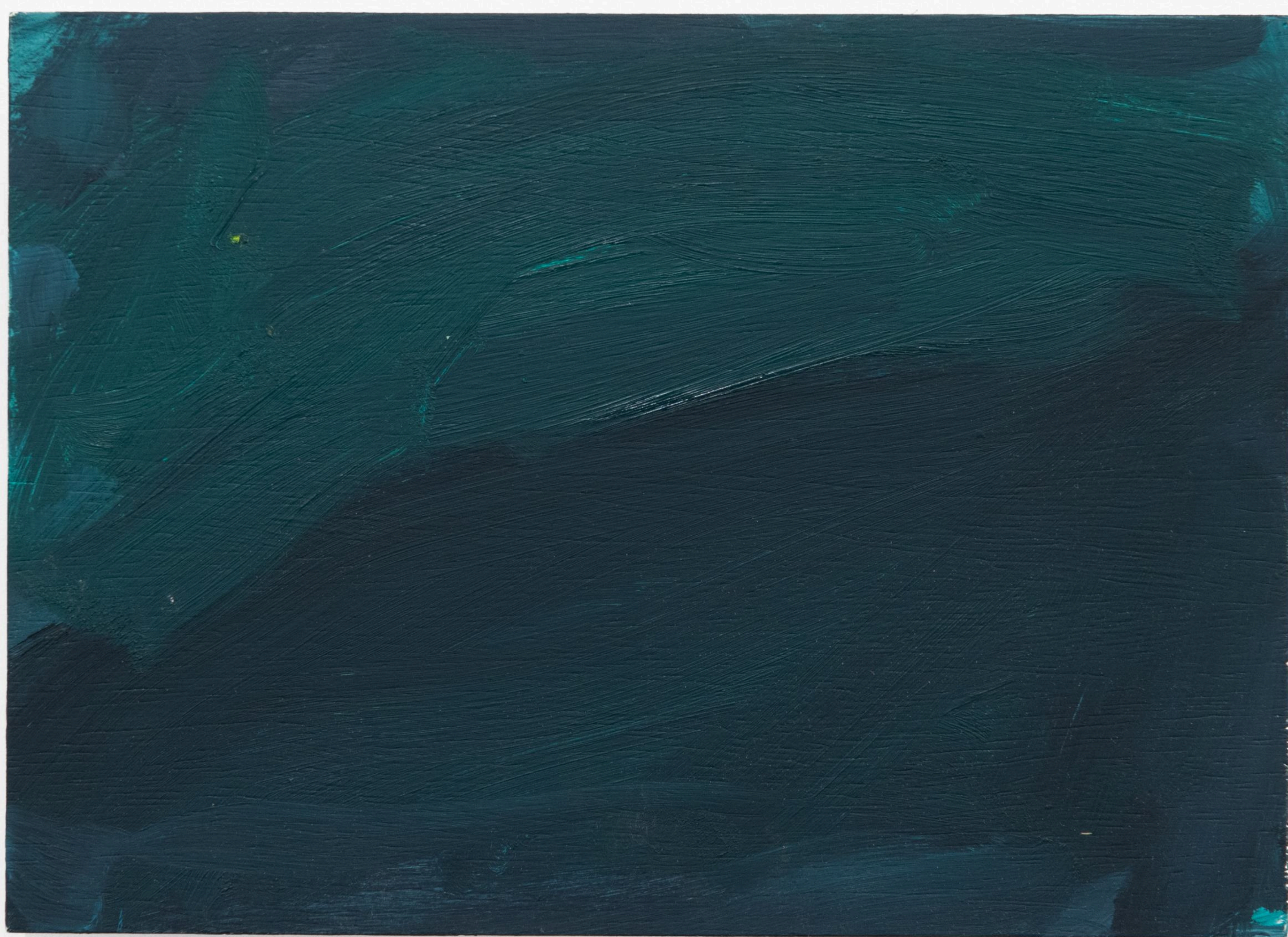
Blankets , 2025 oil on panel 9 x 12 inches