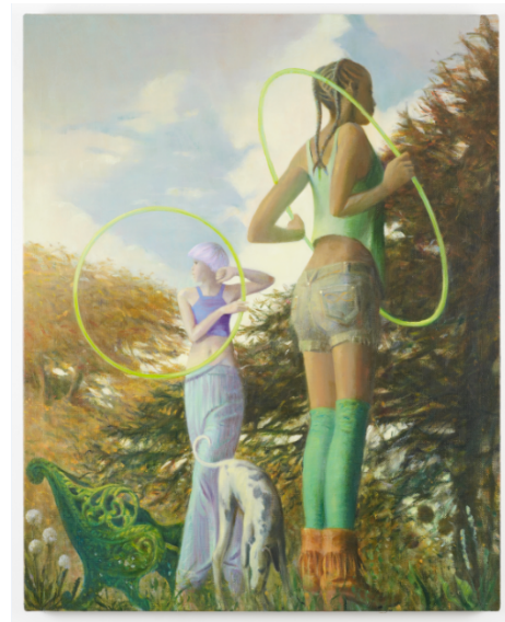
Benjamin Senior Portals , 2016 © Benjamin Senior, 2019. Courtesy of Carl Freedman Gallery, Photography by Andy Keate