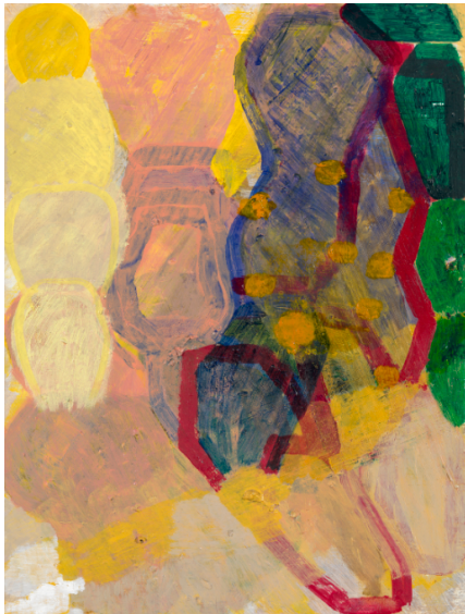
Sherman Sam Whole Lotta Love , 2012 © and courtesy the artist, 2019

© the artist, 2019. Courtesy Arts Council Collection, Southbank Centre, London