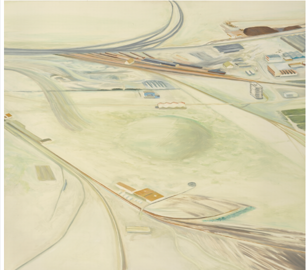
Carol Rhodes Industrial Landscape , 1997

Oil on canvas 130 x 180 cm / 51 x 70 in © the artist, 2019 'Courtesy of the artist and Cabinet, London