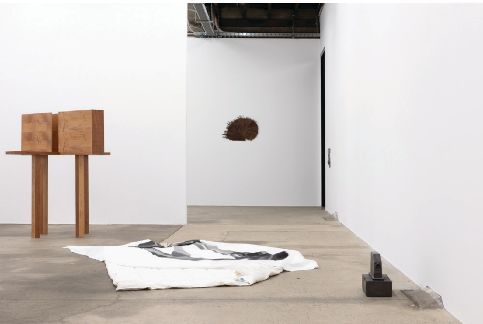
Installation view, Minerva 'The Sculpture Show' 19 July – 16 August 2025