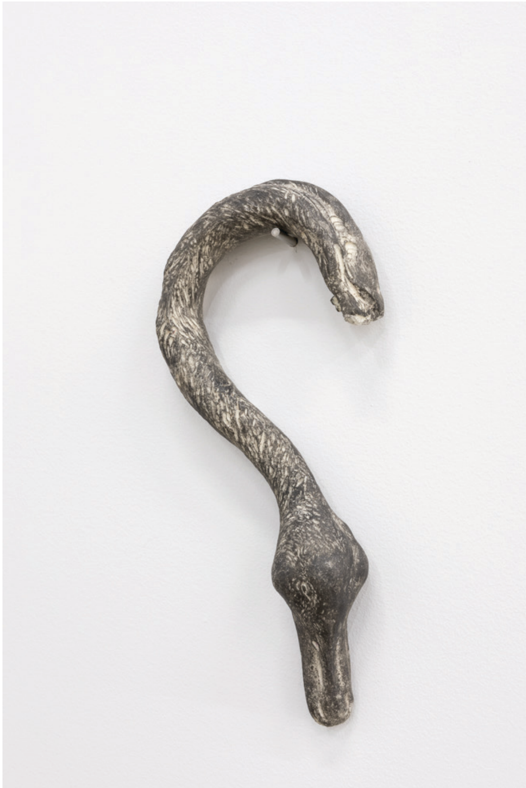
Samuel Chan , Noose , 2024 Edition of 5+ 2 a.p Resin, graphite, titanium rod 30 x 14 x 5 cm