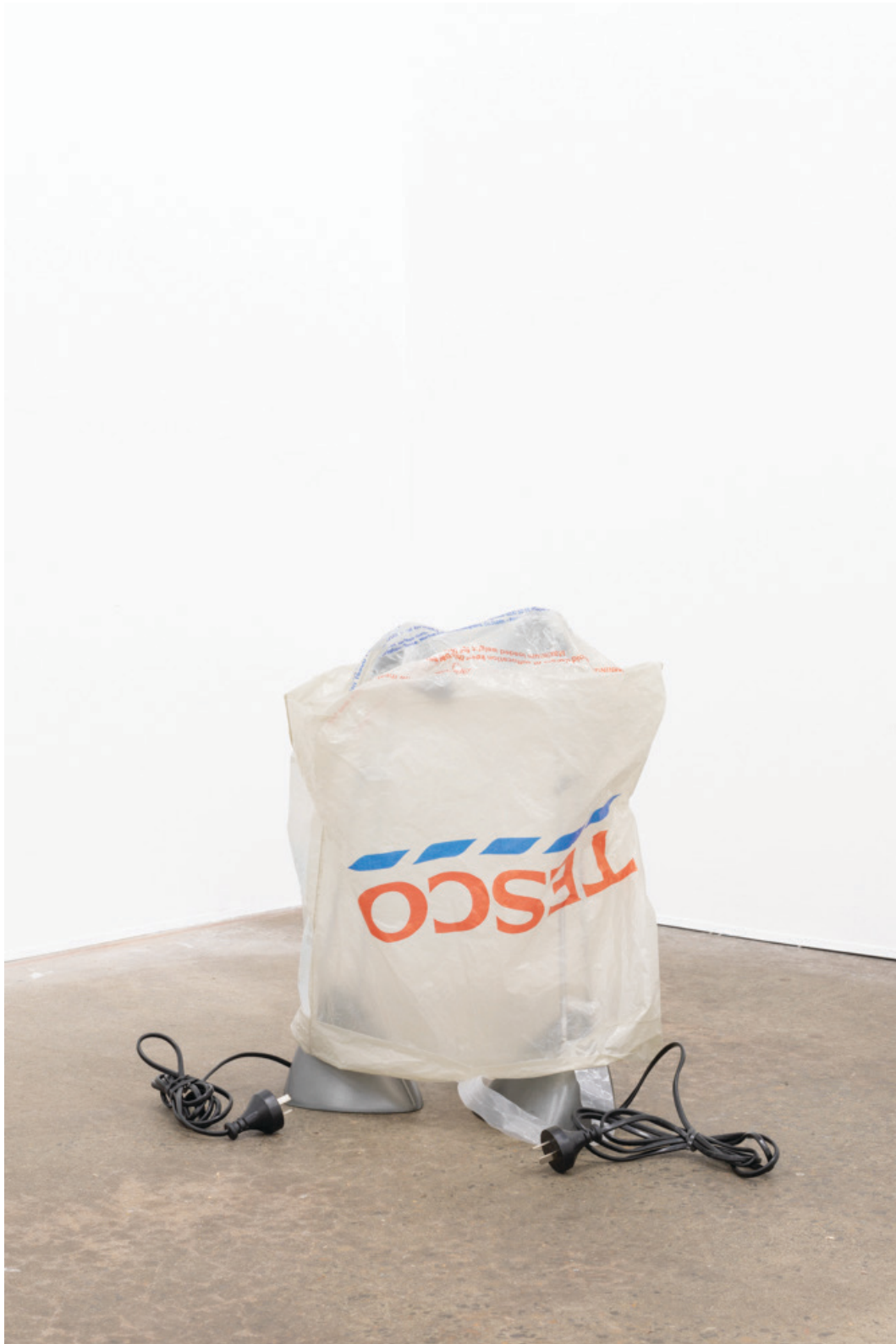
Christopher LG Hill , lamp flag bag , 2025 Two unplugged lamps, Tesco plastic bag Dimensions variable