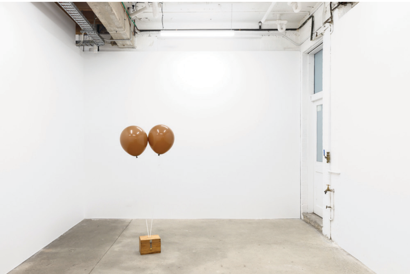
Aldi Difinubun , Negotiating Weight (White Lines) Found box, brass lock, ribbon, helium, balloons Dimensions variable