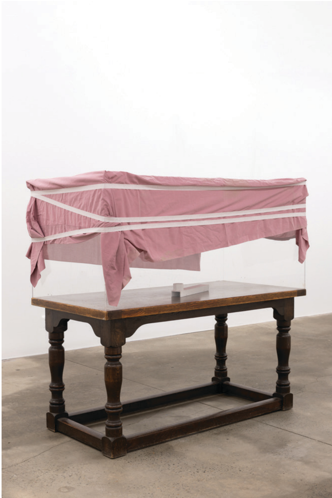
Christopher Hanrahan , Wrench , 2025 Steel, enamel and brass 40 x 7.5 x 6 cm