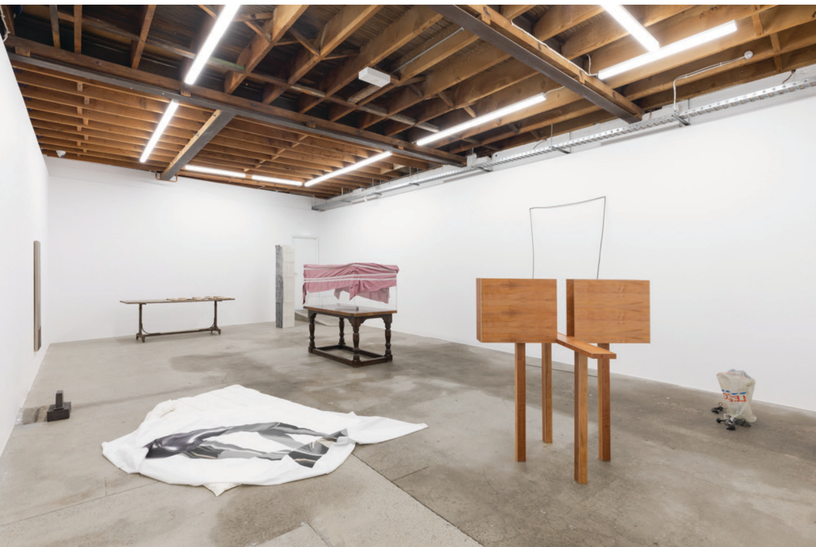
Installation view, Minerva 'The Sculpture Show' 19 July – 16 August 2025