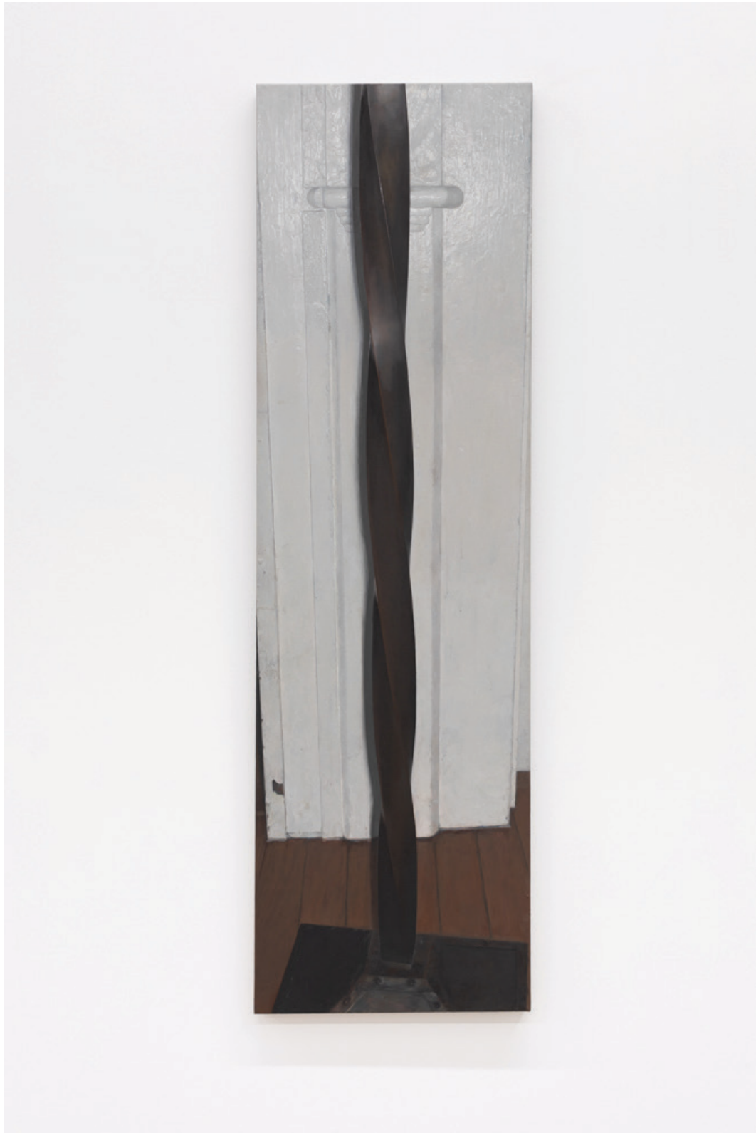
Edie Duffy , Standing Post , 2024 Oil on linen 137 x 40.5 cm