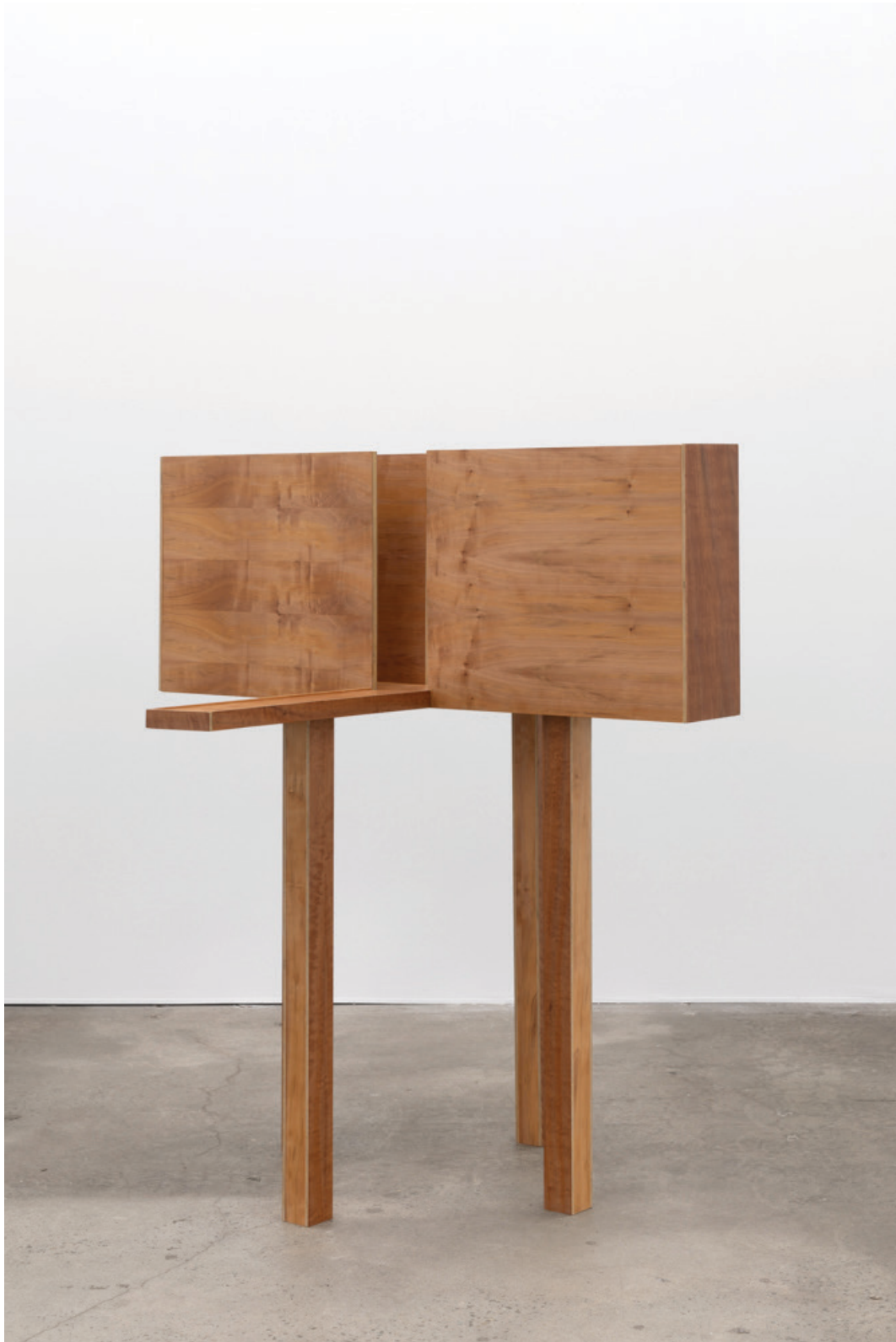
Nicholas Mangan, (EPM) , 2025 Tasmanian Myrtle 130 x 122 x 122 cm Edition 1 of 1