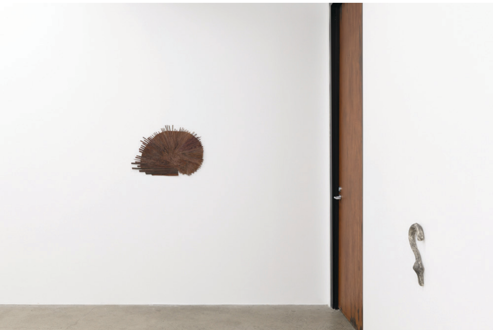
Installation view, Minerva. 'The Sculpture Show' 19 July – 16 August 2025