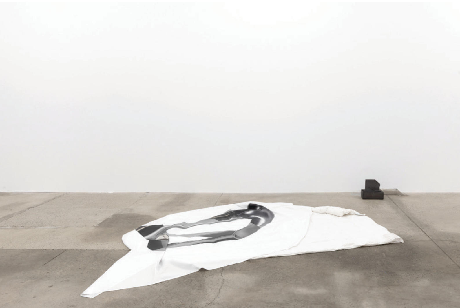
Emily Isabel Taylor , TRAUMPASS (dream pass) , 2025 UV print on cotton cover, feather filling 135 × 200 × 4 cm