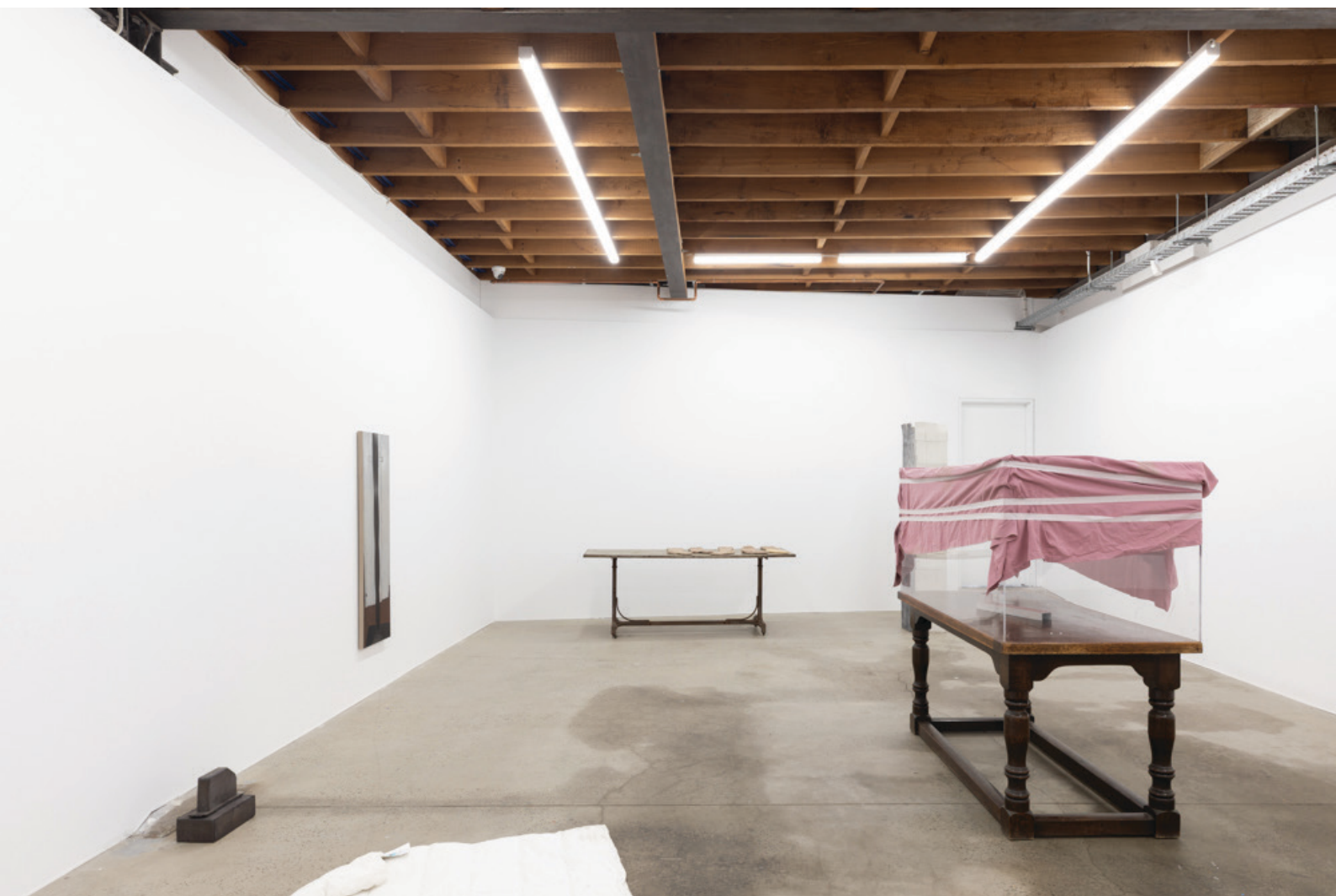
Installation view, Minerva 'The Sculpture Show' 19 July – 16 August 2025