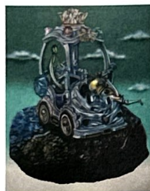
Botond Keresztesi Apollon's car 2025 Acrylic, airbrush and oil on canvas 140 x 120cm @keresztesibotond