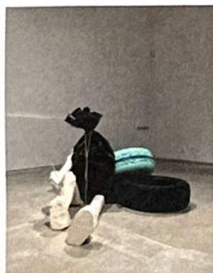
Gábor Pintér Angel 2022 Mixed media installation Dimensions variable @gaborPainter