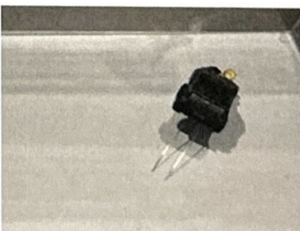
Réka Lőrincz Abundance on the move 2019 Brooch, Fine gold, sapphire, silver, pirite, matchbox @rekalorincz_