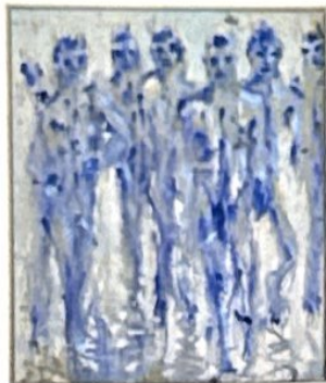
Andrej Dubravsky Nice Blue Party For 7 Runners 2024 acrylic on canvas 115x100 cm @andrej_dubravsky