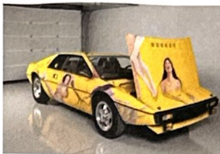
Selma Selman Ophelia's Awakening 2024 Oil on Lotus Esprit 1978, four cylinder engine