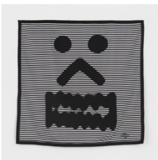
Tina Girouard Death , 1980 Fabric Workshop DNA-Icons panels with pigment on commercially printed fabrics In collaboration with The Fabric Workshop and Museum, Philadelphia 36 x 36 3/4 in. 91.4 x 93.3 cm. (TG_022)