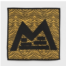
Tina Girouard Land , 1980 Fabric Workshop DNA-Icons panels with pigment on commercially printed fabrics In collaboration with The Fabric Workshop and Museum, Philadelphia 36 1/4 x 36 1/4 in. 92.1 x 92.1 cm. (TG_018)