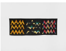
Tina Girouard Water, Water, Water , 1980 Fabric Workshop DNA-Icons panels with pigment on commercially printed fabrics In collaboration with The Fabric Workshop and Museum, Philadelphia 35 1/4 x 104 in. 89.5 x 264.2 cm. (TG_005)