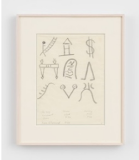
Tina Girouard Pictionary , 1979 Graphite on paper 20 x 17 in. 50.8 x 43.2 cm. (TG_040)