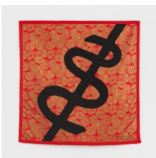
Tina Girouard Conflicting Evidence , 1980 Fabric Workshop DNA-Icons panels with pigment on commercially printed fabrics In collaboration with The Fabric Workshop and Museum, Philadelphia 37 x 37 in. 94 x 94 cm. (TG_023)