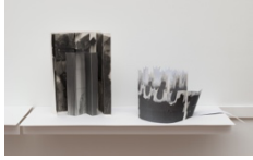
Lucas Odahara Intervalo 4:50 , 2025 paper, graphite watercolor, unfired glaze, artist's shelf 14 x 28 1/2 x 10 1/2 inches (35.6 x 72.4 x 26.7 cm) (LO123)