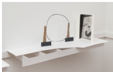
Lucas Odahara Intervalo 8:8 , 2025 paper, graphite watercolor, artist's shelf 10 1/2 x 28 1/2 x 10 1/2 inches (26.7 x 72.4 x 26.7 cm) (LO124)