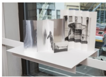
Lucas Odahara Intervalo 1:10 , 2025 paper, graphite watercolor, aluminum foil, artist's shelf 11 x 17 x 13 1/2 inches (27.9 x 43.2 x 34.3 cm) (LO127)