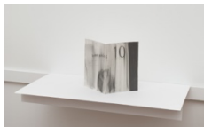
Lucas Odahara Intervalo 9:10 , 2025 graphite watercolor, paper, artist's shelf 8 x 20 1/2 x 10 1/2 inches (20.3 x 52.1 x 26.7 cm) (LO121)