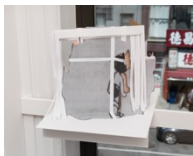
Lucas Odahara Intervalo 3:33 , 2025 paper, laser print, artist's shelf 10 1/2 x 10 x 13 1/2 inches (26.7 x 25.4 x 34.3 cm) (LO128)