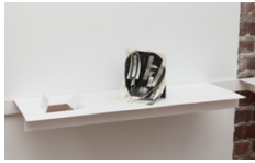
Lucas Odahara Intervalo 6:44 , 2025 paper, charcoal, tape, artist's shelf 8 1/2 x 28 1/2 x 10 1/2 inches (21.6 x 72.4 x 26.7 cm) (LO126)