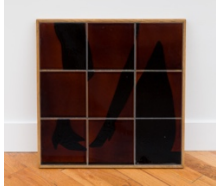
Lucas Odahara Os Desorientados da Pantera #11 , 2021 glazed ceramics 24 3/4 x 24 3/4 inches (63 x 63 cm) (LO116)