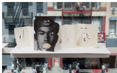
Lucas Odahara Intervalo 24:23 , 2025 paper, inkjet print, artist's shelf 12 1/2 x 28 1/2 x 13 1/2 inches (31.8 x 72.4 x 34.3 cm) (LO129)