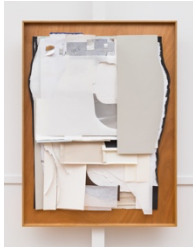
Lucas Odahara Song of Distances , 2025 paper 48 x 36 1/4 x 2 inches (121.9 x 92.1 x 5.1 cm) (LO125)