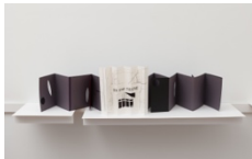
Lucas Odahara Intervalo 12:27 , 2025 paper, graphite, artist's shelf 10 x 41 x 10 1/2 inches (25.4 x 104.1 x 26.7 cm) (LO120)