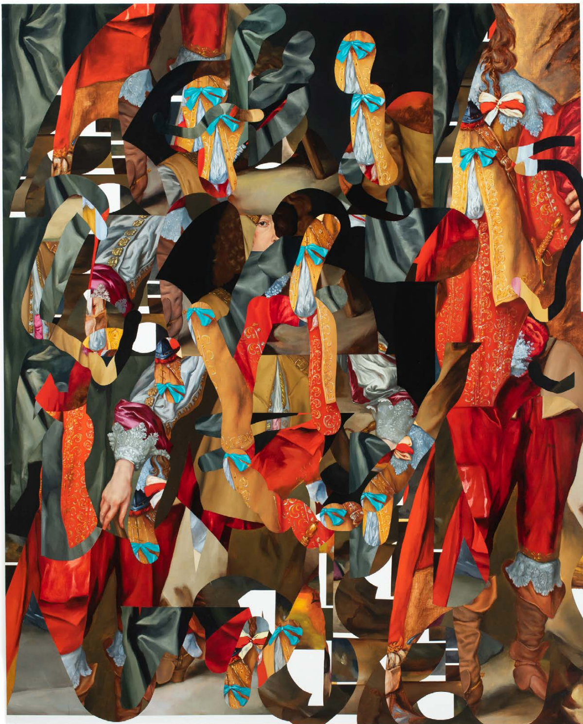
NG6363, 2020 Oil on linen 64 x 52 inches (162.6 x 132.1 cm) SCLA-0012