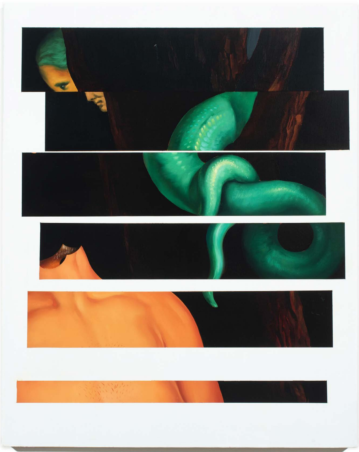
Untitled, 2020 Oil on linen 16 x 20 inches (40.6 x 50.8 cm) SCLA-0020