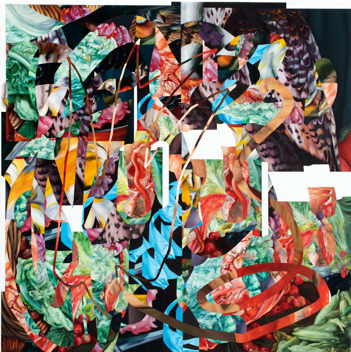
Crow and Serpent in a Landscape, 2020