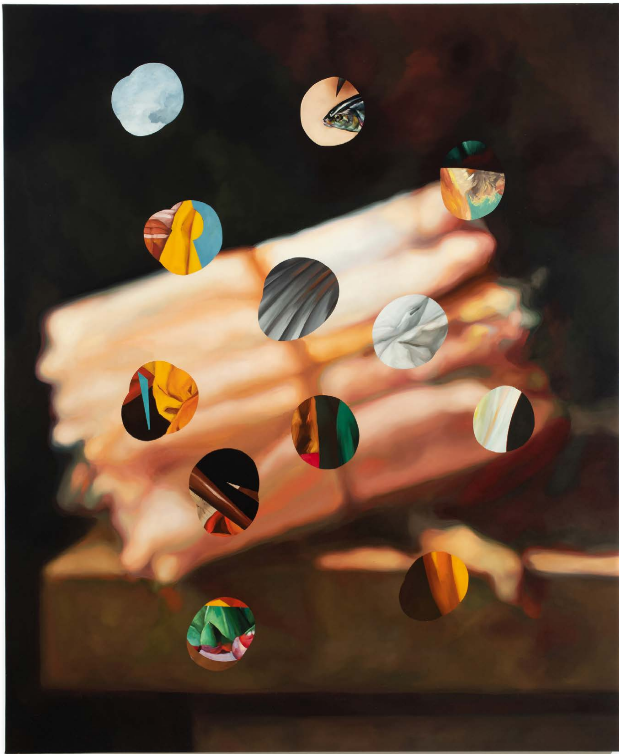
SK-A-2099, 2020 Oil on linen 63 x 52 inches (160 x 132.1cm) SCLA-0016