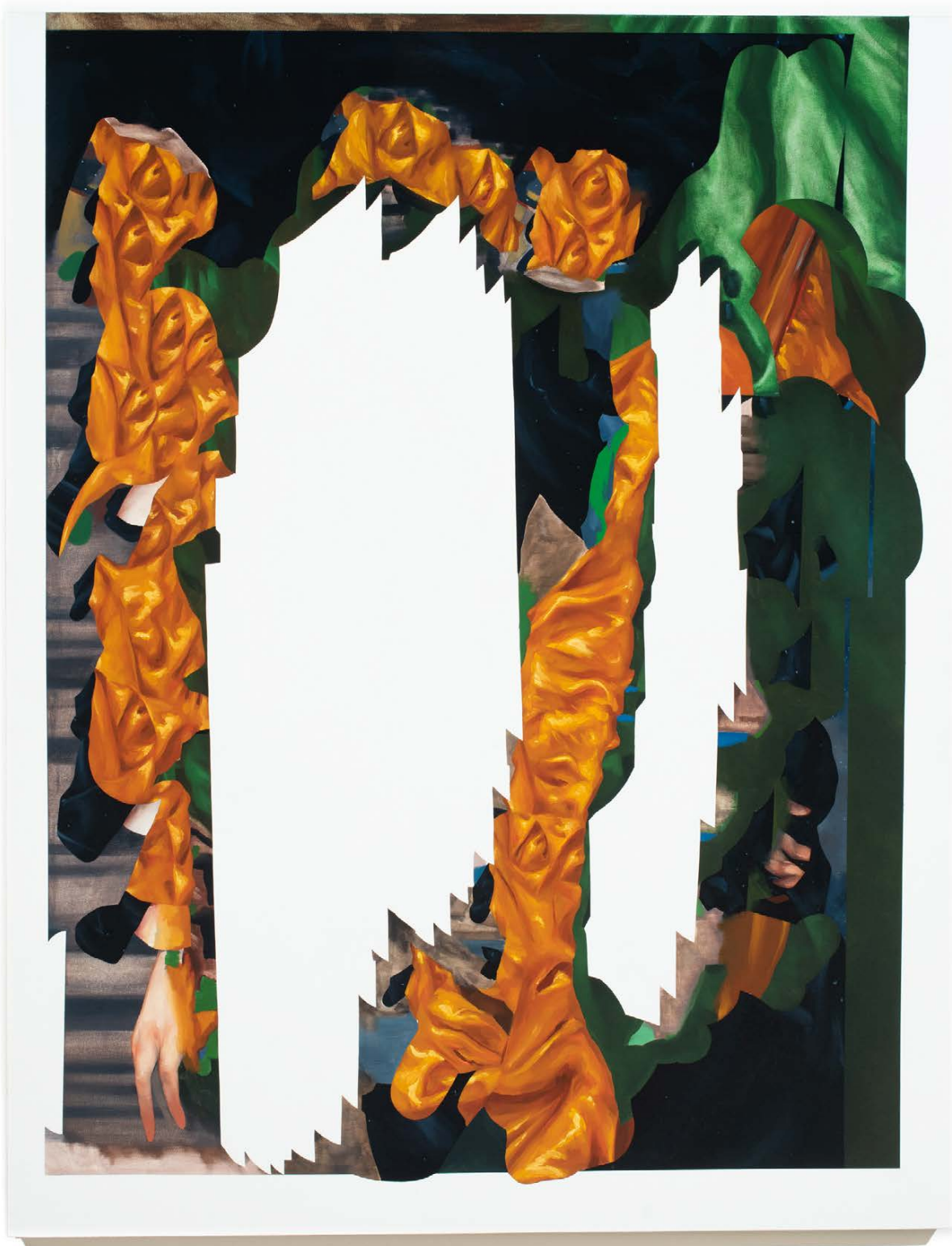
NGA1937.1.50, 2019 Oil on canvas 64 x 50 inches (162.6 x 127 cm) SCLA-0013