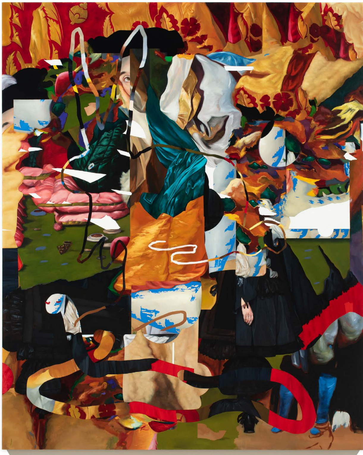
Hare and Serpent in a Landscape, 2020