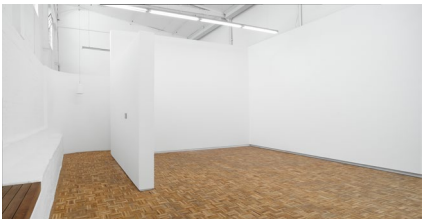
James Webb, See you in happiness (2025) | Installation view at blank projects, Cape Town