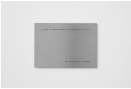
A memorial created not out of physical materials but out of social actions. 2025 Text, engraved stainless steel, magnets 12 x 18 x 0.2 cm