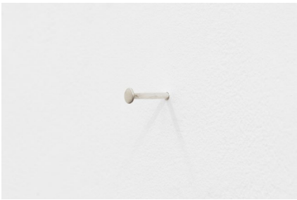
See you in happiness 2025 A silver nail forged from a WW2 Africa Service medal 10 x 1 x 1 cm