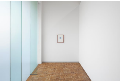
James Webb, See you in happiness (2025) | Installation view at blank projects, Cape Town