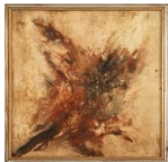
Hind Nasser NASS/M 1 Untitled, 1978 oil on canvas, 90 x 90 cm Price on request