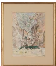
Hind Nasser NASS/P 1 Petra I, 1987 ink on paper, 20 x 28 cm Price on request