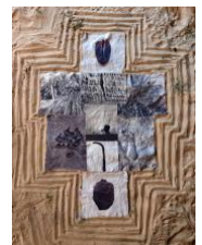
Mohammad AL Faraj ALF/D 1 Fossils of Time II, 2024 Sublimation print on fabric, dimensions variable Price on request