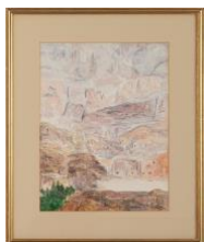
Hind Nasser NASS/P 2 Petra II, 1987 ink on paper, 20 x 28 cm Price on request