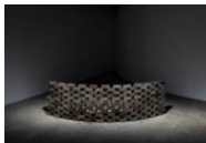
Sara Abdu ABD/I 1 Now that I have lost you in my dreams, where do we meet?, 2021 dimensions variable Courtesy of the Artist and ATHR Gallery Price on request