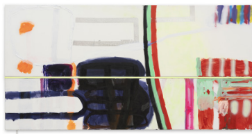
Untitled (LED) , 2025 Oil, spray paint and tape on canvas, LED strip 121 x 240 cm