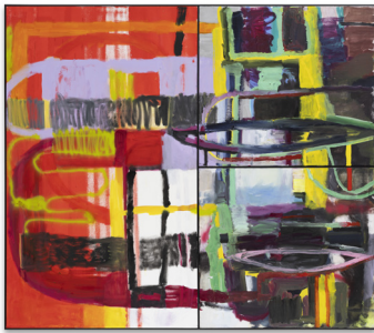
We saw you at Kaufland , 2017/2025 Acrylic, oil and spray paint on canvas, framed 203 x 235 cm