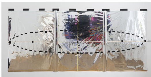
0054OX , 2024 Tape and LED strip on mirror foil 152,5 x 350 cm