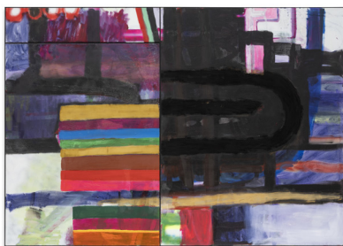
Parliament II , 2025 Acrylic, oil and spray paint on canvas, framed 172 x 242 cm