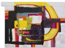
No FaceTime , 2019/2025 Acrylic, oil and tape on canvas, wood 98 x 138 cm