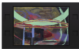
Sick-Leave , 2015/2025 Acrylic and oil on canvas, artist's frame 110 x 187 cm