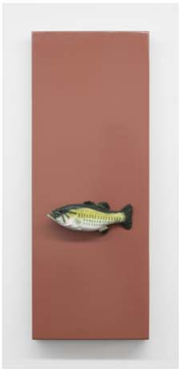
Dena Yago Chum 2020 Audio, wood, enamel, Big Mouth Billy Bass 48 x 24 x 5.5”