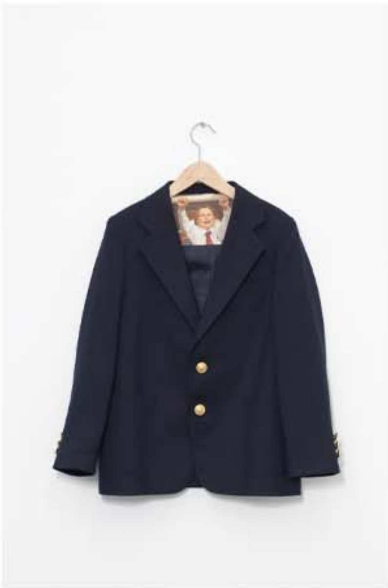
Matt Keegan Just His Size (Young American) 2016 Children’s jacket, wood hanger, powder-coated screw, mounted oil painting 25 x 17.25 x 2”