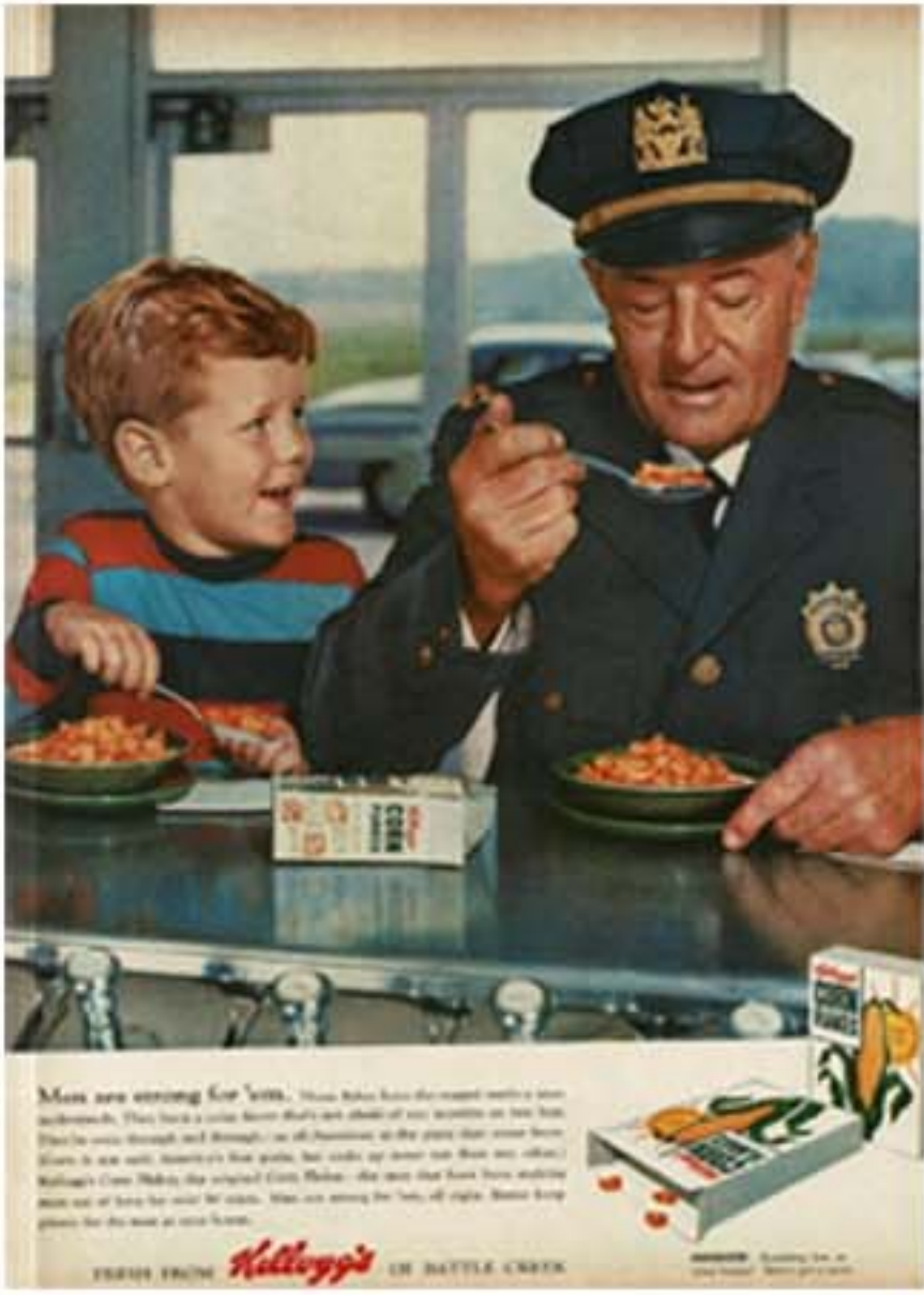
Zaid Arshad Joke (Men Are Strong For ‘Em) 1956/2025 Print on newsprint mounted to cardstock 10 x 14” (unframed) 11 x 15” (framed)