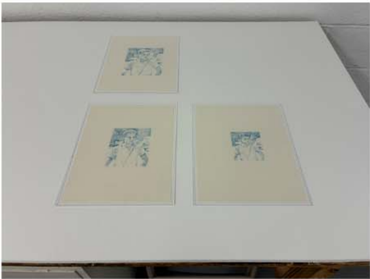
Dena Yago Untitled 2007/2025 Suites of serial drawings drafted for an unrealized Dash Snow project 9 x 11.75” each