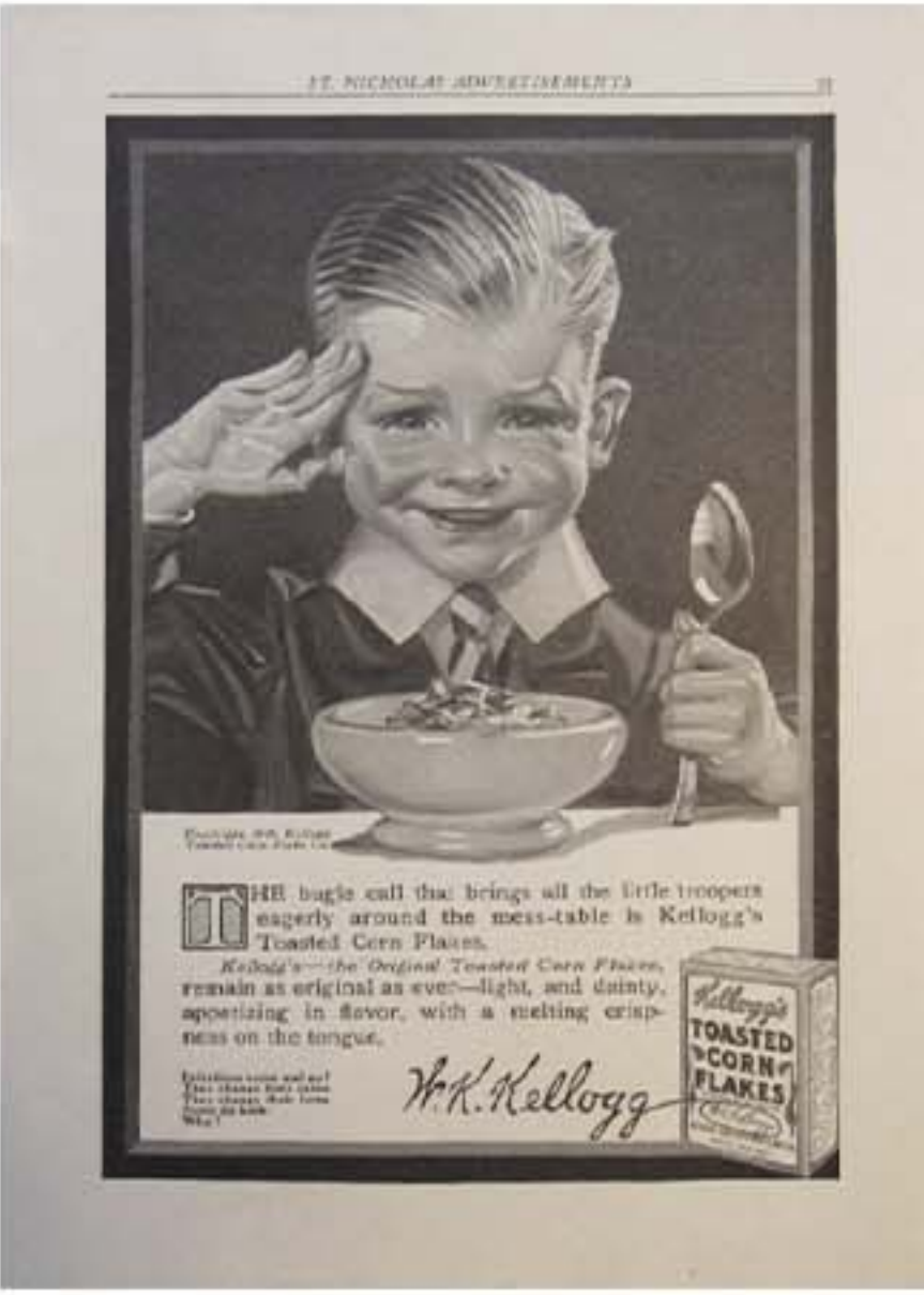
Zaid Arshad Joke (The Bugle Call) 1916/2025 Print on newsprint mounted to cardstock 7.15 x 9.75” (unframed) 8.5 x 11” (framed)