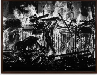
Robert Longo Untitled (Burning Down the House: Homage to Franz Kline) , 2025 charcoal on mounted paper 95" x 126-1/2" (241.3 cm x 321.3 cm), image 102-1/2" x 133-3/4" x 4-9/16" (260.4 cm x 339.7 cm x 11.6 cm), frame No. 96031