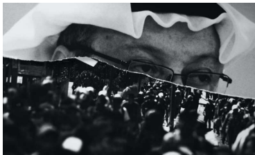
Robert Longo Icarus Rising , 2019 black and white film with sound 0:9:44 (9min, 44sec) 5933 × 2160 pixels No. 96035.EC