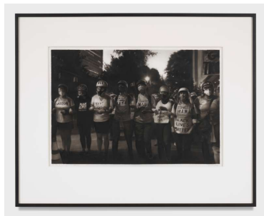
Robert Longo Study of Wall of Moms - Portland, 2020 ink and charcoal on vellum 21" × 31-1/4" (53.3 cm × 79.4 cm), image 35-5/8" × 44-5/8" × 1-1/2" (90.5 cm × 113.3 cm × 3.8 cm), frame No. 78236