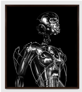
Robert Longo Untitled ("Why?") , 2025 charcoal on mounted paper 80" × 70" (203.2 cm × 177.8 cm), image 85" × 75" × 3-9/16" (215.9 cm × 190.5 cm × 9 cm), frame No. 96030