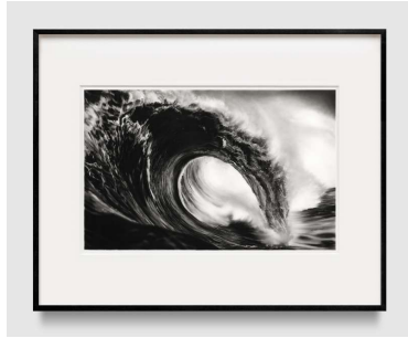
Robert Longo Study of Holy Whole , 2025 ink and charcoal on vellum 20-3/4" × 33" (52.7 cm × 83.8 cm), image 35-3/8" × 46-3/8" × 1-1/2" (89.9 cm × 117.8 cm × 3.8 cm), frame No. 95778