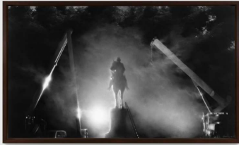
Robert Longo Untitled (Nathan Bedford Forrest Statue Removal: Memphis, 2017) , 2018 charcoal on mounted paper 70" x 120" (177.8 cm x 304.8 cm), image 77-1/8" x 127-1/8" x 4" (195.9 cm x 322.9 cm x 10.2 cm), frame No. 78235