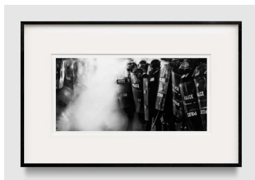
Robert Longo Study of Riot Cops, Charlotte, NC , 2017 ink and charcoal on vellum 15-3/4" × 32-15/16" (40 cm × 83.7 cm), image 29-1/4" × 45-1/4" × 1-1/2" (74.3 cm × 114.9 cm × 3.8 cm), frame No. 78709