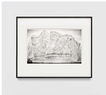
Robert Longo Study of Iceberg Crown, 2025 ink and charcoal on vellum 20-15/16" × 32-5/16" (53.2 cm × 82.1 cm), image 35-5/8" × 45-3/4" × 1-1/2" (90.5 cm × 116.2 cm × 3.8 cm), frame No. 95773