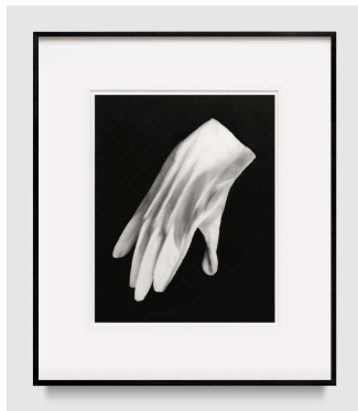
Robert Longo Study of White Glove for Leon, 2018 ink and charcoal on vellum 26-1/2" × 21" (67.3 cm × 53.3 cm), image 40-7/8" × 34-1/8" × 1-1/2" (103.8 cm × 86.7 cm × 3.8 cm), frame No. 95938