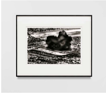
Robert Longo Study of Air Strike B , 2019 ink and charcoal on vellum 21-1/16" x 30-3/8" (53.5 cm x 77.2 cm), image 35-3/4" x 43-3/4" x 1-1/2" (90.8 cm x 111.1 cm x 3.8 cm), frame No. 95939