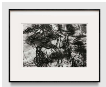
Robert Longo Study of Ukrainian + Russian Tank Battle, 2023 ink and charcoal on vellum 21-1/8" × 31-1/2" (53.7 cm × 80 cm), image 35-3/4" × 44-7/8" × 1-1/2" (90.8 cm × 114 cm × 3.8 cm), frame No. 90724