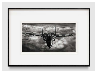
Robert Longo Study of Jet in Storm , 2025 ink and charcoal on vellum 17-5/8" × 33-1/8" (44.8 cm × 84.1 cm), image 32-1/4" × 46-1/2" × 1-1/2" (81.9 cm × 118.1 cm × 3.8 cm), frame No. 95772