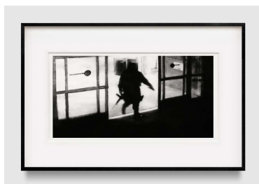
Robert Longo Study of College Shooter, June 7, 2013 - Santa Monica/Surveillance Video , 2017 ink and charcoal on vellum 17-1/2" × 34" (44.5 cm × 86.4 cm), image 31-7/8" × 47-3/8" × 1-1/2" (81 cm × 120.3 cm × 3.8 cm), frame No. 95936