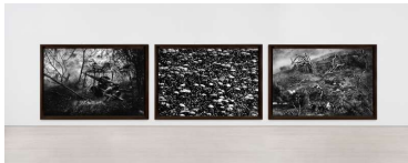
Robert Longo The Weight of Hope (War, Religion, Nature) , 2025 charcoal on mounted paper 93-1/4" × 140" (236.9 cm × 355.6 cm), each image 100-1/2" × 147-1/4" × 4-9/16" (255.3 cm × 374 cm × 11.6 cm), each frame No. 95759