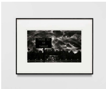
Robert Longo Study of No Threat, Mar-a-Lago , 2025 ink and charcoal on vellum 18-5/8" x 32" (47.3 cm x 81.3 cm), image 33-1/4" x 45-3/8" x 1-1/2" (84.5 cm x 115.3 cm x 3.8 cm), frame No. 96217