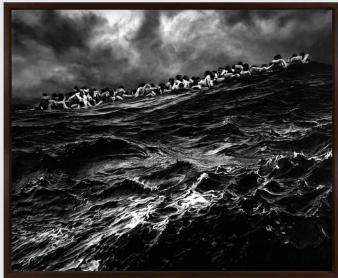
Robert Longo Untitled (Refugees At Mediterranean Sea, Sub-Saharan Migrants, July 25, 2017) , 2018 charcoal on mounted paper 97" x 120" (246.4 cm x 304.8 cm), image 102-1/4" x 125-1/4" x 5-1/8" (259.7 cm x 318.1 cm x 13 cm), frame No. 94171