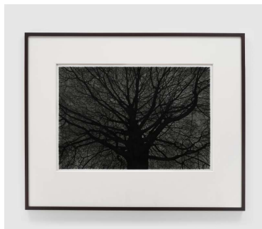
Robert Longo Study of Dark Tree , 2023 ink and charcoal on vellum 21" × 31-7/16" (53.3 cm × 79.9 cm), image 35-5/8" × 44-3/4" × 1-1/2" (90.5 cm × 113.7 cm × 3.8 cm), frame No. 89533