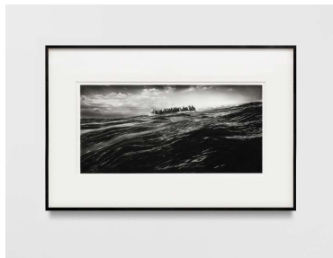
Robert Longo Study of Raft at Sea , 2025 ink and charcoal on vellum 16-1/2" × 33-1/16" (41.9 cm × 84 cm), image 31-1/8" × 46-1/2" × 1-1/2" (79.1 cm × 118.1 cm × 3.8 cm), frame No. 95774