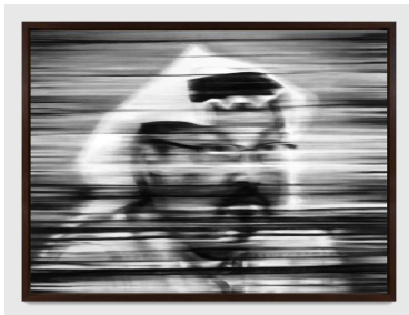
Robert Longo Untitled (Jamal Ahmad Khashoggi; Istanbul, Turkey; October 2, 2018) , 2019 charcoal on mounted paper 87-1/2" x 120" (222.3 cm x 304.8 cm), image 93-3/8" x 125-7/8" x 4-3/8" (237.2 cm x 319.7 cm x 11.1 cm), frame No. 78232