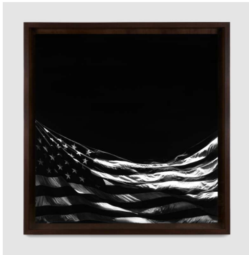
Robert Longo Untitled (Ascending Flag) , 2023 charcoal on mounted paper 100" × 96" × 1-5/8" (254 cm × 243.8 cm × 4.1 cm), image 106-1/8" × 102-1/8" × 4-9/16" (269.6 x 259.4 x 11.6 cm), frame No. 90401