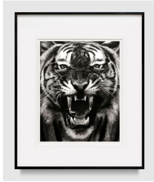
Robert Longo Study of Roaring Tiger , 2025 ink and charcoal on vellum 26-1/2" x 21" (67.3 cm x 53.3 cm), image 41-1/8" x 34-7/8" x 1-1/2" (104.5 cm x 88.6 cm x 3.8 cm), frame No. 95769