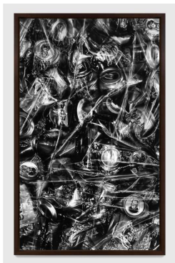
Robert Longo Untitled (Bag of Recyclables) , 2025 charcoal on mounted paper 120" × 70" (304.8 cm × 177.8 cm), image 125" × 75" × 3-9/16" (317.5 cm × 190.5 cm × 9 cm), frame No. 96032