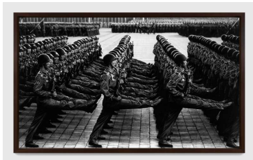
Robert Longo Untitled (Marching Soldiers; Pyongyang, North Korea: October 10, 2018) , 2019 charcoal on mounted paper 81-1/2" x 140" (207 cm x 355.6 cm), image 87-3/8" x 145-7/8" x 4-3/8" (221.9 cm x 370.5 cm x 11.1 cm), frame No. 95869