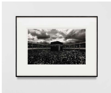
Robert Longo Study of Sunset at Mecca , 2025 ink and charcoal on vellum 20" × 33-1/2" (50.8 cm × 85.1 cm), image 34-5/8" × 46-7/8" × 1-1/2" (87.9 cm × 119.1 cm × 3.8 cm), frame No. 95775