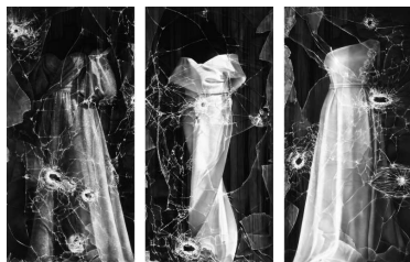
Robert Longo Untitled (The Three Graces; Donetsk, Ukraine; March 14, 2022) , 2022 charcoal on mounted paper 96" × 49" (243.8 cm × 124.5 cm), each image 103-3/8" × 56-3/8" × 4-9/16" (262.6 x 143.2 x 11.6cm), each frame No. 84015