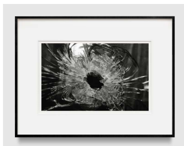
Robert Longo Study of Close Up of Bullethole, Charlie Hebdo, Paris 2015 , 2023 ink and charcoal on vellum 20-5/16" × 33-1/16" (51.6 cm × 84 cm), image 35" × 46-1/2" × 1-1/2" (88.9 cm × 118.1 cm × 3.8 cm), frame No. 90405