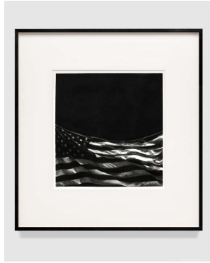
Robert Longo Study of Dropping Flag , 2023 ink and charcoal on vellum 22-7/16" × 21-1/8" (57 cm × 53.7 cm), image 37-1/8" × 34-3/8" × 2" (94.3 cm × 87.3 cm × 5.1 cm), frame No. 89256