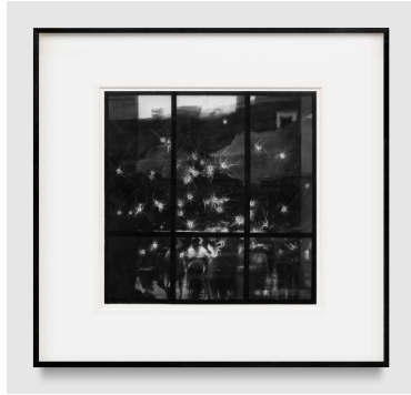
Robert Longo Study of Dallas Bullet Holes , 2017 ink and charcoal on vellum 22-1/8" × 22-1/4" (56.2 cm × 56.5 cm), image 36-1/2" × 35-3/8" × 1-1/2" (92.7 cm × 89.9 cm × 3.8 cm), frame No. 95937