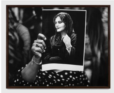
Robert Longo Untitled (Protest for Mahsa Amini; Iranian Embassy, Brussels; September 23, 2022) , 2024 charcoal on mounted paper 70" × 88-1/4" (177.8 cm × 224.2 cm), image 75" × 93-1/4" × 3-9/16" (190.5 cm × 236.9 cm × 9 cm), frame No. 90264