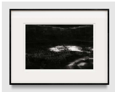
Robert Longo Study of Women in White, State of the Union 2019 , 2019 ink and charcoal on vellum 21-1/8" x 31-1/16" (53.7 cm x 78.9 cm), image 35-3/4" x 45-3/8" x 1-1/2" (90.8 cm x 115.3 cm x 3.8 cm), frame No. 78257