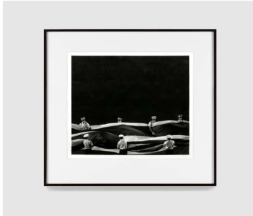
Robert Longo Study of End of Empire , 2023 Ink and charcoal on vellum 21-1/16" × 25-5/16" (53.5 cm × 64.3 cm), image 35-3/4" × 38-5/8" × 1-1/2" (90.8 cm × 98.1 cm × 3.8 cm), frame No. 87948