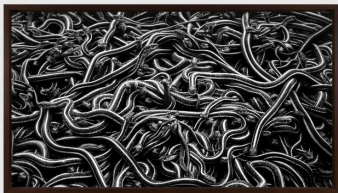
Robert Longo Untitled (Snake Pit) , 2025 charcoal on mounted paper 65" x 120" (165.1 cm x 304.8 cm), image 70" x 125" x 3-9/16" (177.8 cm x 317.5 cm x 9 cm), frame No. 95899