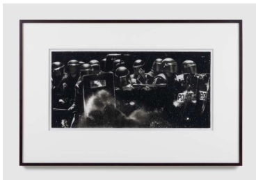
Robert Longo Study of Riot Cops w/ Tear Gas Guns + Shields , 2018 ink and charcoal on vellum 15-7/8" x 33" (40.3 cm x 83.8 cm), image 30-1/4" x 46-1/8" x 1-1/2" (76.8 cm x 117.2 cm x 3.8 cm), frame No. 81005