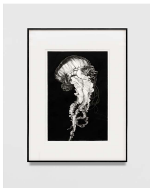
Robert Longo Study of God Jellyfish , 2025 ink and charcoal on vellum 30-7/8" x 21" (78.4 cm x 53.3 cm), image 45-1/2" x 34-3/8" x 1-1/2" (115.6 cm x 87.3 cm x 3.8 cm), frame No. 95770