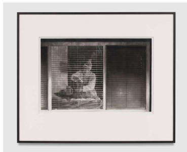
Robert Longo Study of ICU , 2020, 2021 ink and charcoal on vellum 21-5/16" × 31-3/8" (54.1 cm × 79.7 cm), image 37-7/8" × 44-3/4" × 1-1/2" (96.2 cm × 113.7 cm × 3.8 cm), frame No. 78518