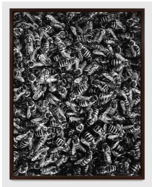
Robert Longo Untitled (Honey Bee Hive) , 2025 charcoal on mounted paper 88-1/4" x 70" (224.2 cm x 177.8 cm), image 93-1/4" x 75" x 3-9/16" (236.9 cm x 190.5 cm x 9 cm), frame No. 95940