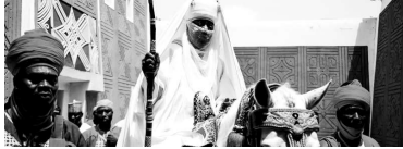
Robert Longo Untitled (Image Storm, July 4, 2024–September 9, 2025), 2025 black and white film dimensions variable 5933 × 2160 pixels No. 94784.EC