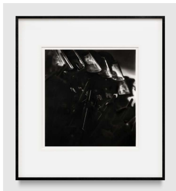
Robert Longo Study BLM / Police, 2024 ink and charcoal on vellum 22-13/16" × 21-1/16" (57.9 cm × 53.5 cm), image 37-1/2" × 34-1/2" × 1-1/2" (95.3 cm × 87.6 cm × 3.8 cm), frame No. 93655