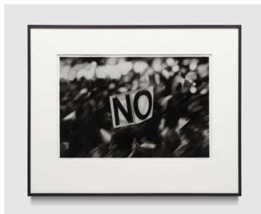
Robert Longo Study of Protest, No , 2022 ink and charcoal on vellum 21" × 31-1/2" (53.3 cm × 80 cm), image 35-5/8" × 44-7/8" × 1-1/2" (90.5 cm × 114 cm × 3.8 cm), frame No. 84020