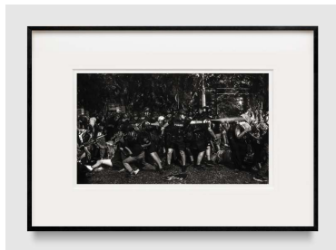
Robert Longo Study of Student Protest, May 29, 2024, 2024 ink and charcoal on vellum 19-1/16" × 33" (48.4 cm × 83.8 cm), image 33-5/8" × 46-3/8" × 1-1/2" (85.4 cm × 117.8 cm × 3.8 cm), frame No. 94761