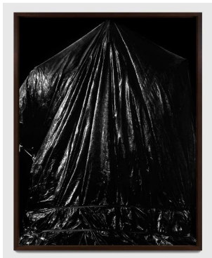
Robert Longo Untitled (Statue of Confederate General Robert E. Lee Covered; Charlottesville, Virginia; August 2017) , 2018 charcoal on mounted paper 120" × 95-1/4" (304.8 cm × 241.9 cm), image 125-1/4" × 100-1/2" × 5-1/8" (318.1 cm × 255.3 cm × 13 cm), frame No. 95552