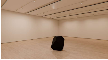
Robert Longo Untitled (Dürer's Solid in Black) , 2025 auto lacquer on stainless steel 48" x 48" x 48" (121.9 cm x 121.9 cm x 121.9 cm) No. 96103