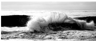
Robert Longo Untitled (Sea of Change, An Homage to Winslow Homer) , 2022 Quicktime Movie, Black and White with Stereo Audio 0:10:35 (10min, 35sec) 4096 × 1716 pixels No. 84014.EC