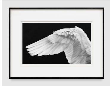
Robert Longo Study of Open Wing , 2025 ink and charcoal on vellum 19-1/4" × 32-5/16" (48.9 cm × 82.1 cm), image 33-7/8" × 45-3/4" × 1-1/2" (86 cm × 116.2 cm × 3.8 cm), frame No. 95771