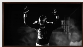
Robert Longo Untitled (Kenny Britt, St. Louis Rams; Hands Up) , 2014 charcoal on mounted paper 65" × 120" (165.1 cm × 304.8 cm), image 66-1/8" × 121-1/8" × 3-1/8" (168 cm × 307.7 cm × 7.9 cm), frame No. 96331