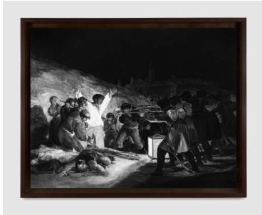
Robert Longo Untitled (After Goya: The Third of May 1808, 1814) , 2024 charcoal on mounted paper 90" x 116-5/8" (228.6 cm x 296.2 cm), image 96-1/8" x 122-3/4" x 4-9/16" (244.2 cm x 311.8 cm x 11.6 cm), frame No. 91073