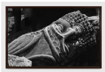
Robert Longo Untitled (Destroyed Head of Lamassu, Nineveh) , 2017 charcoal on mounted paper 88-1/2" x 140" (224.8 cm x 355.6 cm), image 93-3/4" x 145-1/4" x 5-1/8" (238.1 cm x 368.9 cm x 13 cm), frame No. 78175