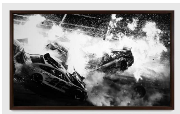
Robert Longo Untitled (Daytona Crash) , 2025 charcoal on mounted paper 70" x 120" (177.8 cm x 304.8 cm), image 75" x 125" x 3-9/16" (190.5 cm x 317.5 cm x 9 cm), frame No. 96033