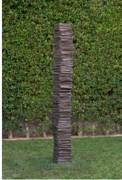
Robert Longo Untitled (A Column of Time: One Year of The New York Times, March 2020–March 2021) , 2021 cast bronze, steel plate 118" × 13-1/2" × 13-1/2" (299.7 cm × 34.3 cm × 34.3 cm), column 40" × 40" × 3/8" (101.6 cm × 101.6 cm × 1 cm), steel plate No. 79374.01

New York - 540 West 25th Street, 1F, 2F, 3F & 7F 2025-09-10 to 2025-10-25