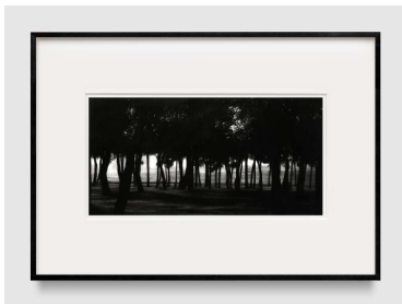
Robert Longo Study of Brooklyn Forest , 2025 ink and charcoal on vellum 16-1/2" x 33" (41.9 cm x 83.8 cm), image 31-1/8" x 46-3/8" x 1-1/2" (79.1 cm x 117.8 cm x 3.8 cm), frame No. 95767