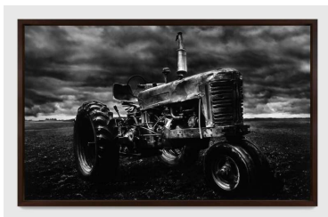
Robert Longo Untitled (American Gothic) , 2025 charcoal on mounted paper 83-3/4" × 140" (212.7 cm × 355.6 cm), image 91-7/16" × 147-1/8" × 4-9/16" (232.3 cm × 373.7 cm × 11.6 cm), frame No. 96034