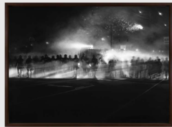
Robert Longo Untitled (Ferguson Police, August 13, 2014) , 2014 charcoal on mounted paper 86" × 120" (218.4 cm × 304.8 cm), image 87-15/16" × 121-15/16" × 4-3/16" (223.4 cm × 309.7 cm × 10.6 cm), frame No. 95868