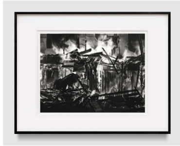
Robert Longo Study of House on Fire, 2025 ink and charcoal on vellum 21" × 28-1/16" (53.3 cm × 71.3 cm), image 35-5/8" × 45-1/2" × 1-1/2" (90.5 cm × 115.6 cm × 3.8 cm), frame No. 95777