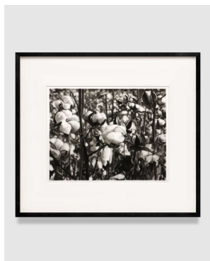
Robert Longo Study of Cotton , 2023 ink and charcoal on vellum 21-1/16" × 26-9/16" (53.5 cm × 67.5 cm), image 35-5/8" × 39-7/8" × 1-1/2" (90.5 cm × 101.3 cm × 3.8 cm), frame No. 90404