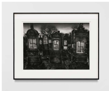
Robert Longo Study of Jewish Cemetery Strasbourg, France , 2019 ink and charcoal on vellum 21" × 31-1/2" (53.3 cm × 80 cm), image 35-5/8" × 44-7/8" × 1-1/2" (90.5 cm × 114 cm × 3.8 cm), frame No. 78710