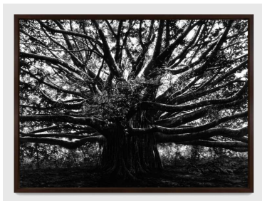
Robert Longo Medusa (Banyan Tree, Homage to J. Mitchell and J. Pollock) , 2014 charcoal on mounted paper 90" x 123-3/4" (228.6 cm x 314.3 cm), image 98" x 131-3/4" x 4" (248.9 cm x 334.6 cm x 10.2 cm), frame No. 94451