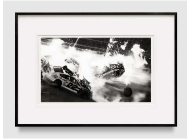
Robert Longo Study of Daytona Crash, 2025 ink and charcoal on vellum 18-5/16" × 31-1/2" (46.5 cm × 80 cm), image 33" × 45-7/8" × 1-1/2" (83.8 cm × 116.5 cm × 3.8 cm), frame No. 95768