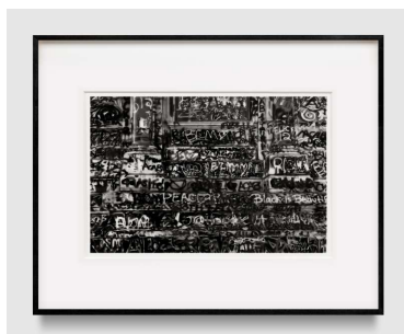
Robert Longo Study of Robert E. Lee Statue/BLM/Richmond, VA , 2025 ink and charcoal on vellum 21" x 32" (53.3 cm x 81.3 cm) 35-5/8" x 45-3/8" x 1-1/2" (90.5 cm x 115.3 cm x 3.8 cm), frame No. 95776