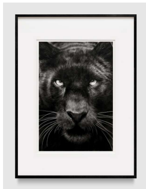
Robert Longo Study of Black Panther (Nathan) , 2025 ink and charcoal on vellum 31-1/16" × 20-15/16" (78.9 cm × 53.2 cm), image 45-3/4" × 34-3/8" × 1-1/2" (116.2 cm × 87.3 cm × 3.8 cm), frame No. 95779