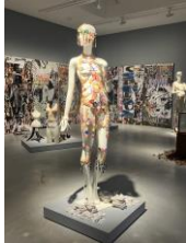
Grisette , 2025. Dress made from porcupine quills, French 1920s–30s mother of pearl and cow bone casino chips, from Collection 009: Dead Currency, on Schläppi 6000 Aloof mannequin, manufactured by Bonaveri, Italy, on loan from The Metropolitan Museum of Art, New York. Courtesy the artist.