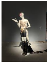
Grisette , 2025. Bobcat fur jacket from Collection 008: Indestructible Dollhead, mid-century millinery frames, brass paw shoes from Collection 007: ENFER, on Schläppi 6000 Aloof mannequin, manufactured by Bonaveri, Italy, on loan from The Metropolitan Museum of Art, New York.