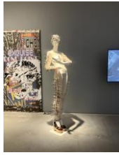
Grisette , 2025. Porcupine quill bodysuit and veil from Collection 009: Dead Currency, 1930s shoes, on Schläppi 6000 Aloof mannequin, manufactured by Bonaveri, Italy, on loan from The Metropolitan Museum of Art, New York. Courtesy the artist.