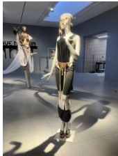
Grisette , 2025. Mask made from French antique wooden liquor tokens, cow bone casino chips, and ermine tails, from Collection 009: Dead Currency, 1930s shoes, on Schläppi 6000 Aloof mannequin, manufactured by Bonaveri, Italy, on loan from The Metropolitan Museum of Art, New York. Courtesy the artist.