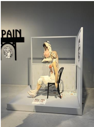
Videofashion Vault I , 2025

Left: Ermine fur jacket, shearling, and casino chip corset from Collection 009: Dead Currency, deer hoof heels, on historical mannequin (Gossipy Ladies) on loan from The Metropolitan Museum of Art, New York. Courtesy the artist.