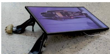
Enfer on Shoes , 2024. Recording of Collection 007: ENFER runway show, found heels with brass paws, TV Screen, steel. Courtesy Company Gallery and the artist.