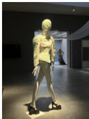
Grisette , 2025. Shattered safety glass jacket from Collection 008: Indestructible Dollhead, 1920s shoes, on Schläppi 6000 Aloof mannequin, manufactured by Bonaveri, Italy, on loan from The Metropolitan Museum of Art, New York.