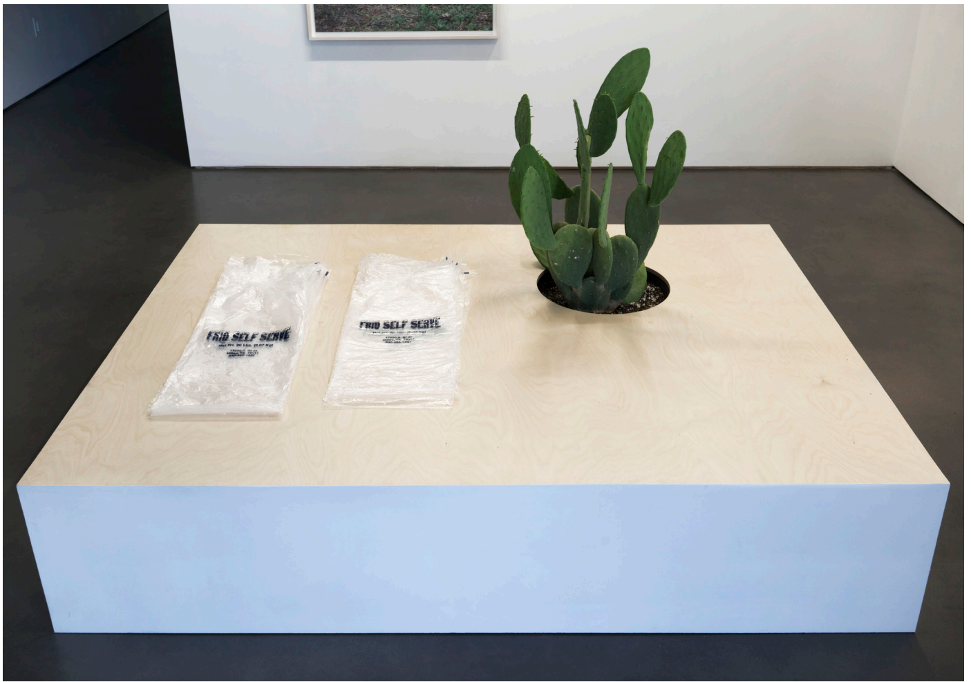
Shimabuku Cactus and Ice, 2016 Opuntia cactus, plastic ice bags, wooden pedestal Pedestal: 150 x 200 cm, cactus height variable