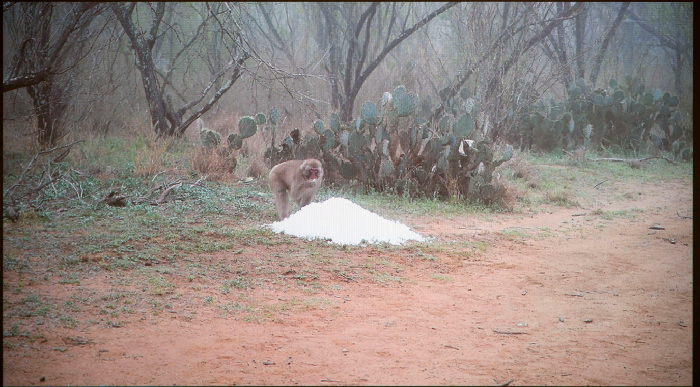
Shimabuku Do snow monkeys remember snow mountains?, 2016 HD video projection, vinyl wall text 20 minutes, looped Edition 1 of 3