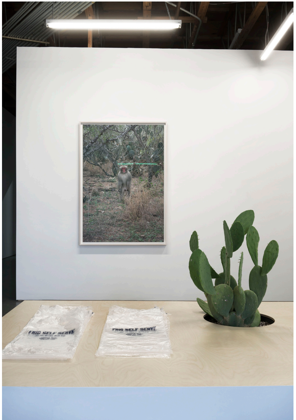
Shimabuku The Snow Monkeys of Texas Installation view Freedman Fitzpatrick, Los Angeles May 22 –July 9, 2016