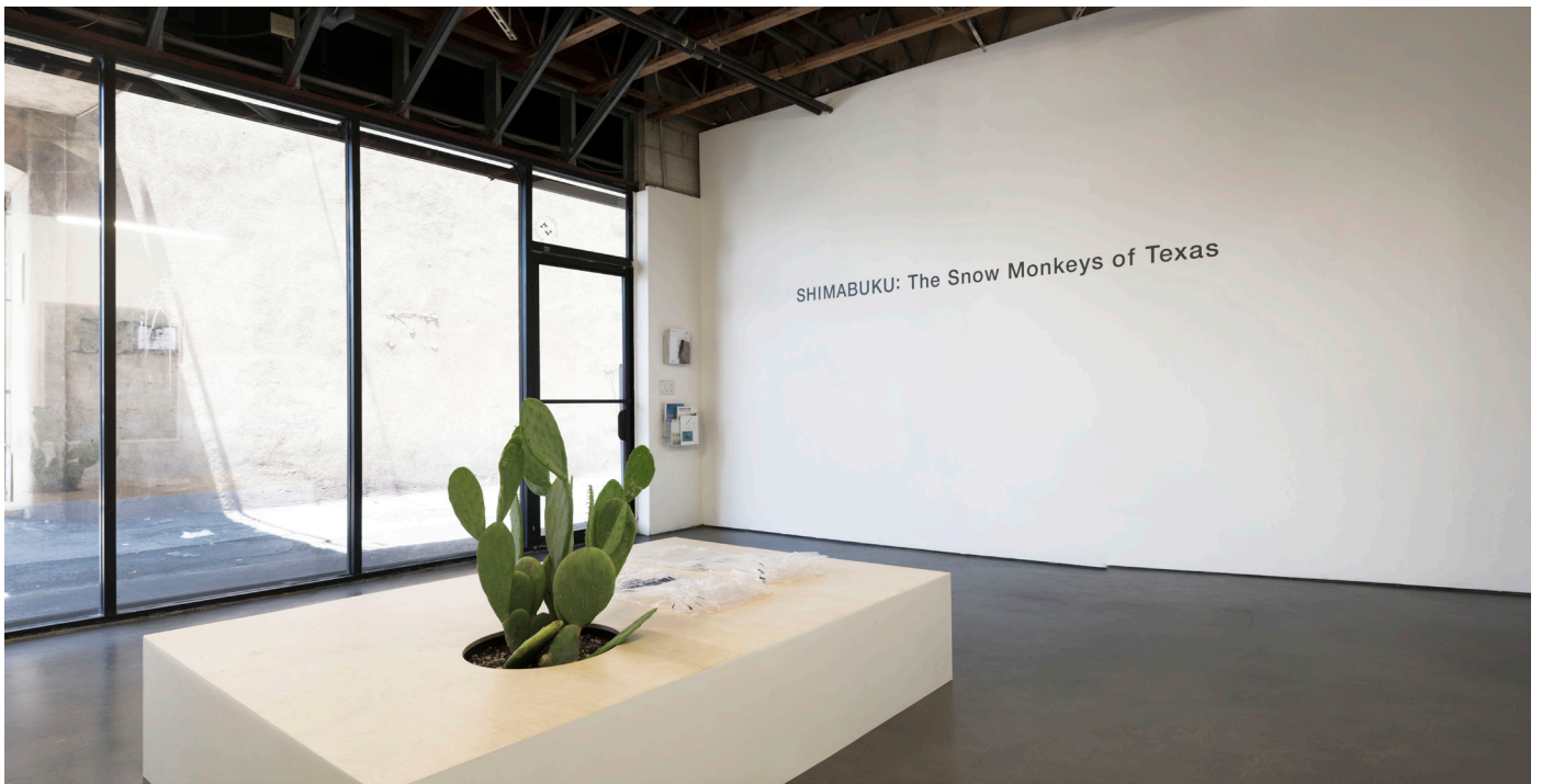
Shimabuku The Snow Monkeys of Texas Installation view Freedman Fitzpatrick, Los Angeles May 22 –July 9, 2016