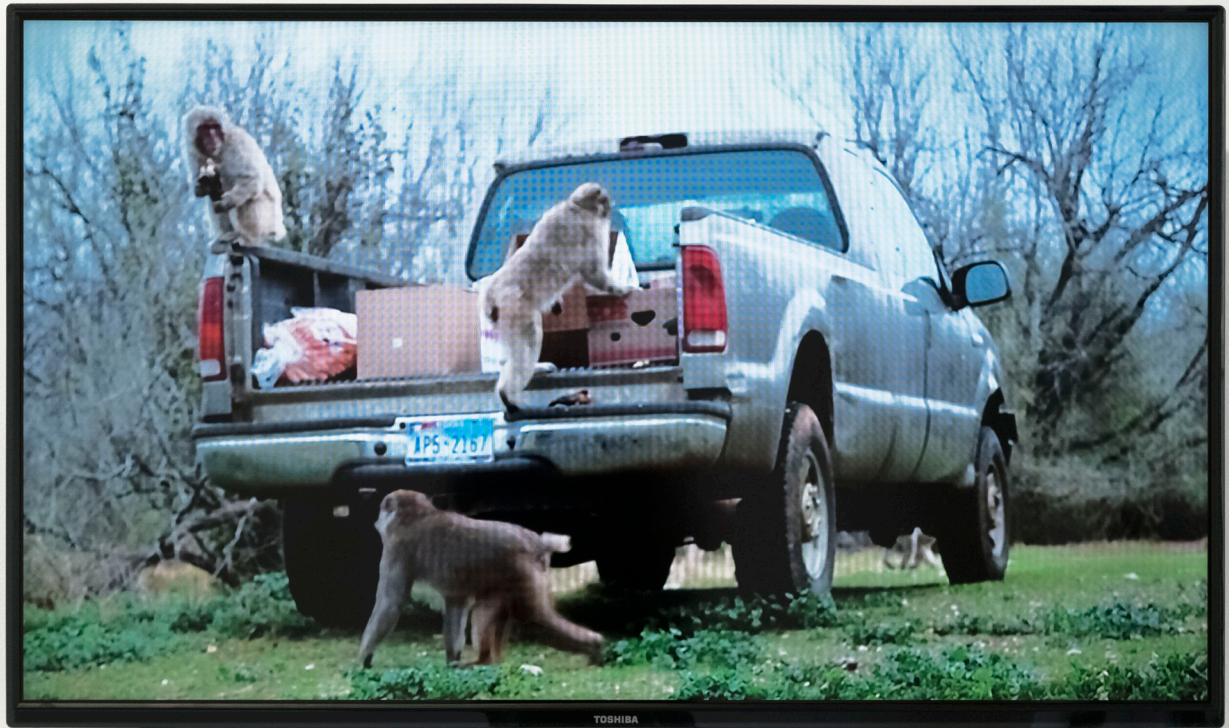
Shimabuku Snow Monkey Chow, 2016 HD video 2 minutes, looped Edition 1 of 3