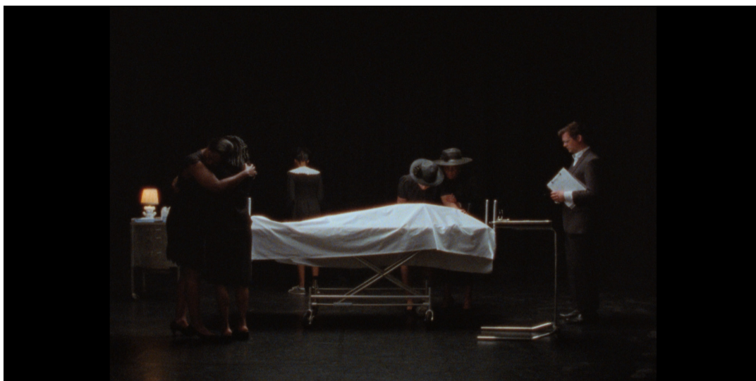
Filmstill Cette Maison , © Miryam Charles