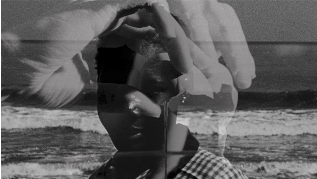
Filmstill Cette Maison , © Miryam Charles