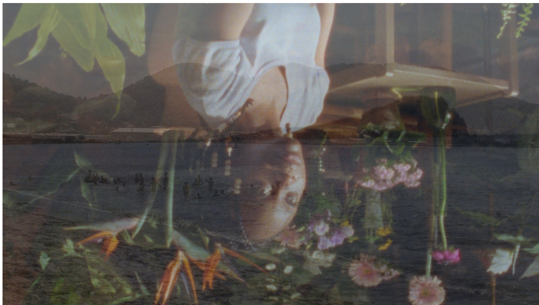
Filmstill Cette Maison , © Miryam Charles