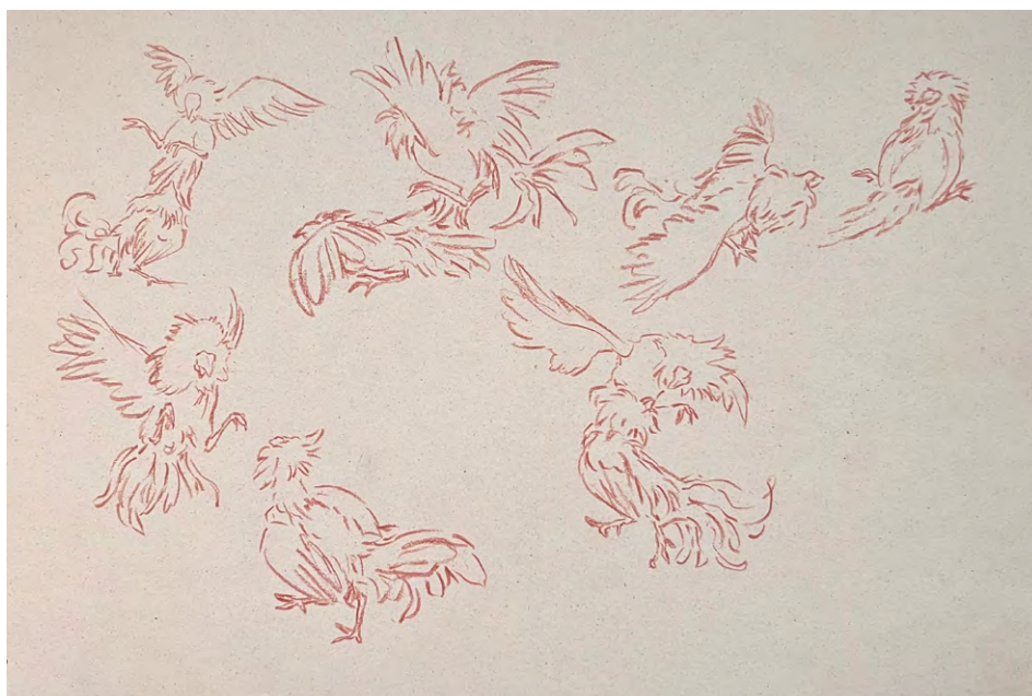
Pietro Fachini, Pelea #2 (2025), sanguine on paper, 21 x 29.7 cm

His practice has also been nourished by on-site research residencies: the Art Residency in Oaxaca (Mexico, 2024) and the Tagli Residency in Stromboli (Italy, 2023)—moments that strengthened the connection between the pictorial process, the geography of materials, and local knowledge.