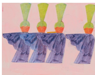
Maja Behrmann, Untitled (Parade), 2020