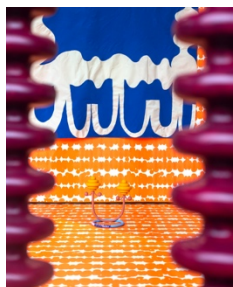
Maja Behrmann, Montage, Kunststiftung Kunze, Gifhorn, 2024, photo: Studio kela-mo