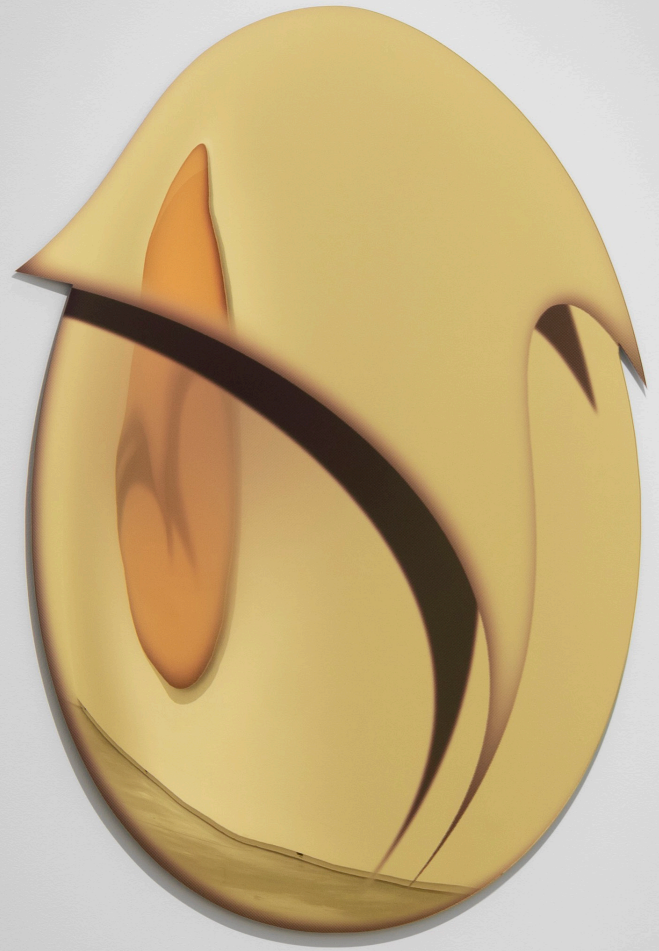
Detail of Center , 2025