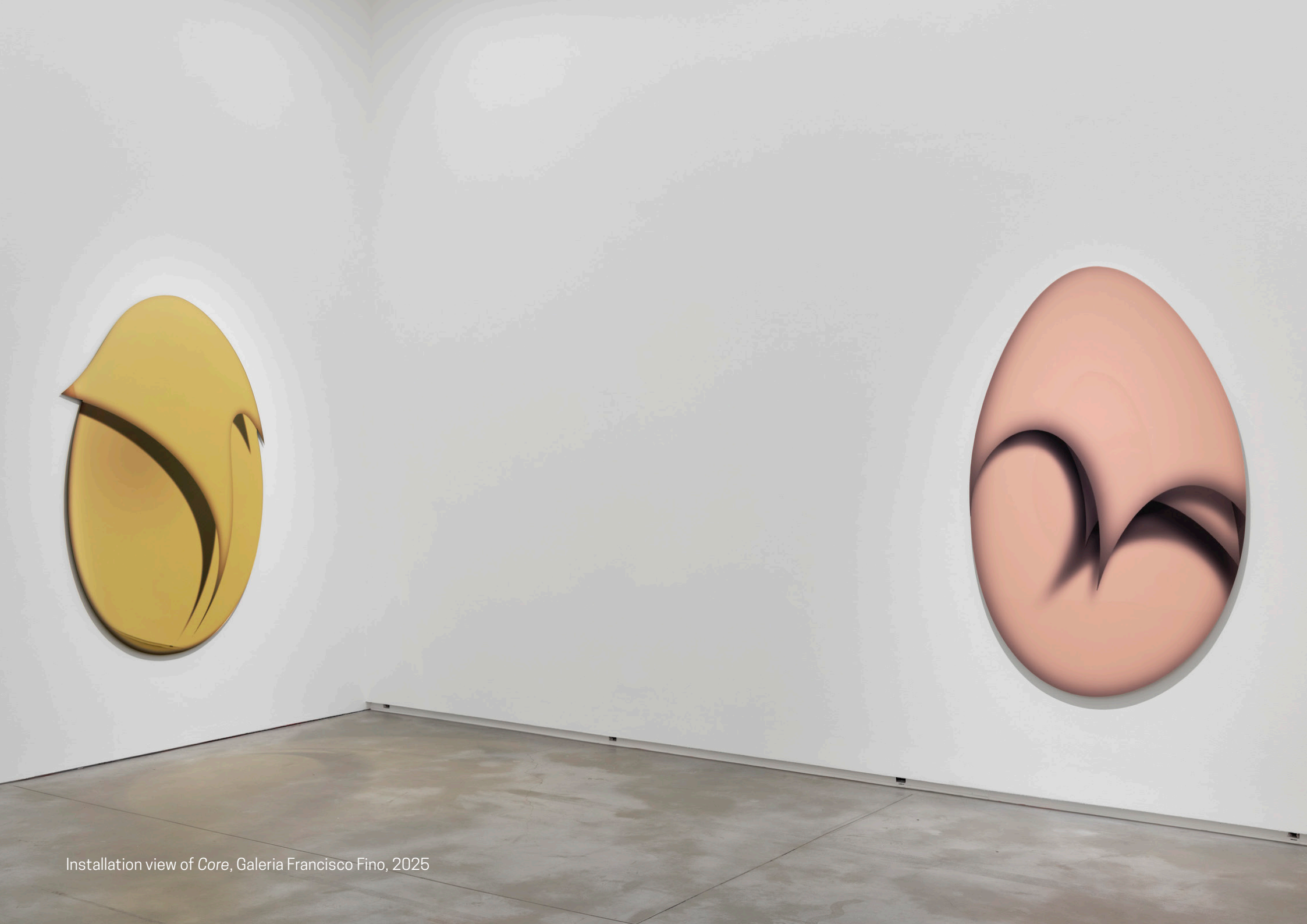
Installation view of Core , Galeria Francisco Fino, 2025