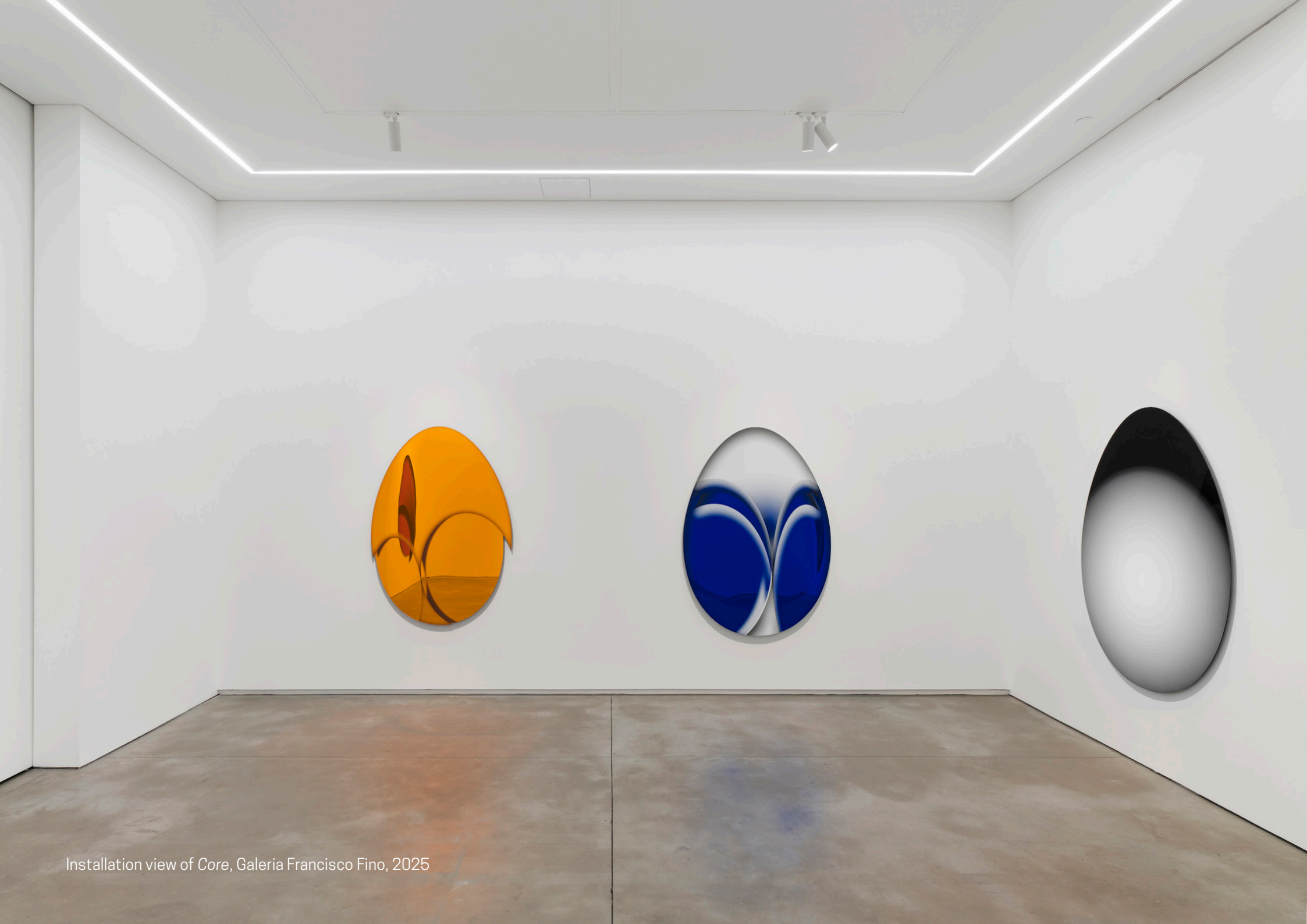
Installation view of Core , Galeria Francisco Fino, 2025