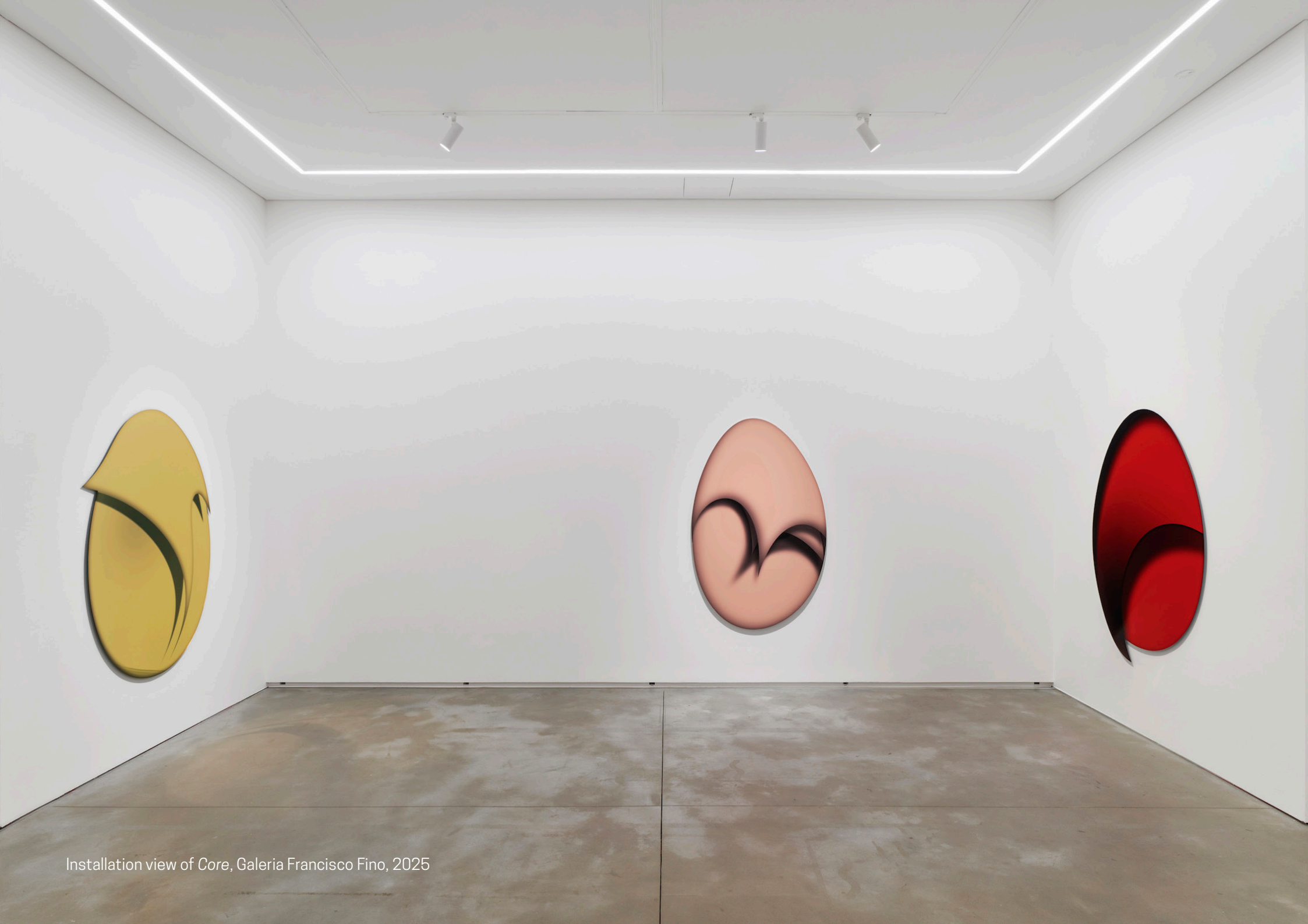
Installation view of Core , Galeria Francisco Fino, 2025