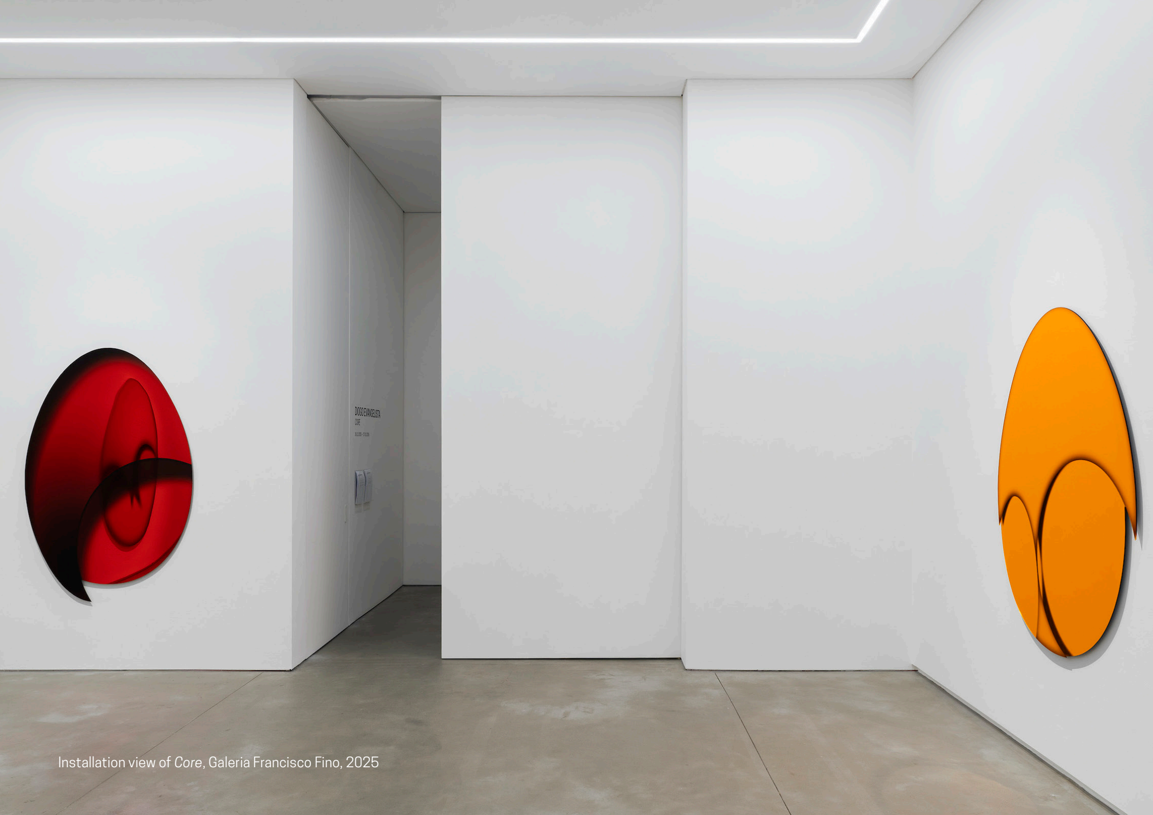
Installation view of Core , Galeria Francisco Fino, 2025