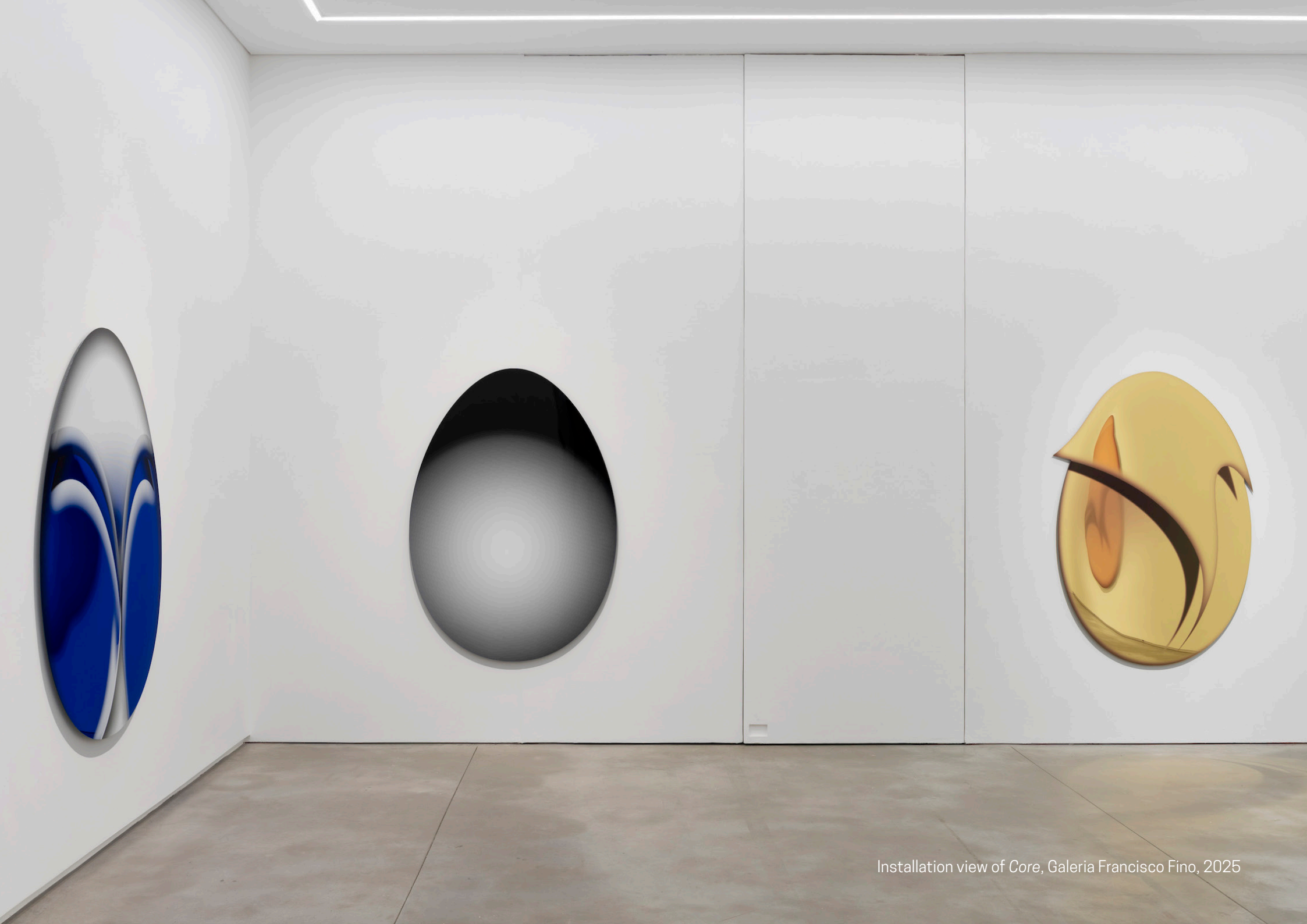
Installation view of Core , Galeria Francisco Fino, 2025