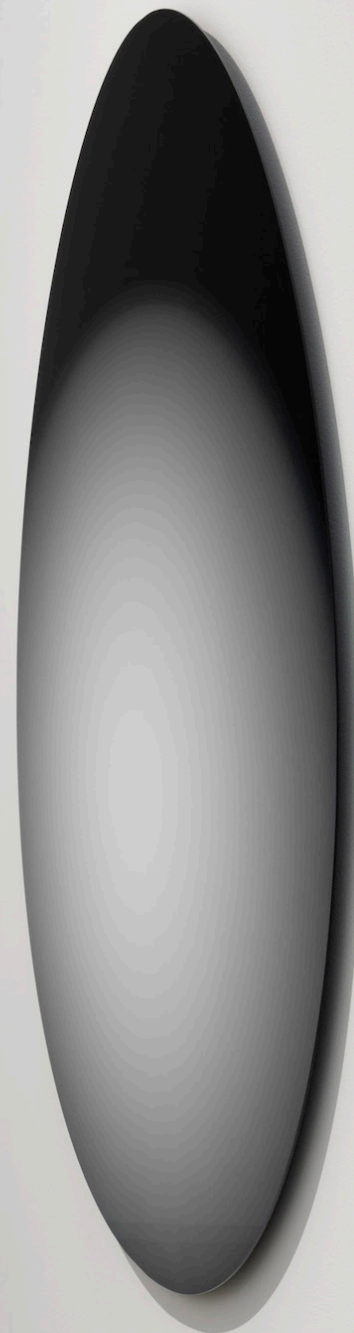
Installation view of Core , Galeria Francisco Fino, 2025