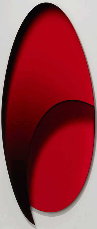
Installation view of Core , Galeria Francisco Fino, 2025