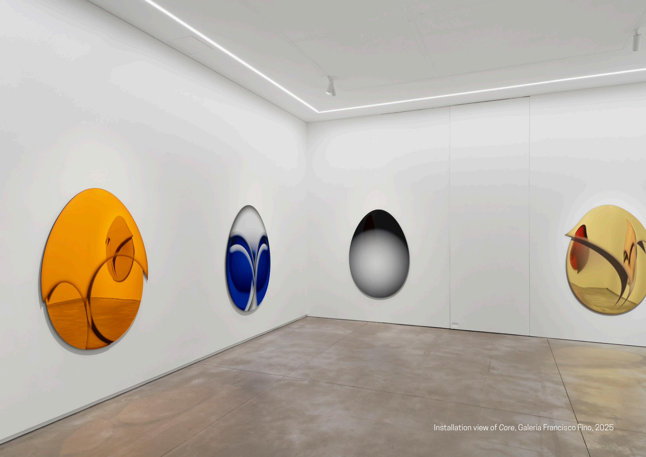
Installation view of Core , Galeria Francisco Fino, 2025