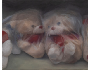
Two bears, 2025 Oil on canvas 16 x 14 x ½ inches (40.5 x 51cm)