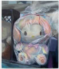
Bear in plastic (chinatown), 2025 Oil on canvas 11 x 14 x ½ inches (28 x 35.5 cm)