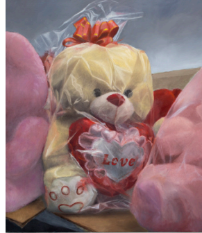
Bear in plastic (bushwick), 2025 Oil on canvas 28 x 24 inches (71 x 70 cm)