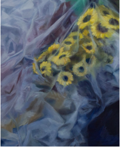
Flowers under plastic (woodside), 2025 Oil on canvas 24 x 18 x ½ inches (60 x 45.72 cm)