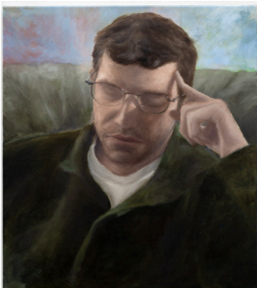
Brad, 2025 Oil on canvas 24 x 20 x ½ inches (70 x 50 cm)