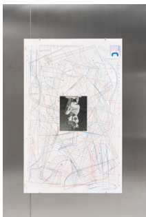
Nicolás Lamas Losing the human form , 2022 Archival pigment print on Hahnemühle paper, non-reflective museums glass and MDF, 116 x 74 cm

Courtesy of max goelitz Copyright the artist Photo: Dirk Tacke