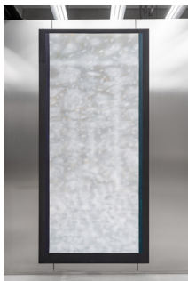
Michael Venezia Untitled JS16 , 1968 Acrylic and metal powder on canvas 246 x 117 x 3 cm