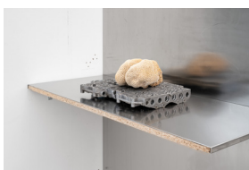
Nicolás Lamas Neurocoral , 2022 Aluminum gearbox valve body and coral 13 x 35 x 28 cm

Courtesy of max goelitz Copyright the artist Photo: Dirk Tacke