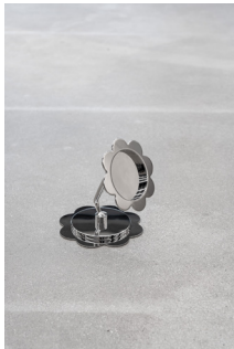
Dorota Gawęda & Eglė Kulbokaitė Yield (Twinning) , 2025 Stainless steel cast from a found object 17 x 16 x 14 cm

Courtesy of max goelitz Copyright the artist Photo: Dirk Tacke