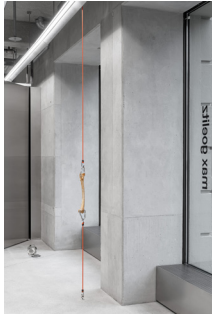
Nicolás Lamas Tendon , 2022 Human bone, carabiner and elastic rope Dimensions variable

Courtesy of max goelitz Copyright the artist Photo: Dirk Tacke