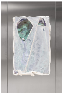
Sophronia Cook A Cap of Consciousness Over Your Head , 2025 Vinyl, silk, resin, charcoal, aluminum and parachute fabric 102 x 63.5 x 5 cm

Courtesy of max goelitz Copyright the artists Photo: Dirk Tacke