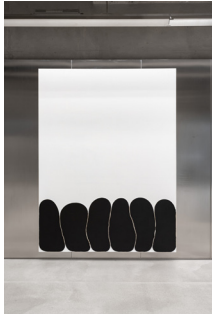
Gary Kuehn Black Painting , 1971 Acrylic on canvas 249 x 183 x 4.5 cm

Courtesy of max goelitz Copyright the artist Photo: Dirk Tacke