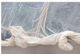
Sophronia Cook A Cap of Consciousness Over Your Head , 2025 Vinyl, silk, resin, charcoal, aluminum and parachute fabric 102 x 63.5 x 5 cm, detail

Courtesy of max goelitz Copyright the artist Photo: Dirk Tacke