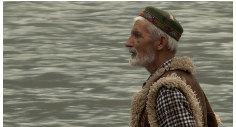
Stills from 18,000 Worlds .