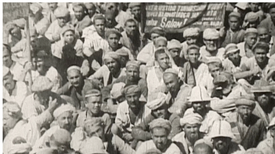
Stills from 18.000 Worlds .