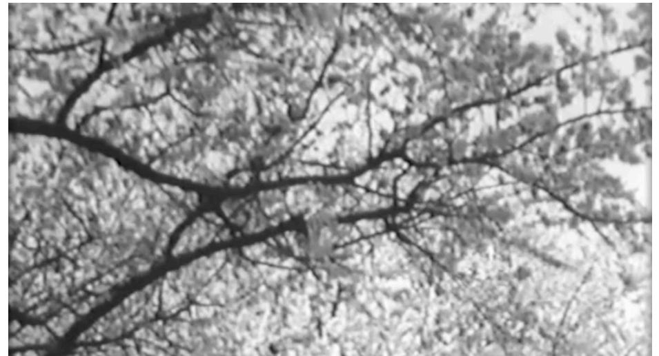
Stills from Her Right .