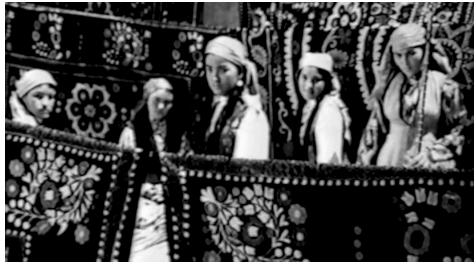
Stills from Her Right .