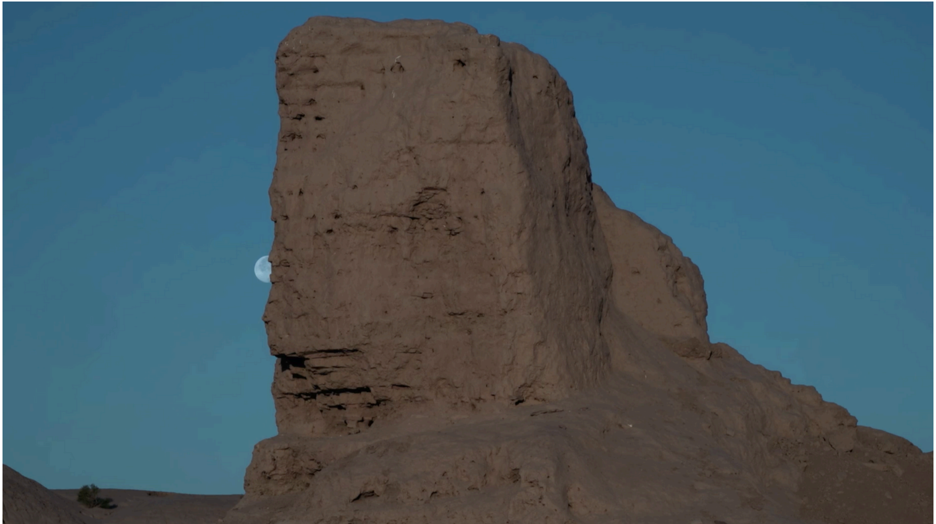
18.000 Worlds , 2023 Single-channel HD video 32'