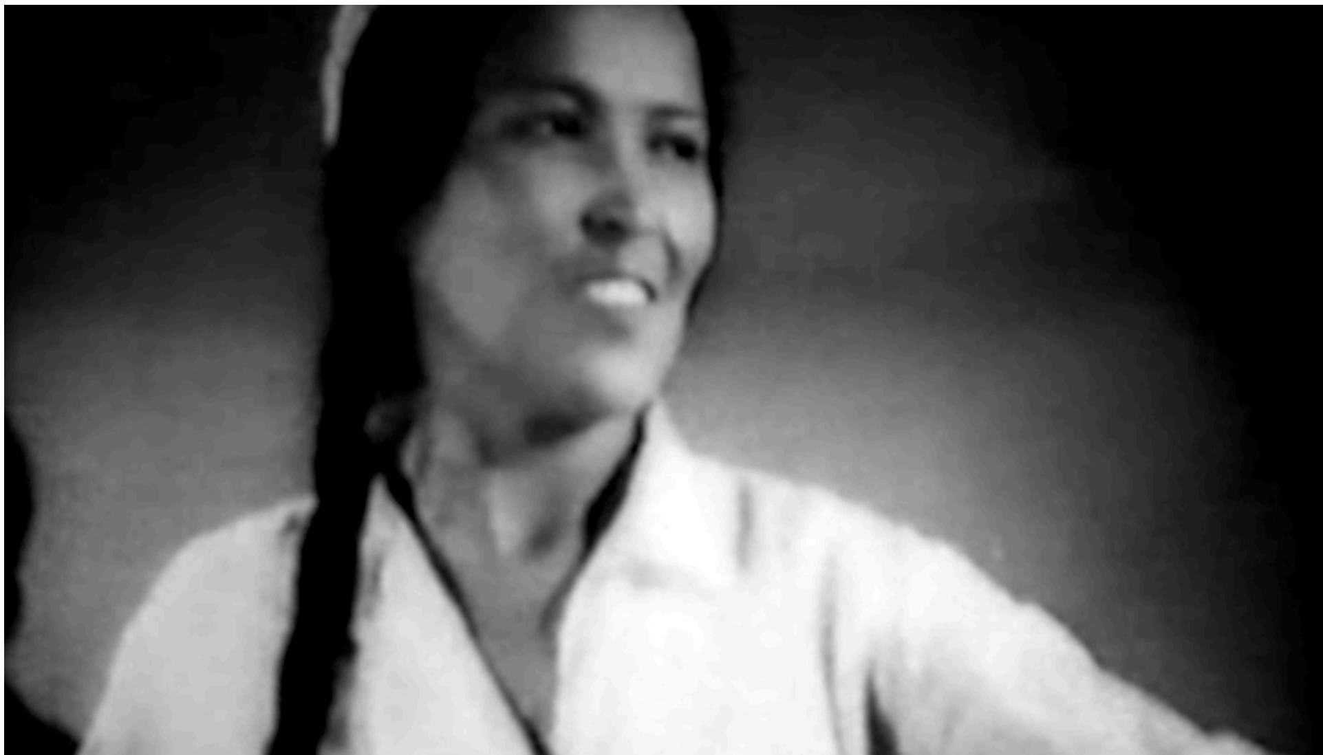
Her Right , 2020