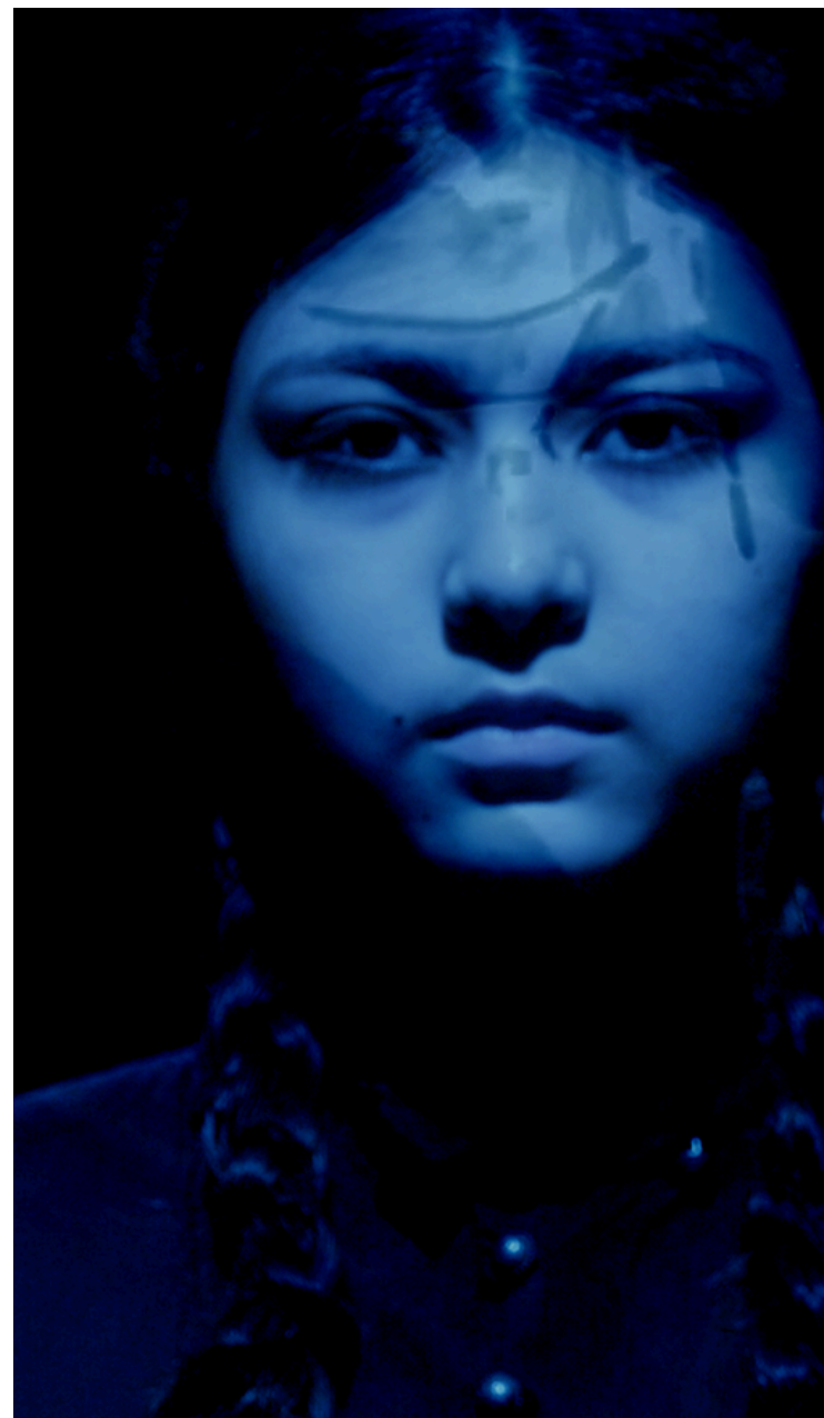
Stills from Time's Tail .