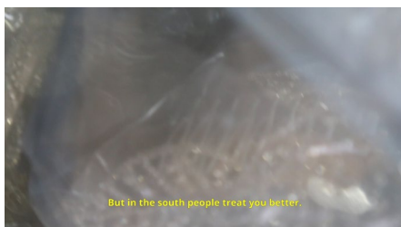
Rosa Aiello & Yutong Su, Interface or: The Daily Pressure of the Watching , 2025