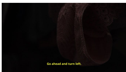
Rosa Aiello & Yutong Su, Interface or: The Daily Pressure of the Watching , 2025