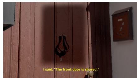
Rosa Aiello, A Good Reputation , 2025