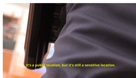
Rosa Aiello & Yutong Su, Interface or: The Daily Pressure of the Watching , 2025