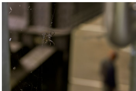
Rosa Aiello & Pitt Wenninger, Base and Superstructure , 2025