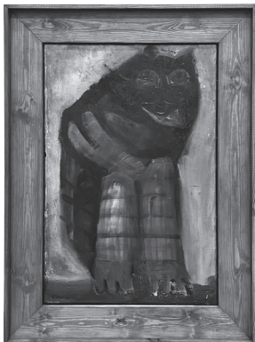
Cat in Greys , 1958 Oil on canvas 76.2 × 50.8 cm 97.8 × 72.4 cm (framed)