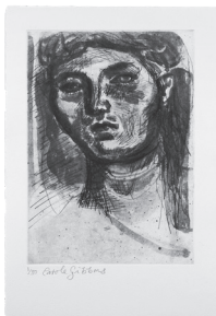
Self-Portrait , 2022 Signed photopolymer etching on Somerset Satin 300gsm paper Sold unframed in printed wallet Paper size: 27.5 × 19 cm Plate size: 20.5 × 14.5 cm Limited edition of 30