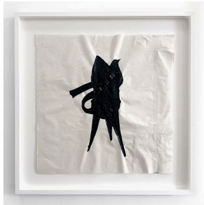
Ellen Jong Untitled (Wine Warmer) , 2025 Handmade ink and piercing jewelry on paper 26 x 26 inches approx. (paper) 32 x 32 inches framed