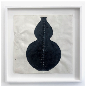
Ellen Jong Untitled (Vase II) , 2025 Handmade ink and piercing jewelry on paper 26 x 26 inches approx. (paper) 32 x 32 inches framed