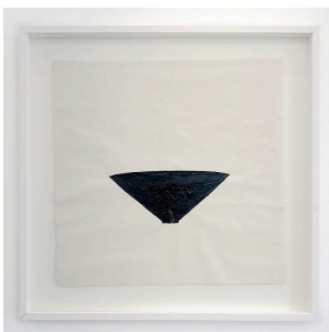
Ellen Jong Untitled (Song) , 2025 Handmade ink and piercing jewelry on paper 26 x 26 inches approx. (paper) 32 x 32 inches framed