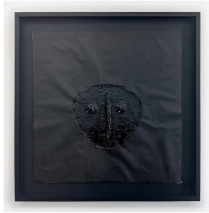
Ellen Jong Untitled (Immortals) , 2025 Handmade ink and piercing jewelry on paper 26 x 26 inches approx. (paper) 32 x 32 inches framed