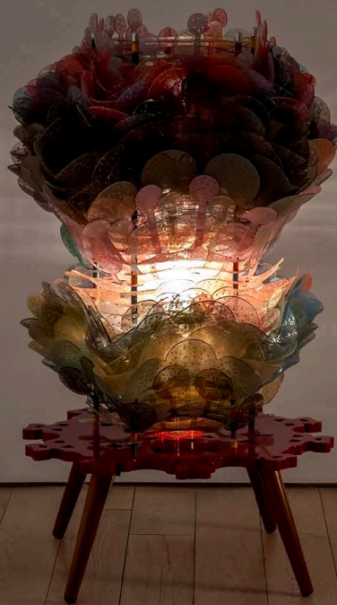
Untitled 2025 PETG 3mm, birch, dzalam, aluminum, stainless steel 40 x 24 x 24 in 101.6 x 61 x 61 cm (JP 25/040)