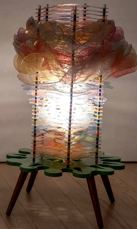
Untitled 2025 PETG 3mm, birch, dzalam, aluminum, stainless steel 38 3/4 x 25 1/4 x 25 1/4 in 98.4 x 64.1 x 64.1 cm (JP 25/038)