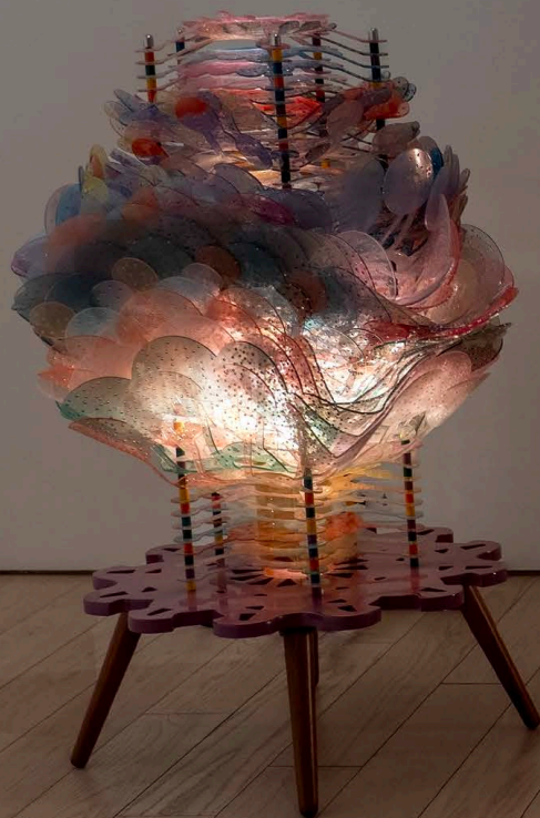
Untitled 2025 PETG 3mm, birch, dzalam, aluminum, stainless steel 39 x 25 x 25 in 99.1 x 63.5 x 63.5 cm (JP 25/039)