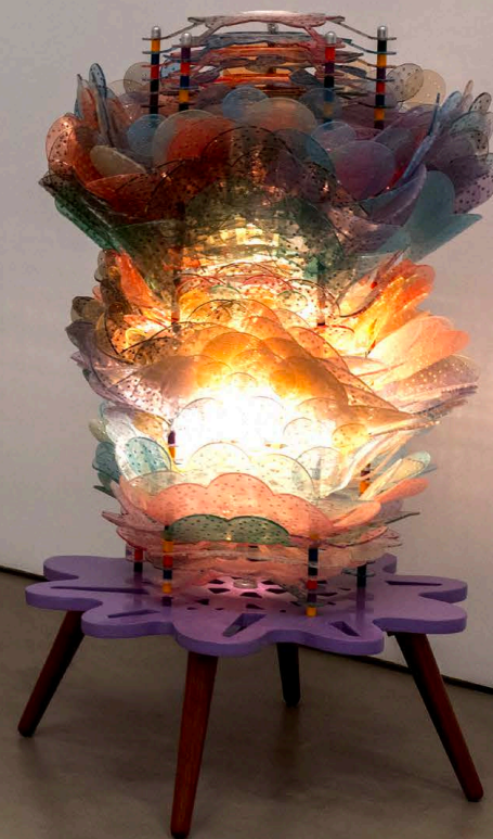
Untitled 2025 PETG 3mm, birch, dzalam, aluminum, stainless steel 40 x 25 1/4 x 25 1/4 in 101.6 x 64.1 x 64.1 cm (JP 25/048)