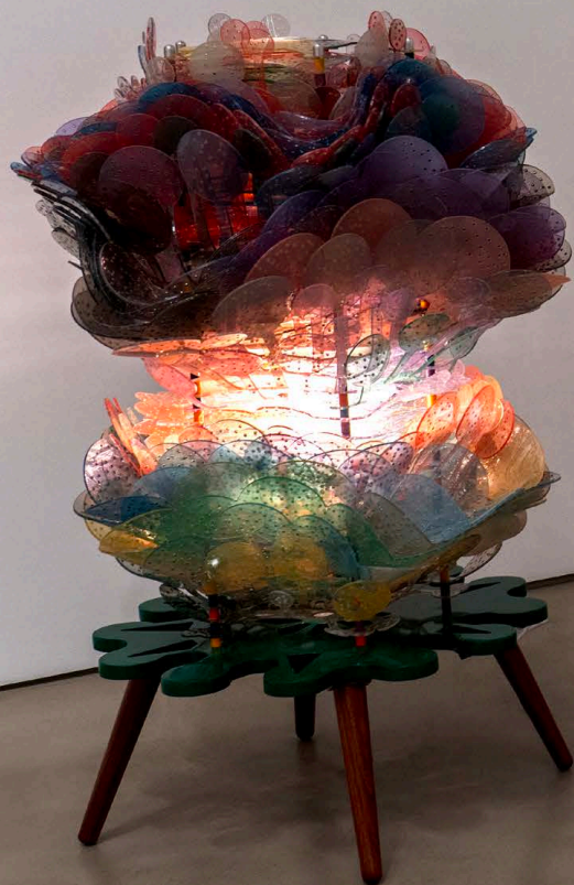
Untitled 2025 PETG 3mm, birch, dzalam, aluminum, stainless steel 39 1/2 x 26 1/2 x 26 1/2 in 100.3 x 67.3 x 67.3 cm (JP 25/047)