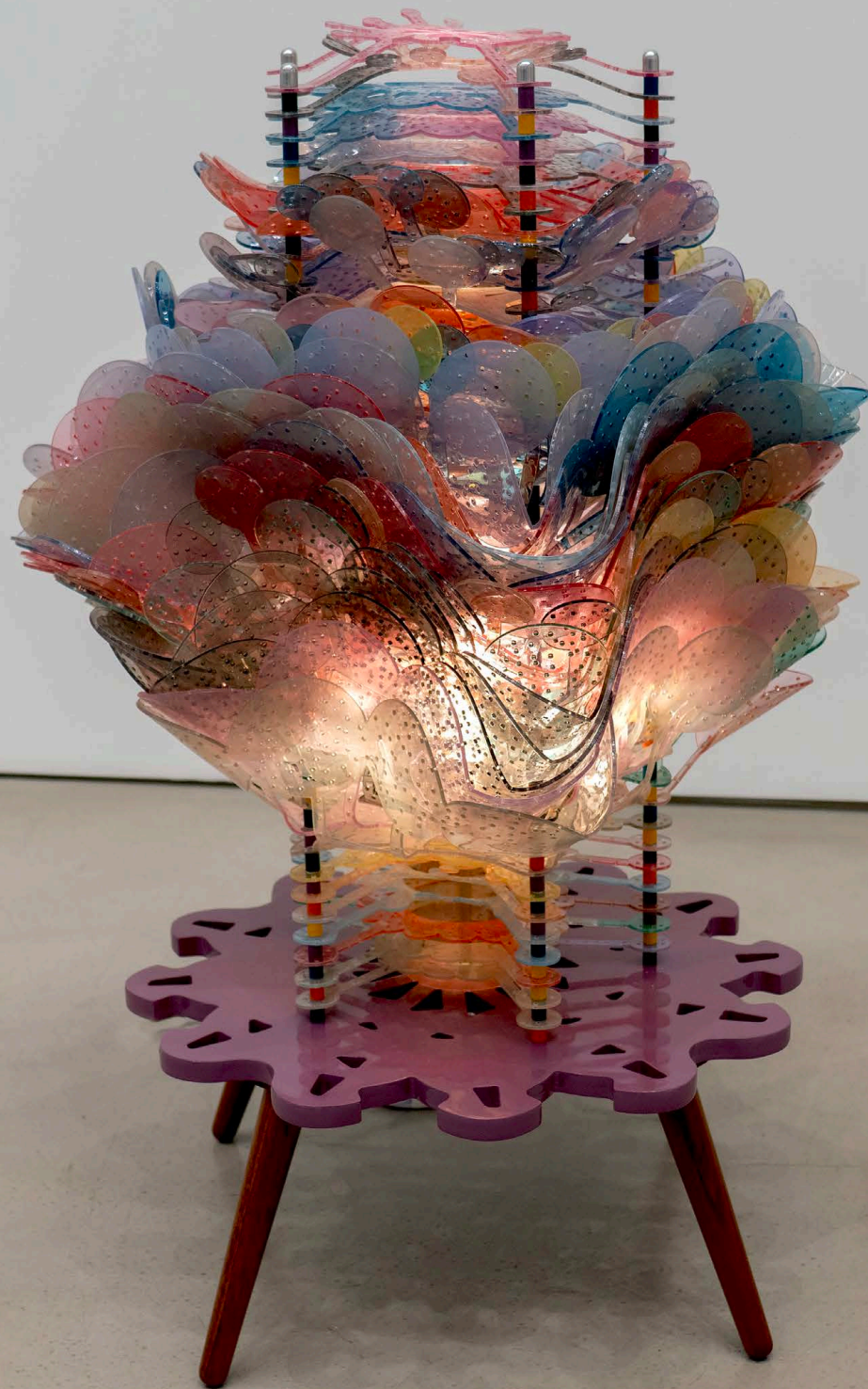
Untitled 2025 PETG 3mm, birch, dżalam, aluminum, stainless steel 39 x 25 x 25 in 99.1 x 63.5 x 63.5 cm (JP 25/039)