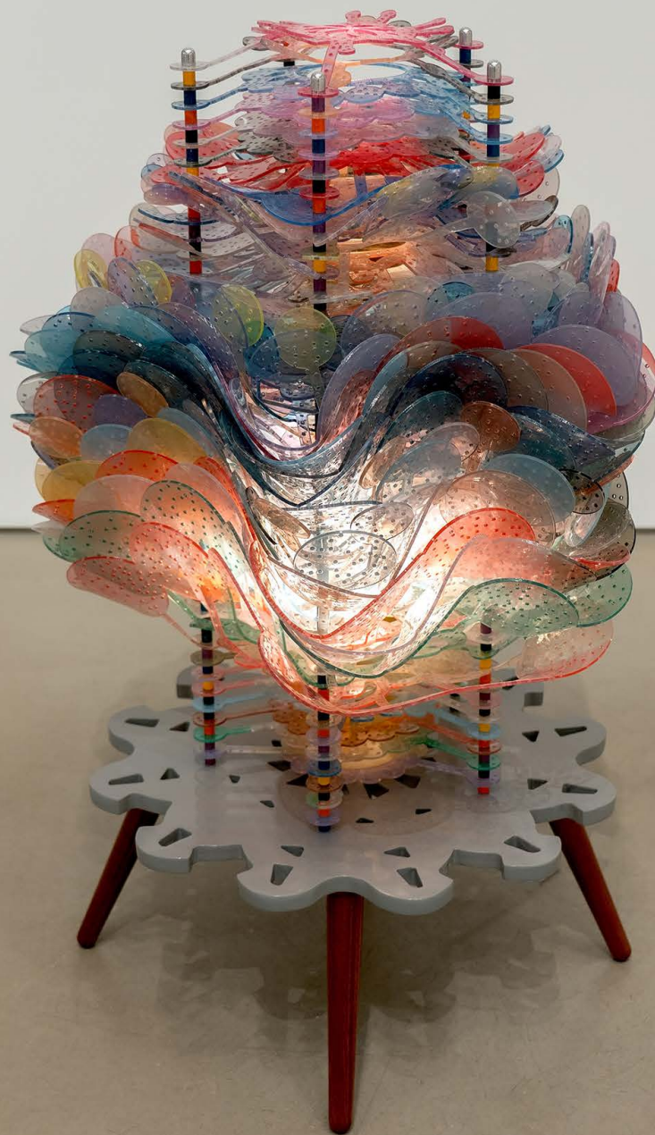
Untitled 2025 PETG 3mm, birch, dżalam, aluminum, stainless steel 39 3/4 x 24 x 24 in 101 x 61 x 61 cm (JP 25/034)