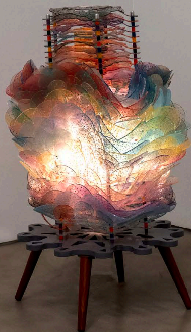
Untitled 2025 PETG 3mm, birch, dzalam, aluminum, stainless steel 39 x 24 x 24 in 99.1 x 61 x 61 cm (JP 25/042)