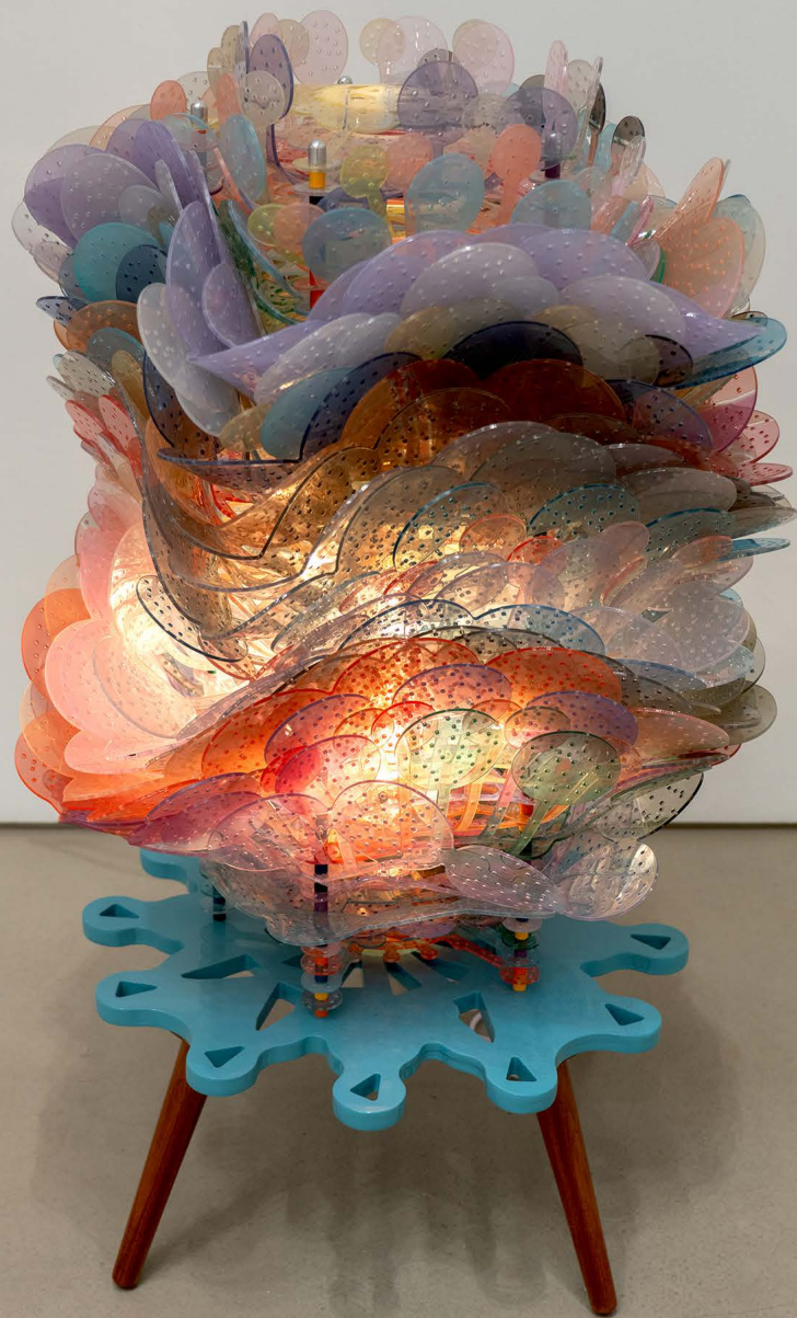
Untitled 2025 PETG 3mm, birch, dżalam, aluminum, stainless steel 40 1/2 x 25 x 25 in 102.9 x 63.5 x 63.5 cm (JP 25/035)