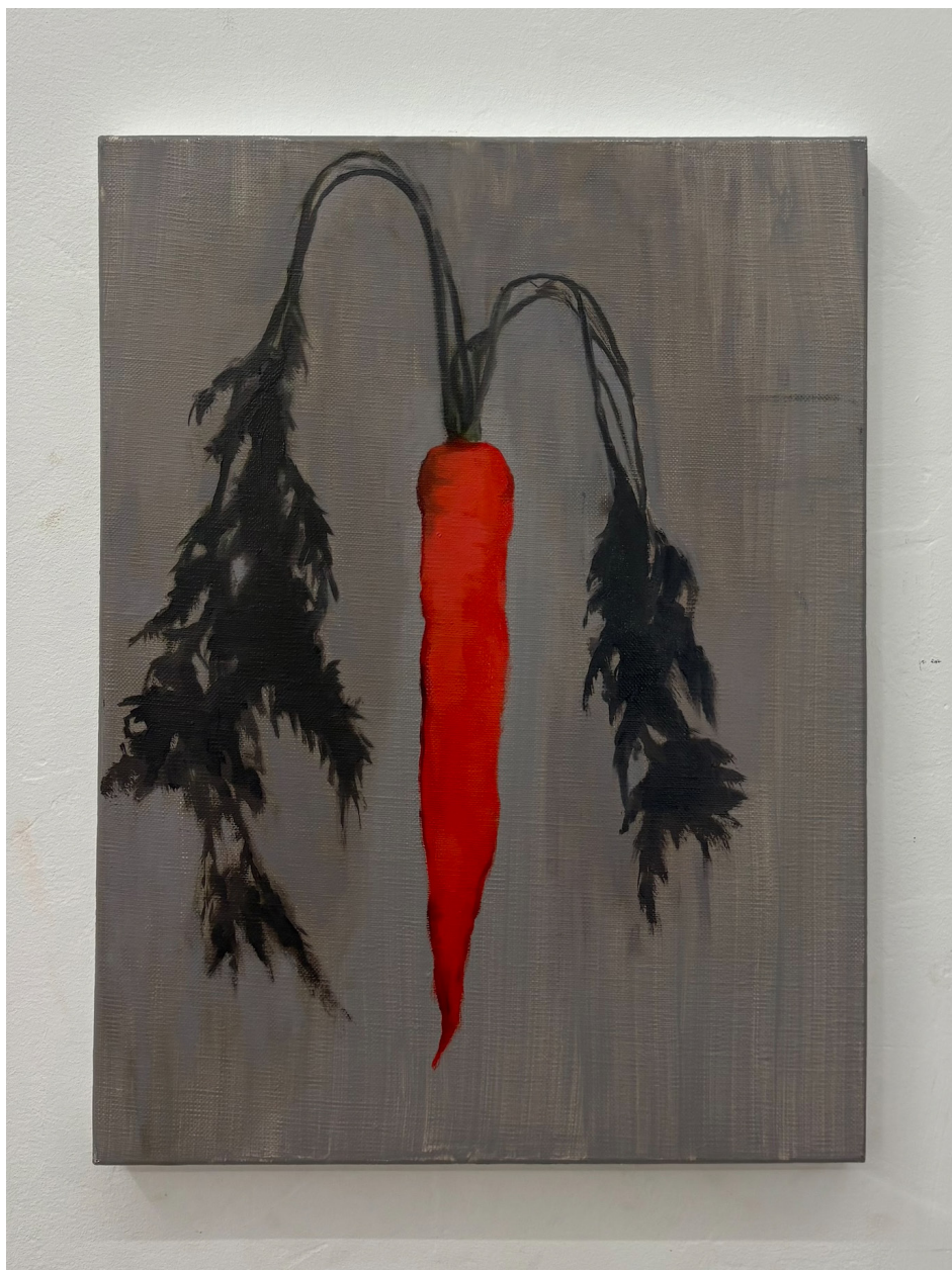
Untitled , 2025, Oil on canvas, 40 × 30cm, €1.800