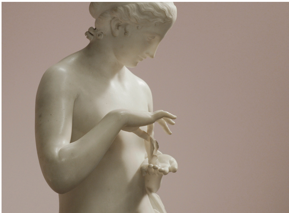
Antonio Canova, Psyche (only), marble, 1793-94, Kunsthalle Bremen, Germany, 2020, Digital C-Print, framed, 51.5 × 61 × 1.5 cm, Edition 3 of 5, €3.500