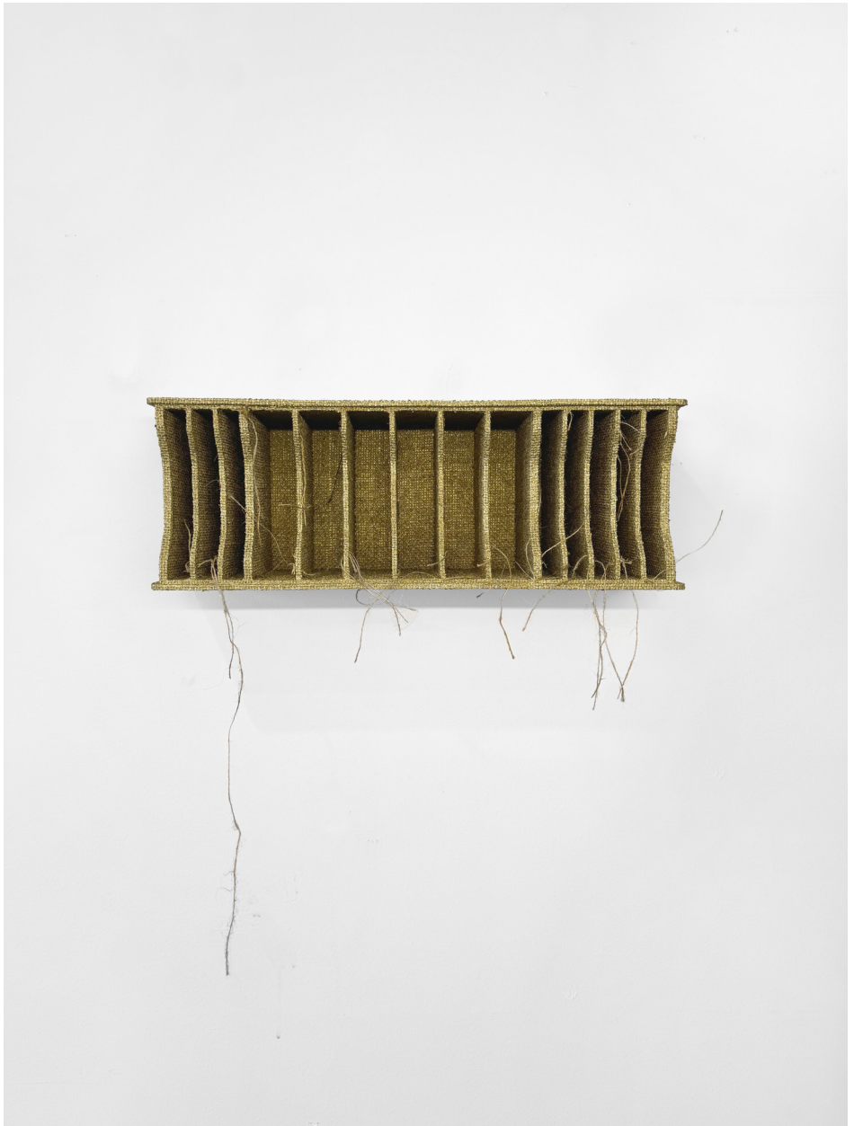
Untitled , 2025, Golden paint, jute, cardboard, 17 × 48.5 × 13.5 cm, €3.000