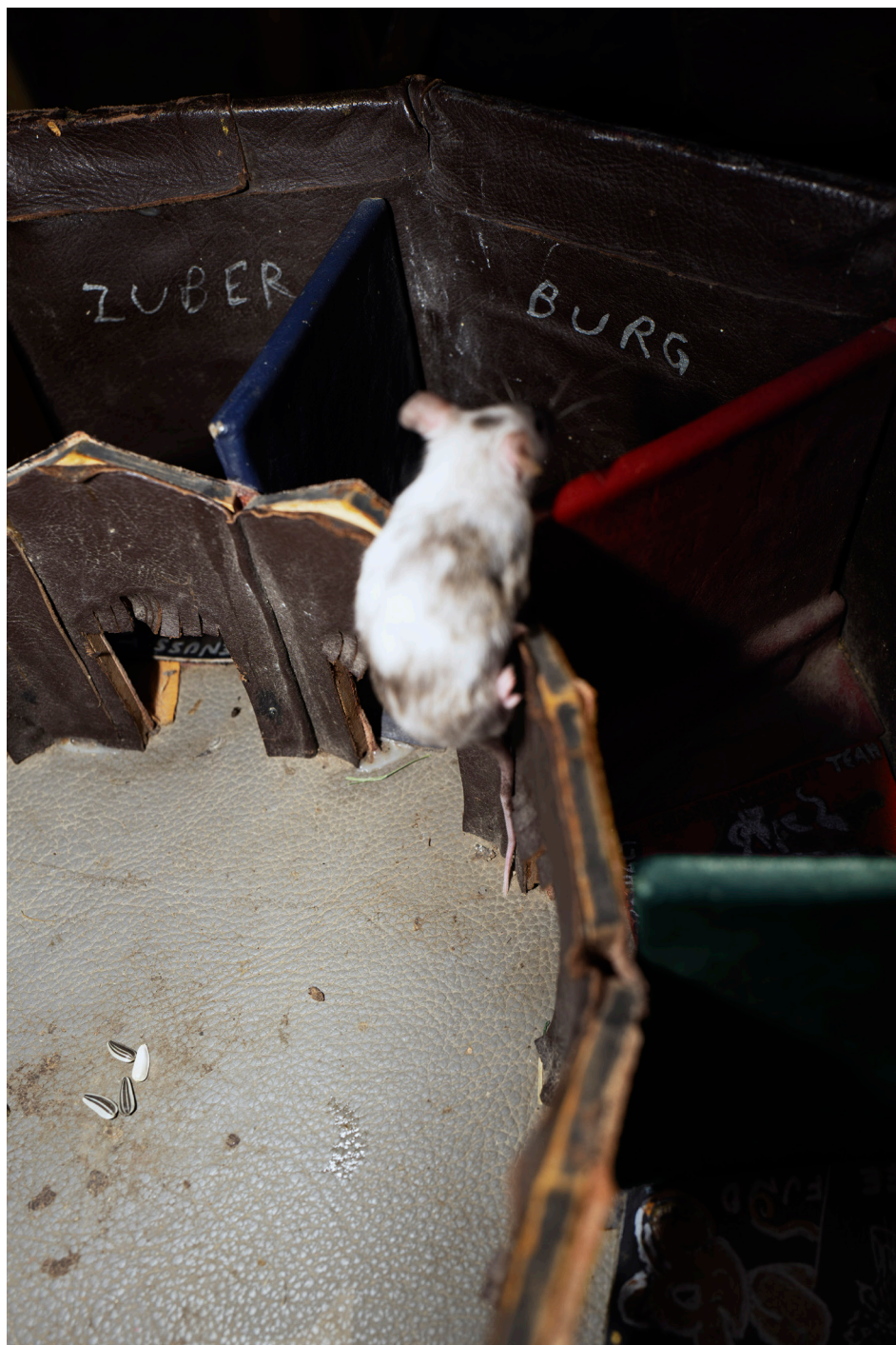
Untitled , 2025, Pigment print, framed, 120 × 80 cm, Edition of 9, €900