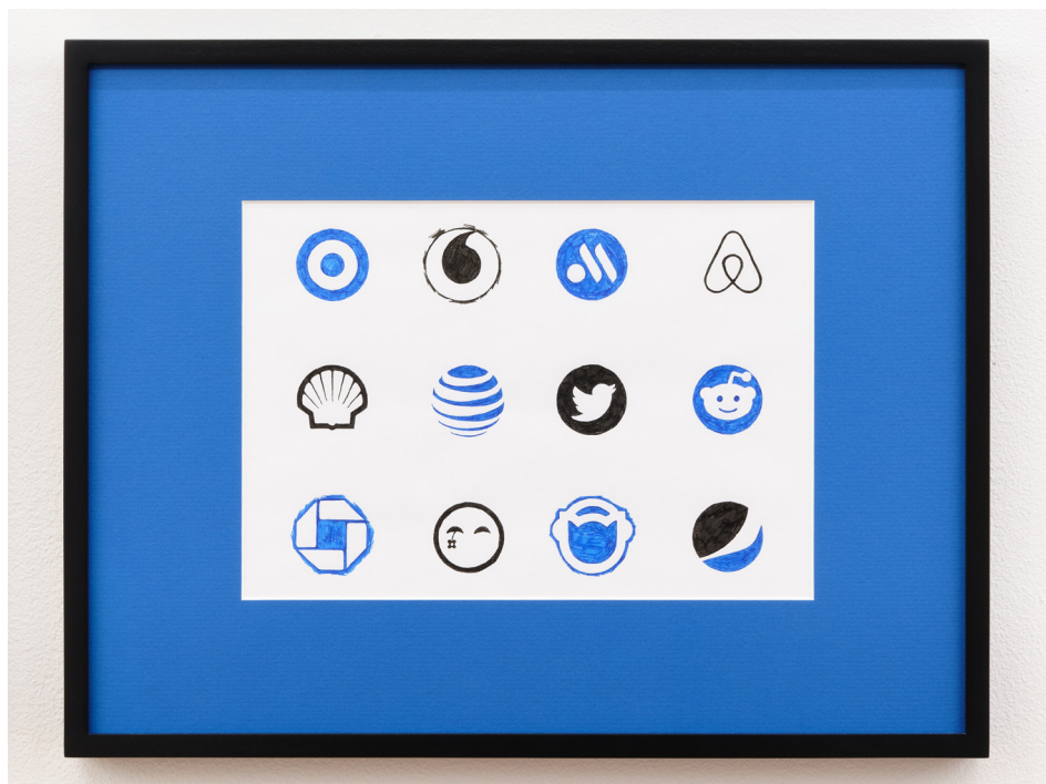
I Wasn't Expecting To Enjoy This And I'm Not , 2023, Pen on paper, custom artist frame, 36.5 × 47 × 3.7cm, €3.000