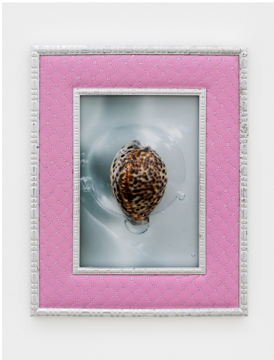
Cypraea Tigris , 2025, Inkjet print, seashell, frame, 26 × 21 × 5.5 cm, €5.000