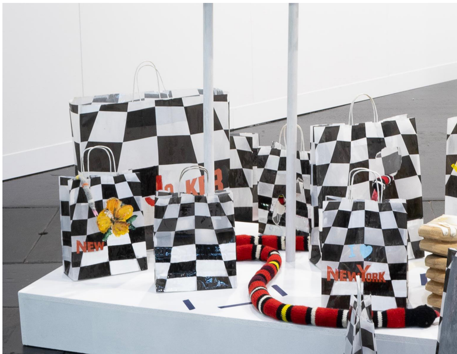
Pretty good(s) , 2023/2025, Sophie Gogl & Karolin Braegger, Acrylic and epoxy on New Yorker shopping bags, Sabina Gmür & Karolin Braegger, Hand-knitted snakes made of wool, Variable dimensions, bags €250 each, small snakes €250 each, medium snake €500, large snake €750