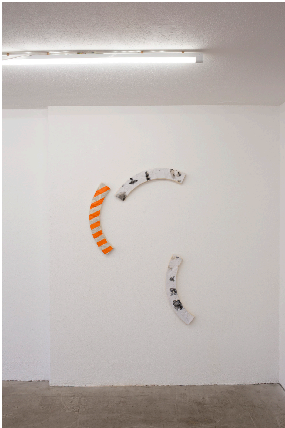
Commercial suicide , 2024, Print and acrylic on stiffened cotton, Variable dimensions, € 1.800