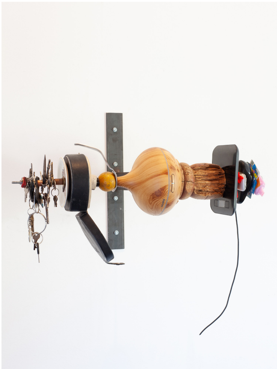
Personal effects and things that are biographical in amongst material that might be understood as generic without clear separation under compression (Kebab), 2025, Steel threaded studding, nuts and washers, steel brackets, and hardware, 40 × 70 × 40 cm, €7.000