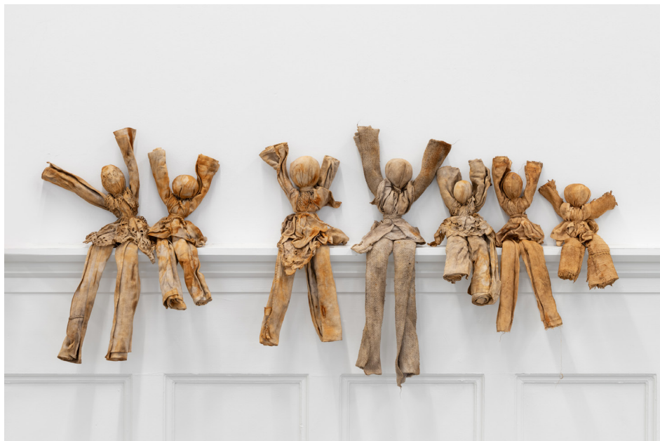
you, you, you, you, you, you, you, you,.... , 2025-ongoing, Rust-soaked kitchen towels, rags, napkins, yarn, Variable dimensions, €555 each