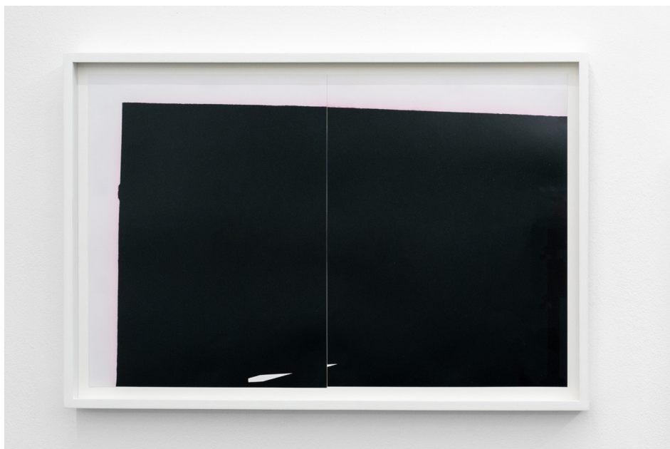
Exposures (crossroad freak / adjust me if I stray) , 2024, Analog exposure, unique copy, framed, 37.2 × 55 cm, €2.000