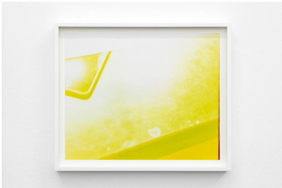
Exposures (Sunday morning) , 2024, Analog exposure, unique copy, framed, 29.4 × 34.9 cm, €1.500