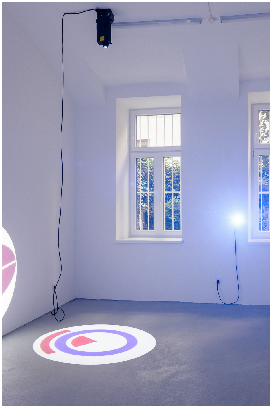
London Metal Exchange, 2025, LED Gobo projection, Variable dimensions, €1.800