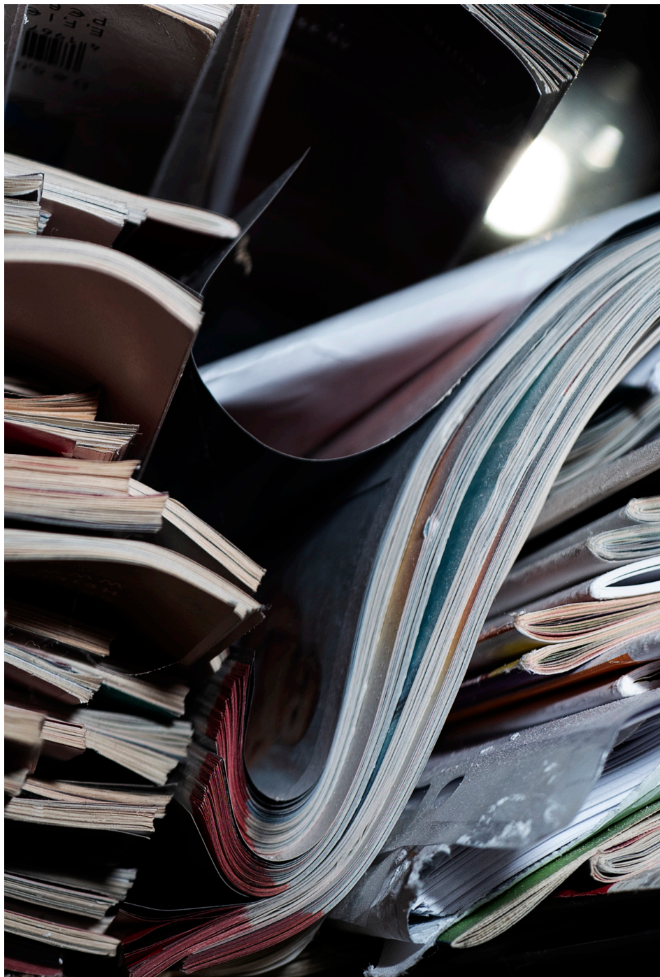
Untitled , 2025, Pigment print, framed, 54.8 × 38 × 2.5 cm, Edition of 9, €350