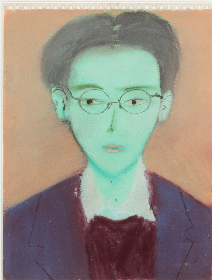
32 - 27, 2025, pastel on paper, 31 × 23.5 cm. Courtesy of the artist and Crèveœur, Paris. Photo: Laurent Edeline