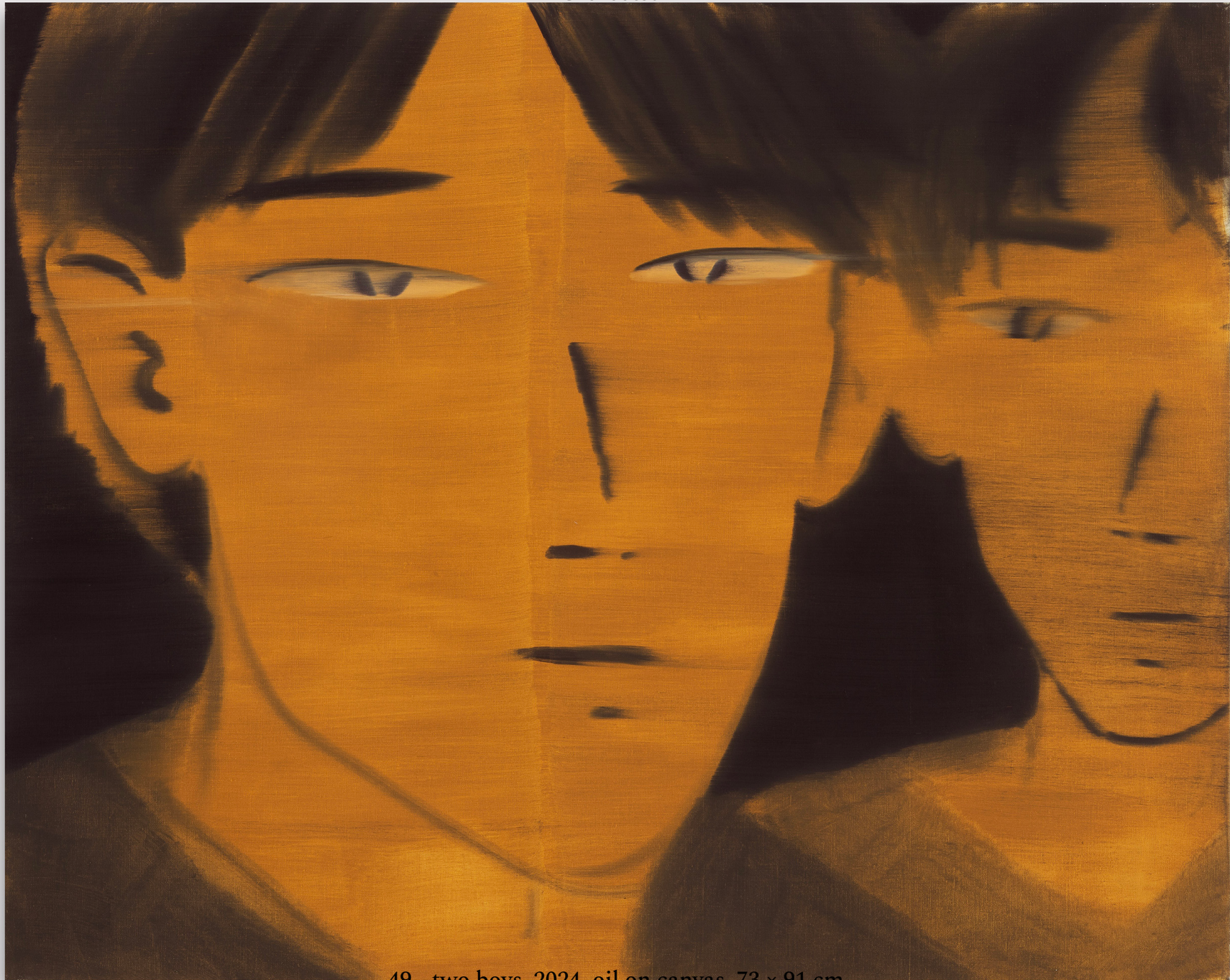
49 - two boys, 2024, oil on canvas, 73 × 91 cm