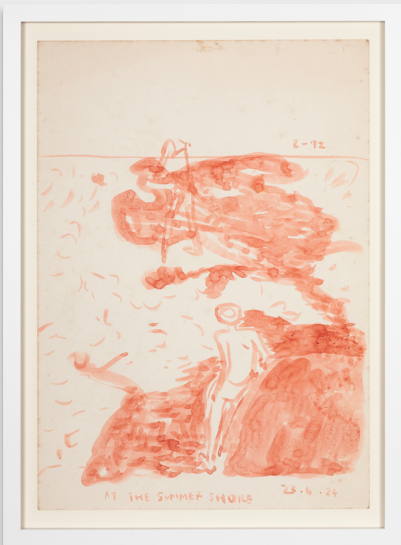
30 - summer shore , 2023, watercolor on cardboard, 29.5 × 21 cm.