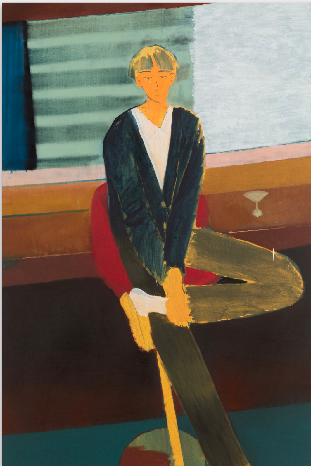
51 - a boy waiting , 2025, oil on canvas, 194 × 130 cm. Courtesy of the artist and Crèveœur, Paris. Photo: Laurent Edeline