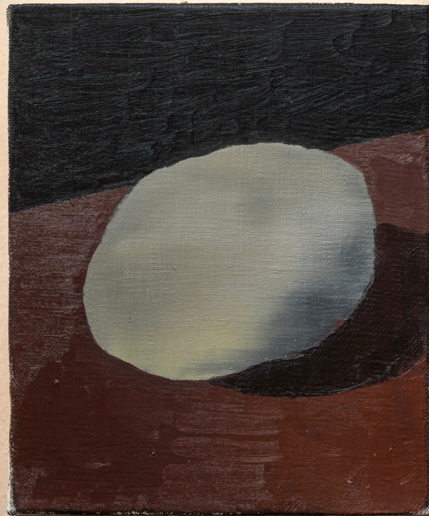
46 - pomme de terre, 2024, oil on canvas, 18 × 14 cm