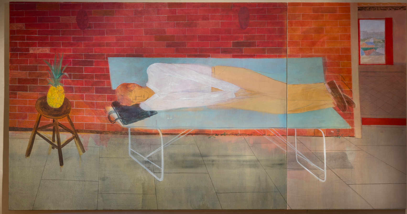
38 - offering, 2025, acrylic on coton, 194 × 371.5 cm (diptych)