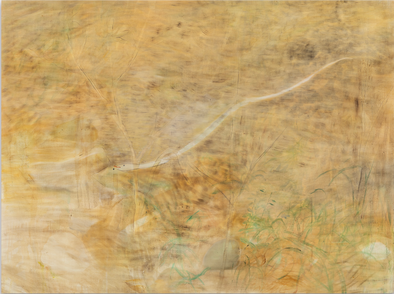
53 - messenger, 2022, oil on canvas, 97 × 130 cm