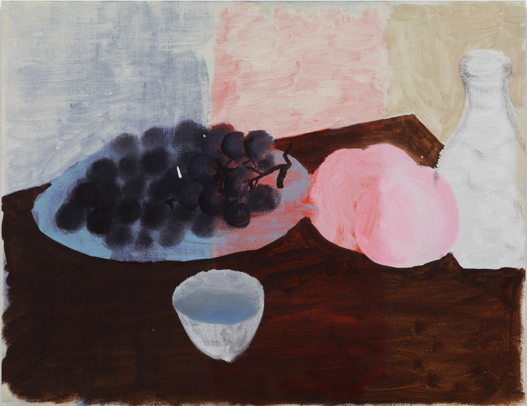
43 - fruits and porcelain, 2024, acrylic and oil on canvas, 32 × 41 cm