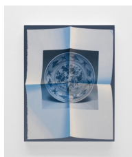
Olivia Jia Page unfolded (dish with flowers and birds, 1651) , 2026 Oil on board 27.9 x 21.6 cm 11 x 8 1/2 in. (AP-JIAOL-00002)

Courtesy of the artist, The Approach London and Margot Samel, New York Photo: Michal Brzezinski / @lelenthal