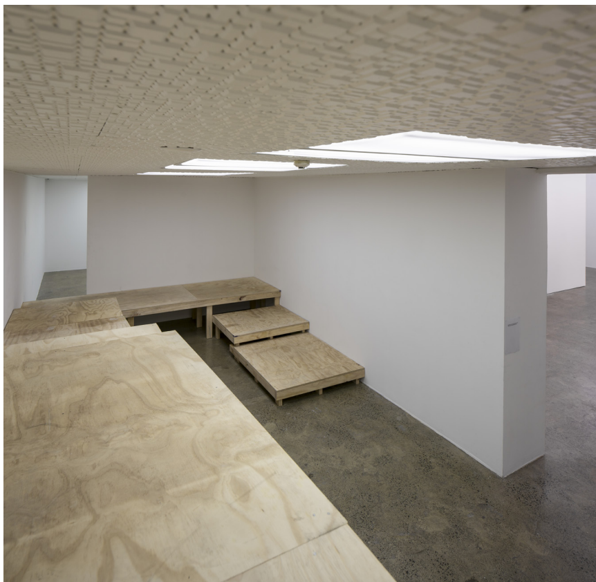
AUTONAIR, installation view