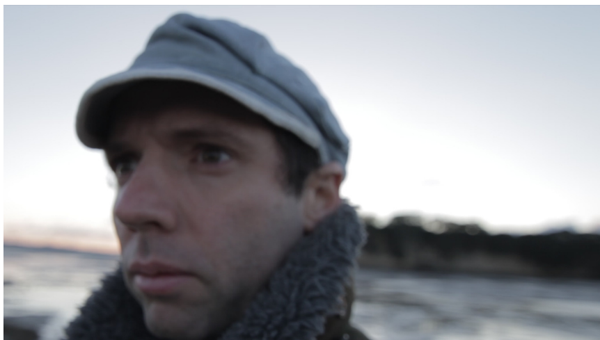
LEFT: The Island , 2013, digital still.