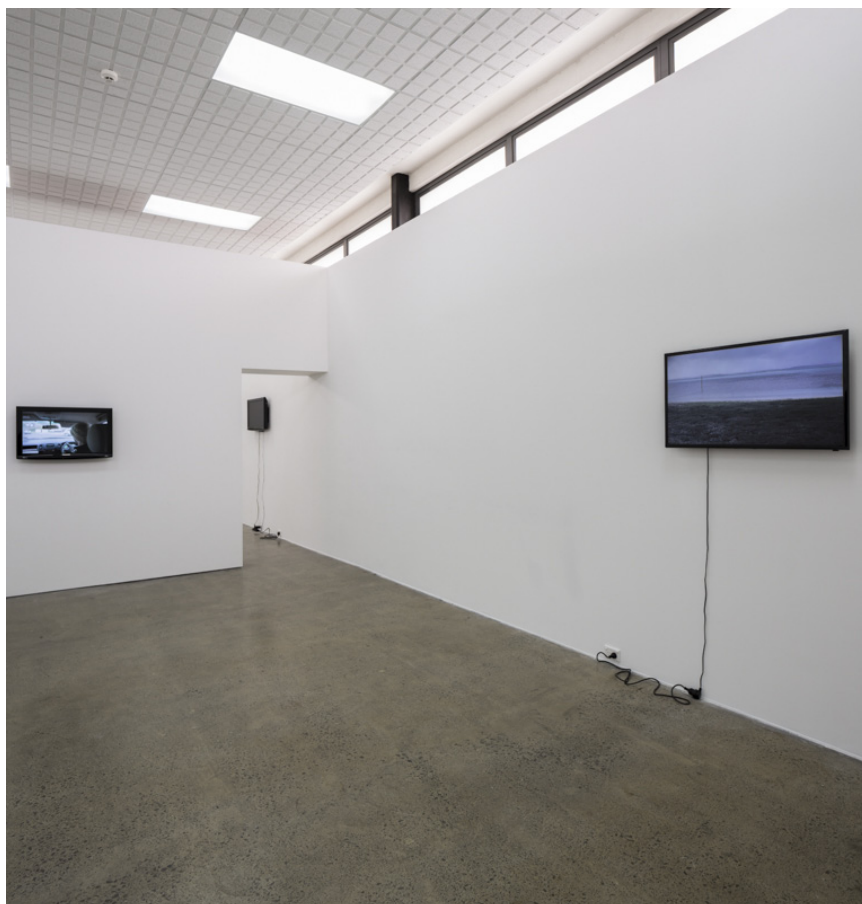
BELOW: Installation view Cul-de-sacs and Landscape 2 .