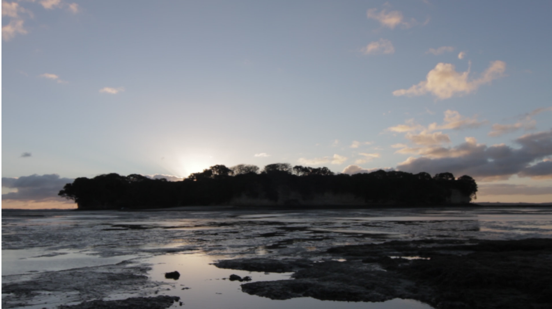
The island , 2013, digital still