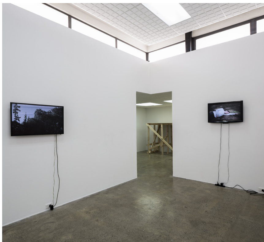
ABOVE: The detectives , 2013, digital still. LEFT: installation view, Landscape 1 , and The detec- tives , 2013.