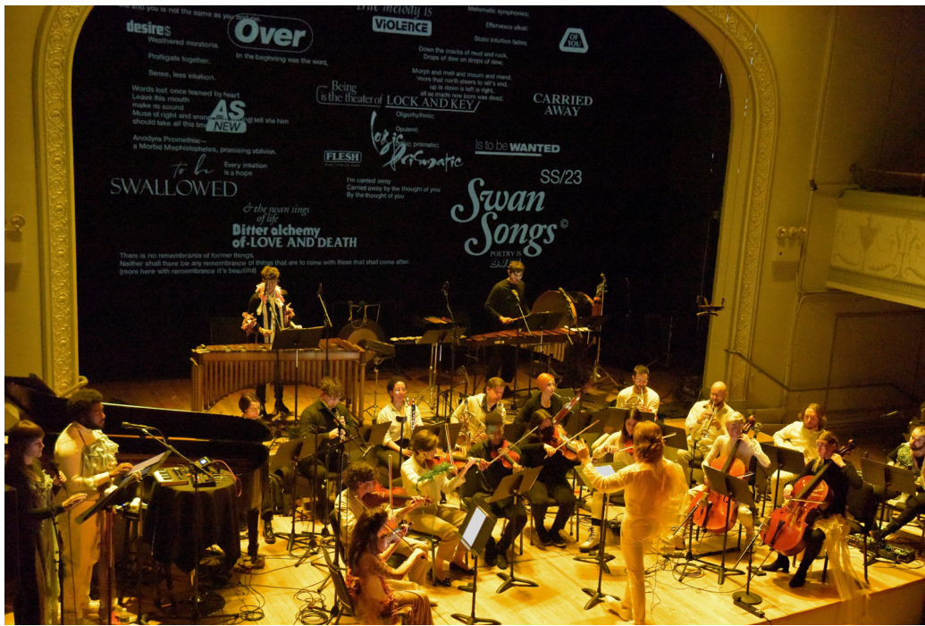
Swan Songs opera, 2023.