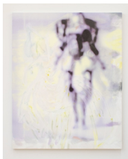
Rachel Rossin Just like Velveteen Rabbit, Mech Standing, 2023 Oil stick, charcoal, acrylic oil and UV ink on canvas 60 x 48 x 1 1/2 in. 152.4 x 121.9 x 3.8 cm. (RR_053)