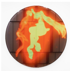
Rachel Rossin "The Maw Of" Screen 4, 2022 Video on custom lenticular LED screen 79 x 79 x 3 1/4 in. 200.7 x 200.7 x 8.3 cm. (RR_051)

Rachel Rossin: SCRY June 29–August 11, 2023