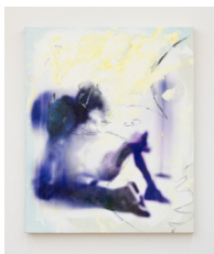
Rachel Rossin Sweetie Mech Resting. Catching Lizards. Living Long Enough., 2023 Oil stick, charcoal, acrylic oil and UV ink on canvas 44 x 36 x 1 1/2 in. 111.8 x 91.4 x 3.8 cm. (RR_064)