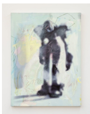
Rachel Rossin SCRY. 1 Corinthians 13:12., 2023 Oil stick, charcoal, acrylic oil and UV ink on canvas 40 x 30 x 1 1/2 in. 101.6 x 76.2 x 3.8 cm. (RR_054)