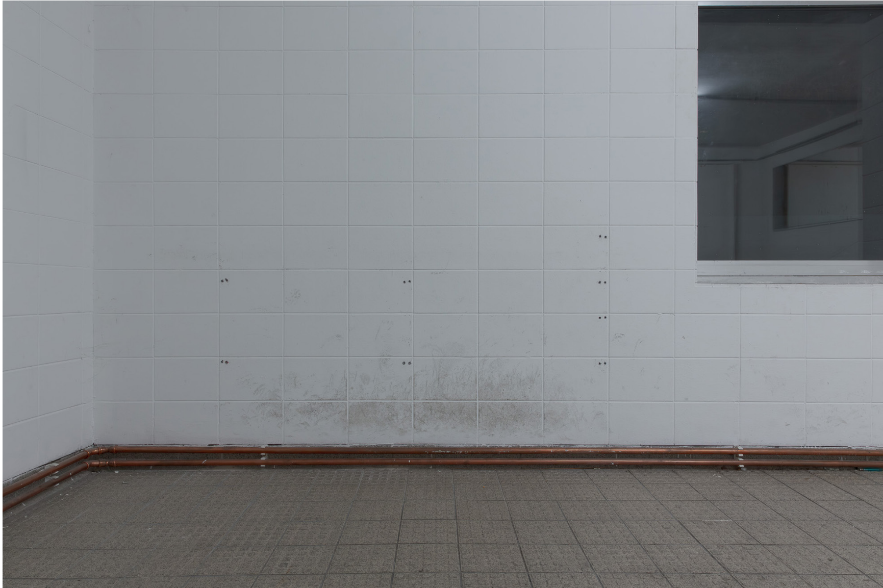
shadow boxing, 2025 | Raphael Pohl dismantled desk, traces of kicks on the wall, empty plugs various dimensions