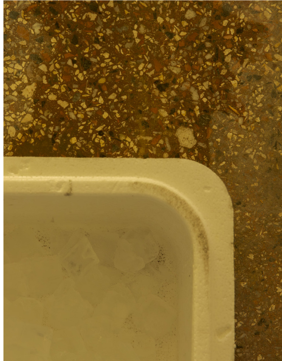
signes from yesterday, 2025 | Raphael Pohl removed salmon from nordlaks, polystyrene box, melting ice various dimensions