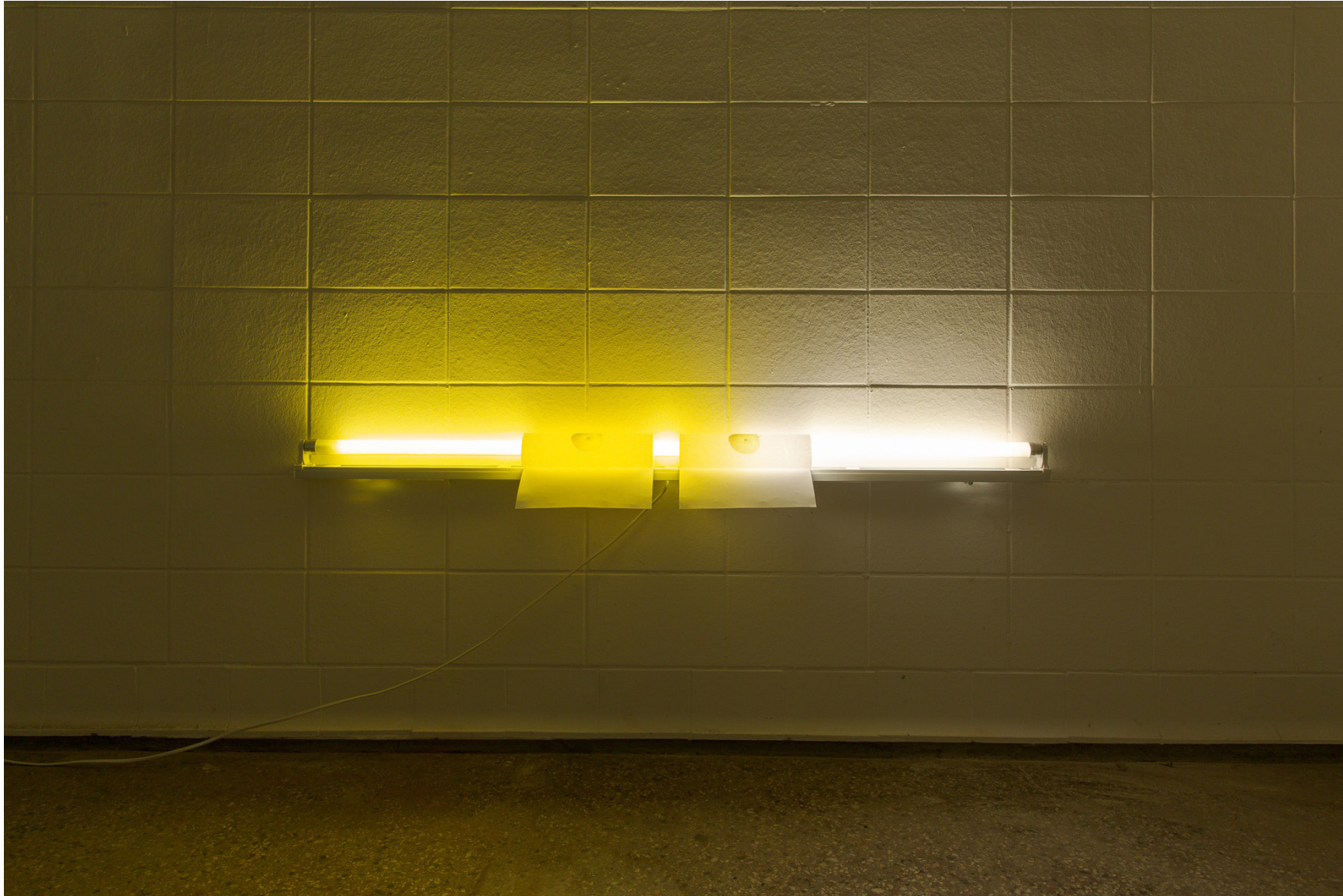
Light escapes the apple's core, enters the seeing eye, the name's duty ends here, 2025 | Yixuan Hu led tube, socket, yellow foil, cable, extension cord, printed image of two apples on paper various dimensions