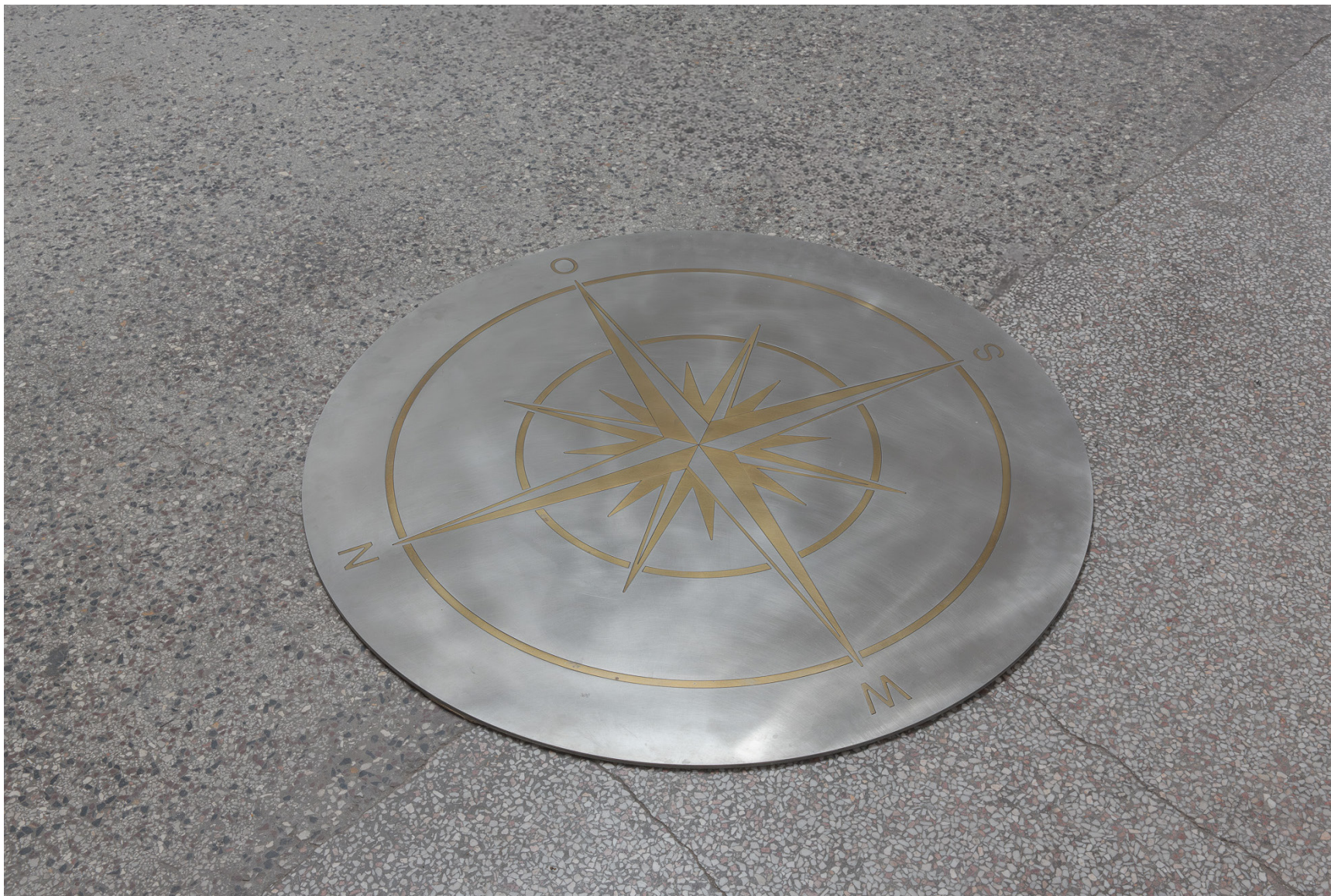
So far from my mistakes, 2019 | Fabio Zolly compass, polished inox diameter 60