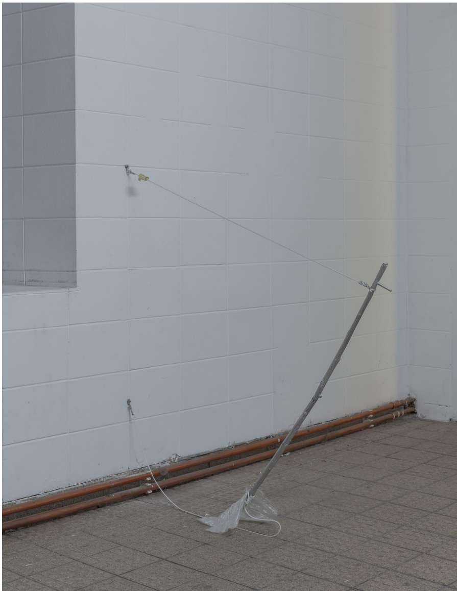
sit. 302, 2025 | Raphael Pohl aluminium cast of a sunflower stem, thread, adhesive tape, stretch film various dimensions