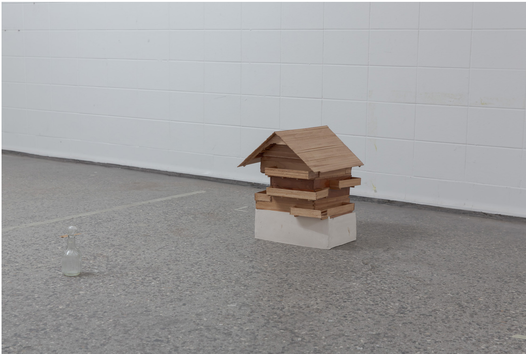
Heilige Freiheit, 2009 | Siggie Hofer house models, wood, stain, lacquer, fired clay e. 40 × 30 × 30