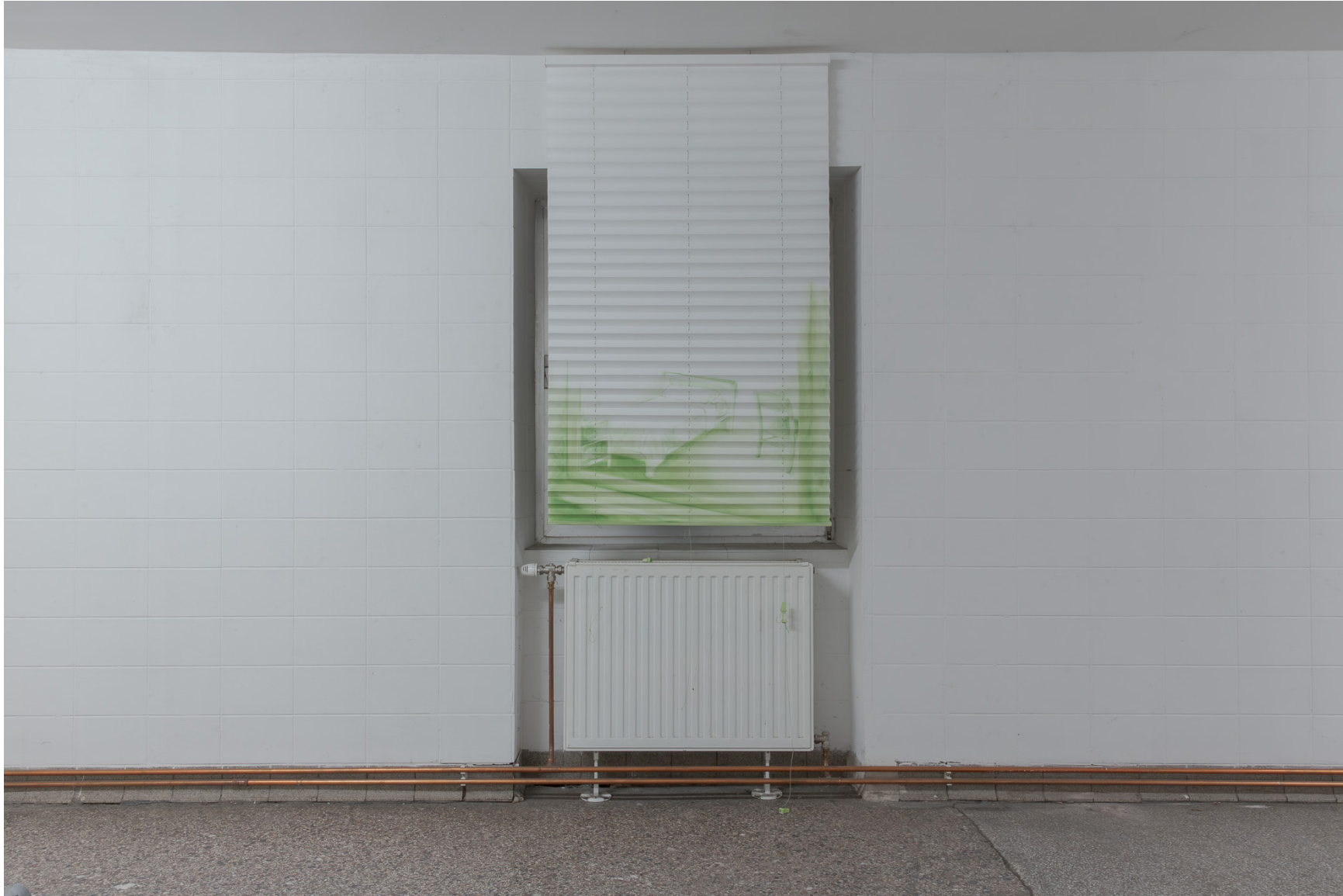
Peeping Tom, 2025 | Lisa Sifkovitz pigment on paper, nylon cord, cardboard, wood 150 x 90 x 3