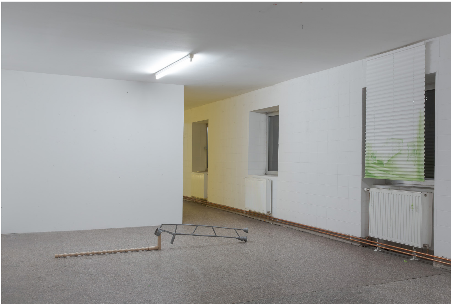
e.v - summer goes west 09, 2026