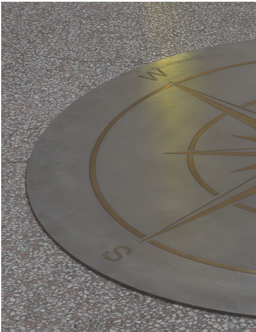
So far from my mistakes, 2019 | Fabio Zolly compass, polished inox diameter 60