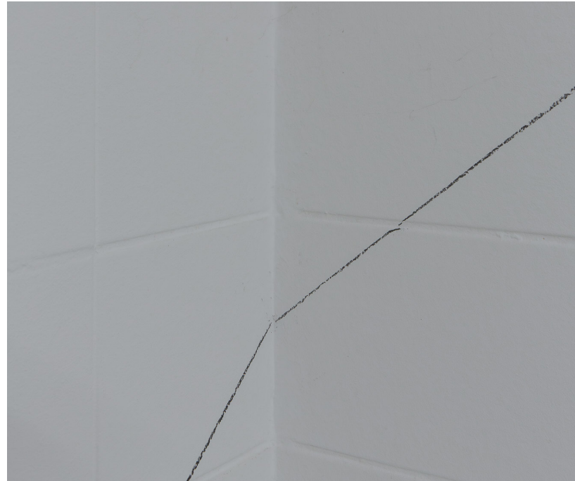
Wall drawing Vienna 01, 2025 | Erris Huigens drawn square with diagonal, charcoal 130 × 130