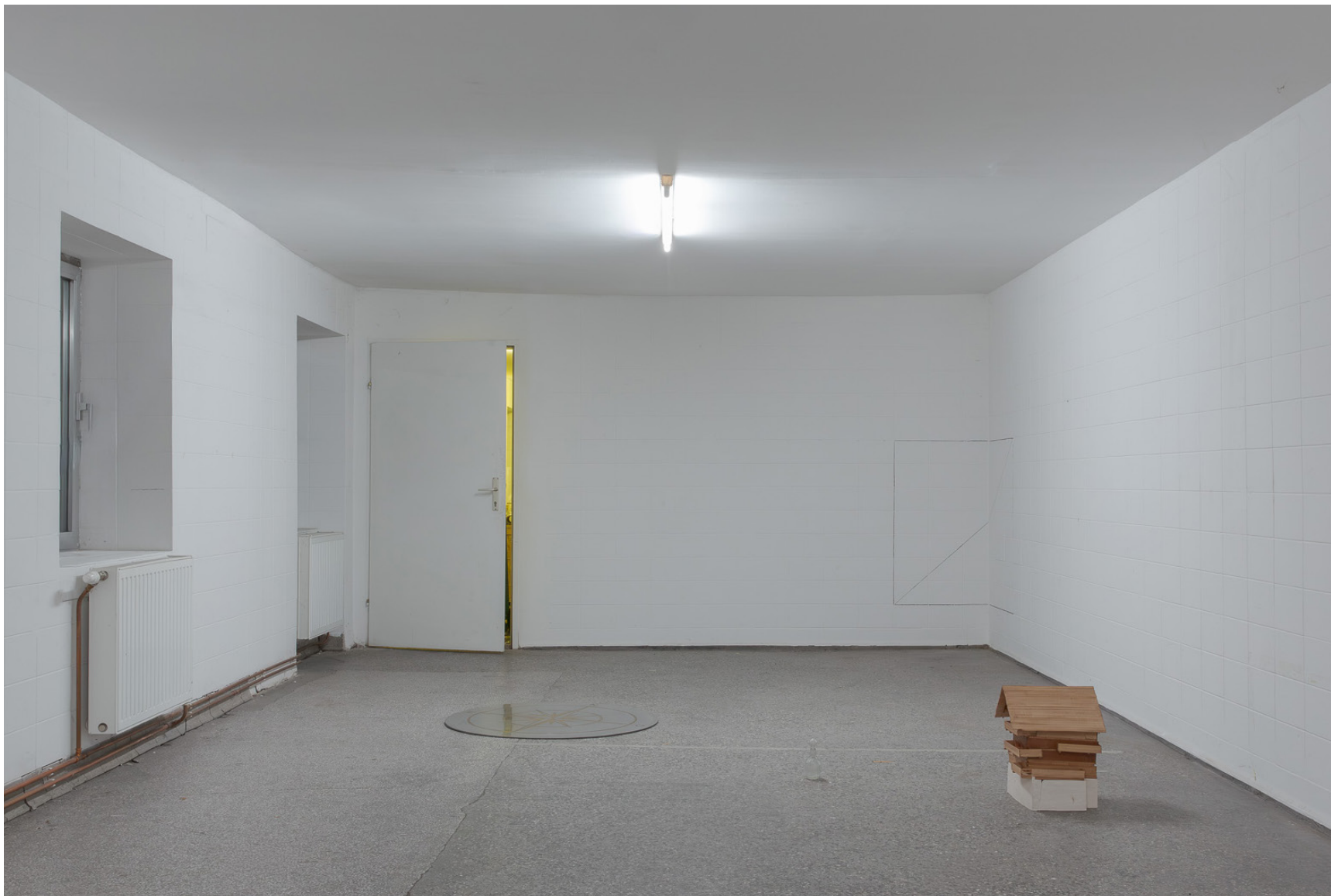
e.v - summer goes west 09, 2026