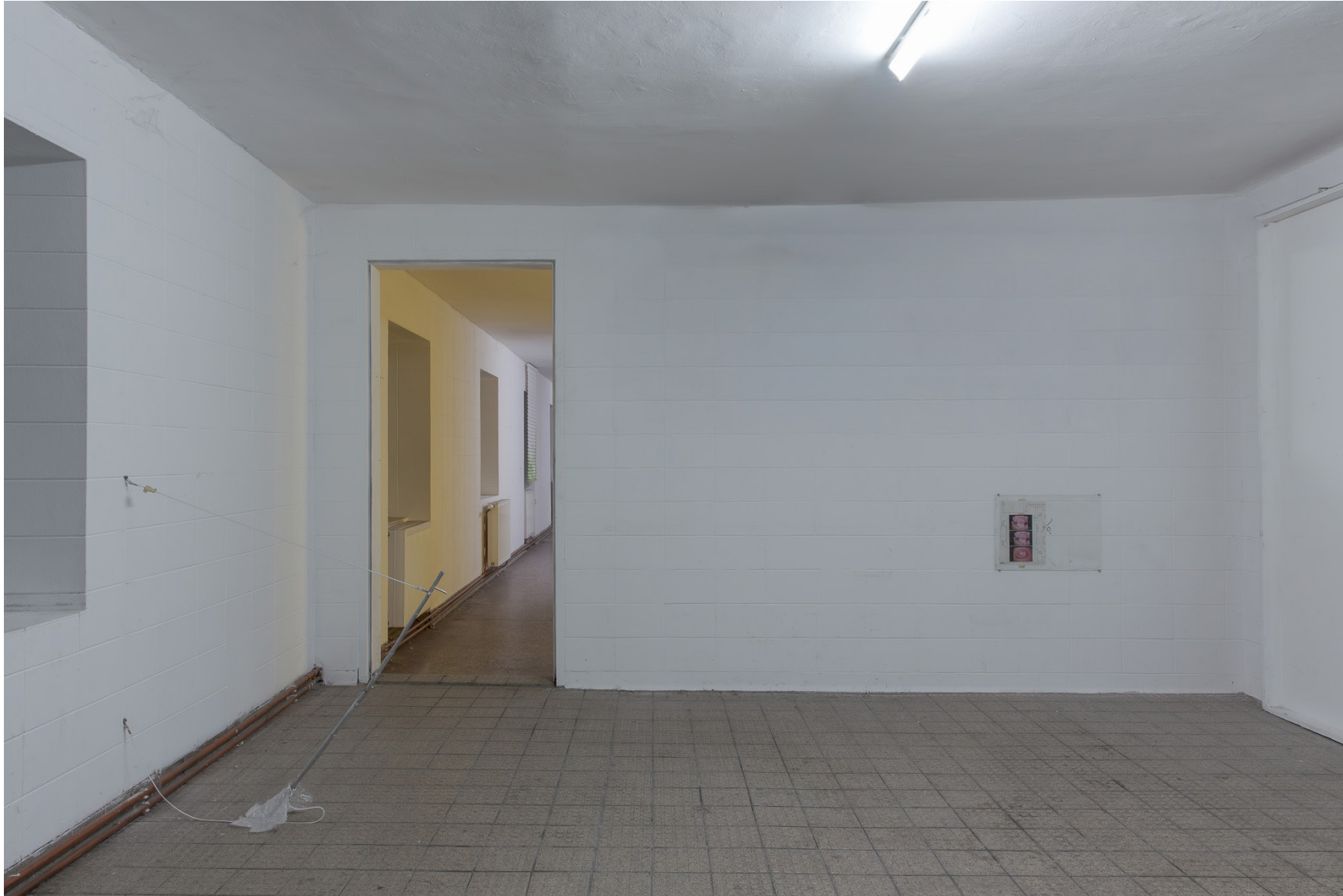
e.v - summer goes west 09, 2026