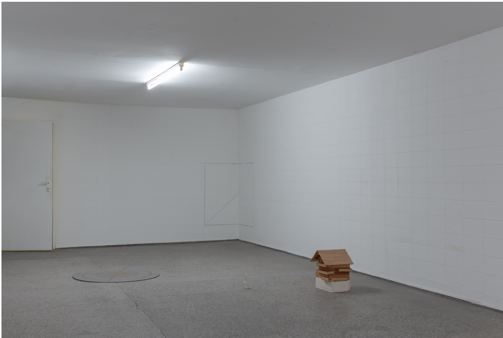
e.v - summer goes west 09, 2026