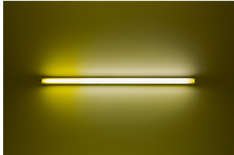
Light taped in amber, soaks the threshold air, the name is settled, 2025 | Yixuan Hu exhibition space lights covered with foil and yellow tape various dimensions