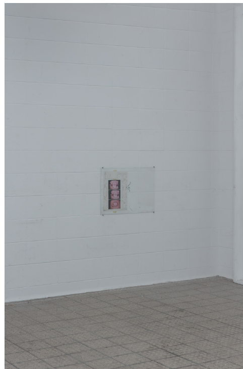
per cento, 2009 | Fabio Zolly person printed with copyright stamp, print on paper, glass, four screws, traces of pen 40 × 30 × 30