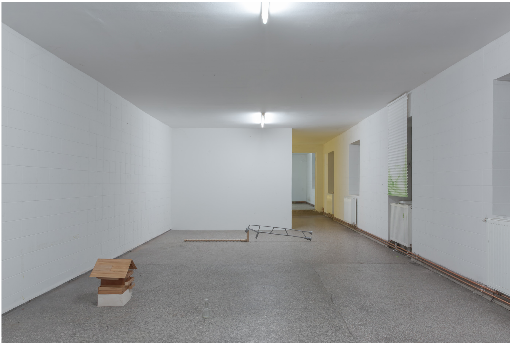
e.v - summer goes west 09, 2026