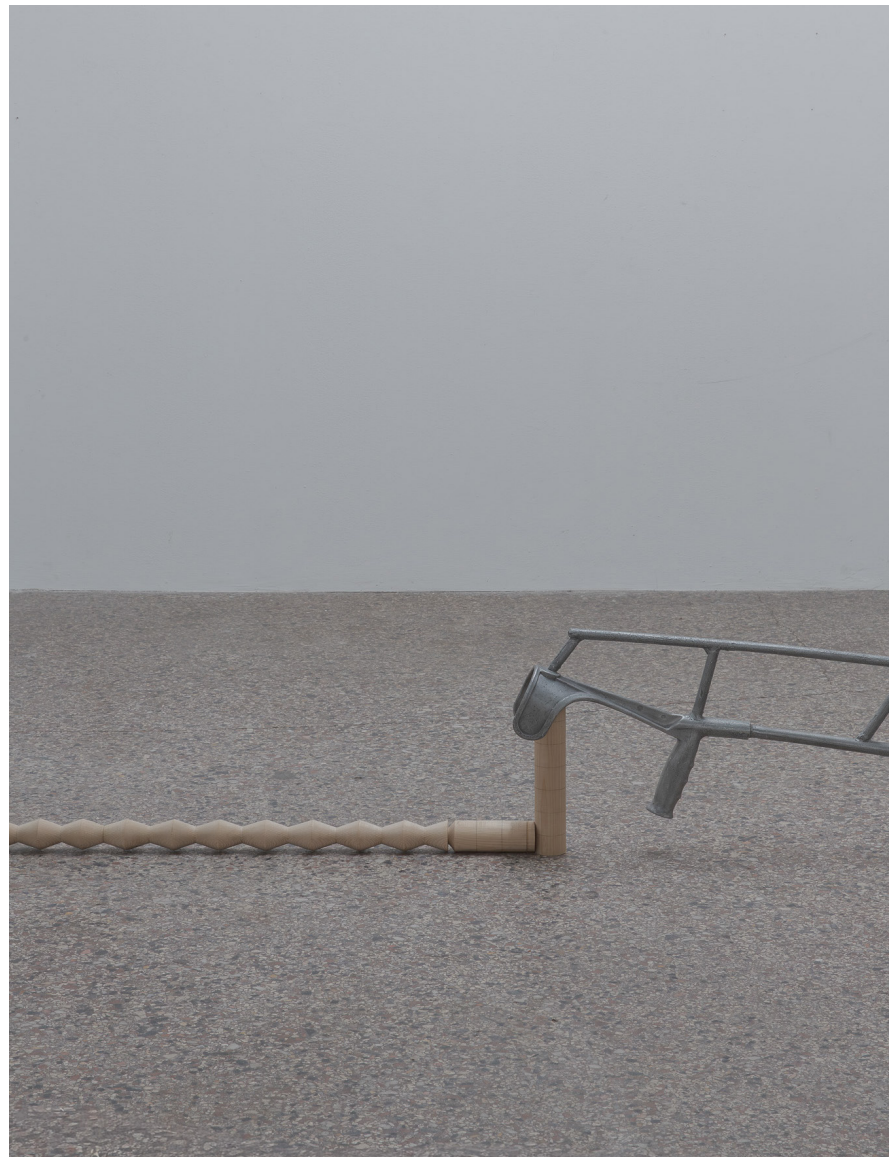
Stockholm-Syndrom, 2025 | Hans Schabus turned wood, aluminium cast of a crutch 255 × 25 × 10