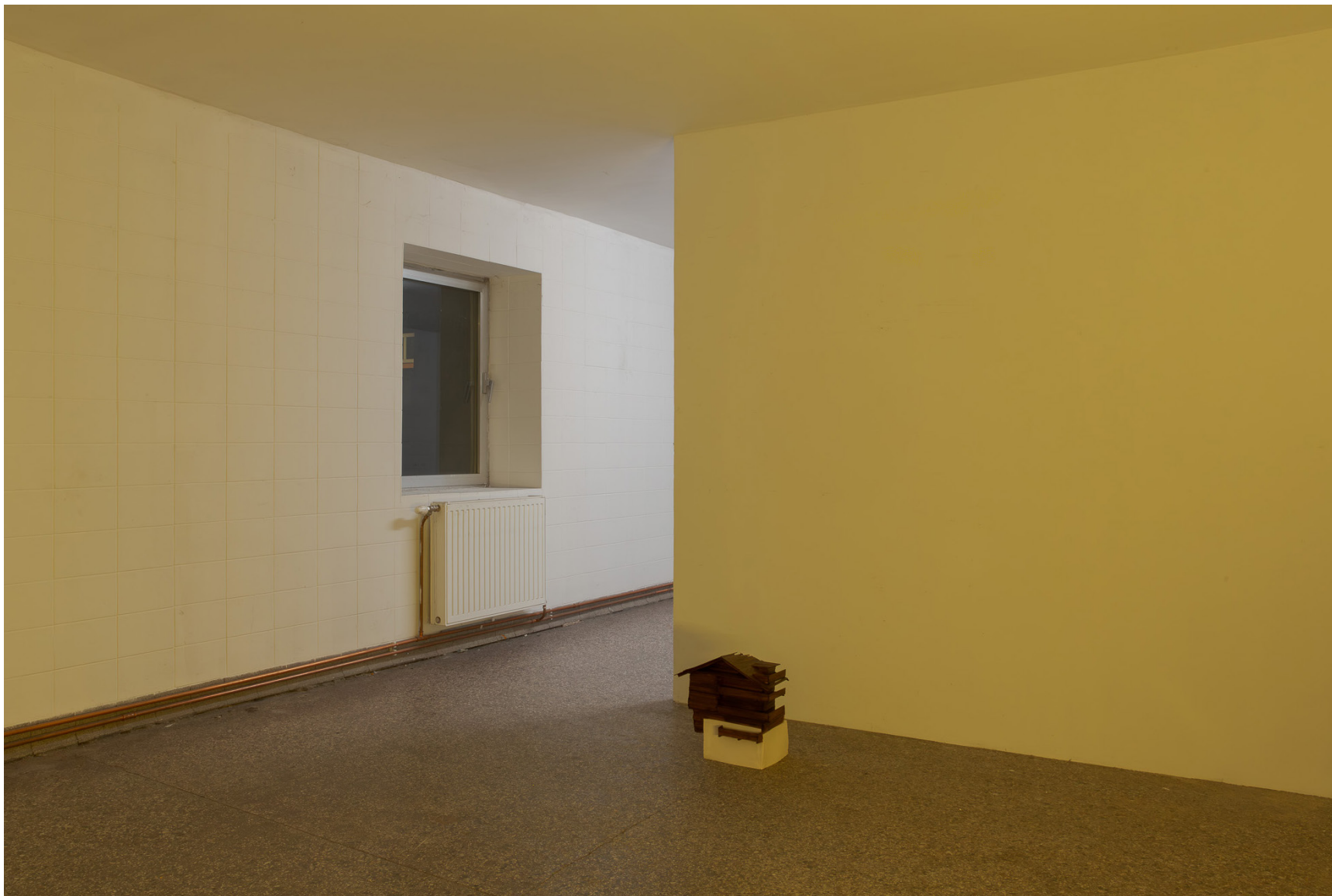
Heilige Freiheit, 2009 | Sigggi Hofer two house models, wood, stain, lacquer, fired clay, e. 40 × 30 × 30