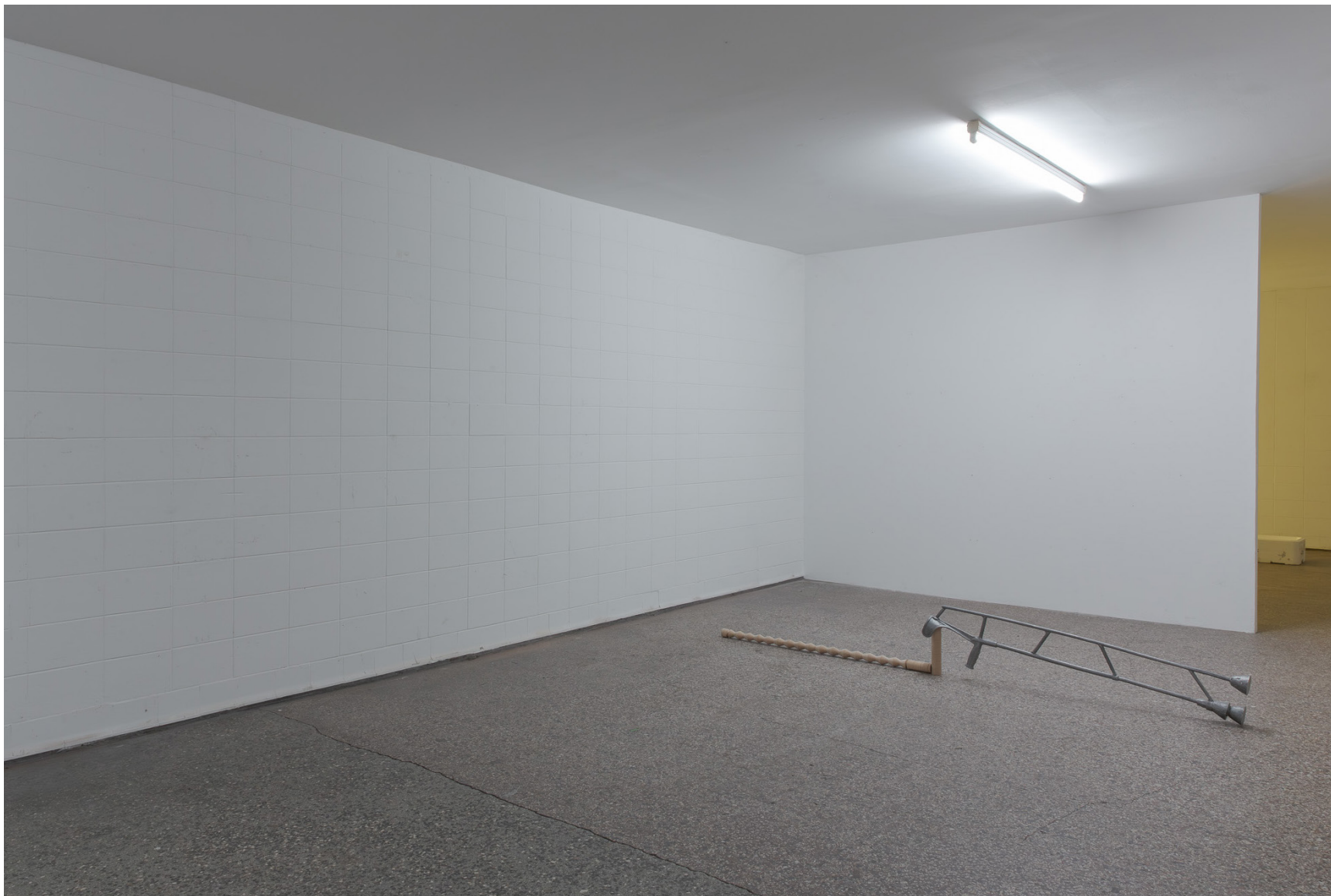
Stockholm-Syndrom, 2025 | Hans Schabus Turned wood, aluminium cast of a crutch 255 × 25 × 10