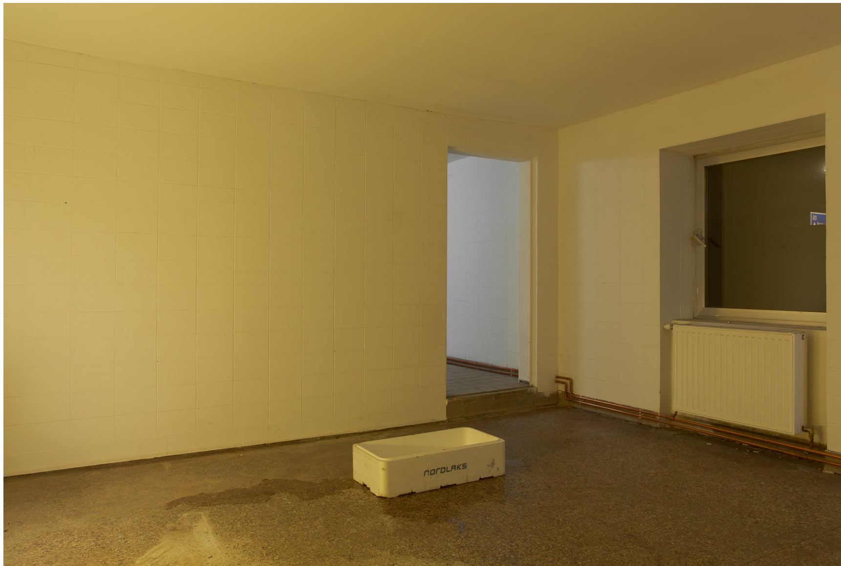
signes from yesterday, 2025 | Raphael Pohl removed salmon from nordlaks, polystyrene box, melting ice various dimensions