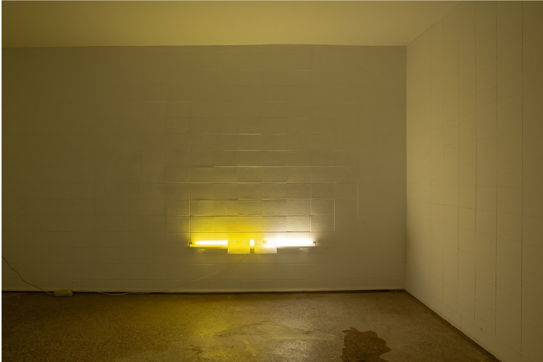
Light escapes the apple's core, enters the seeing eye, the name's duty ends here, 2025 | Yixuan Hu led tube, socket, yellow foil, cable, extension cord, printed image of two apples on paper various dimensions