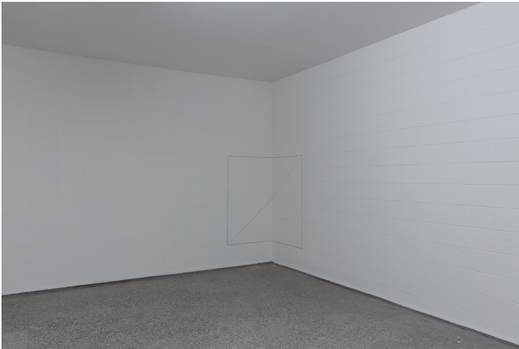
Wall drawing Vienna 01, 2025 | Erris Huigens drawn square with diagonal, charcoal 130 × 130