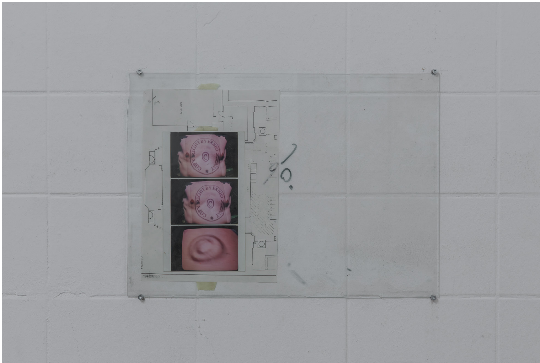
per cento, 2009 | Fabio Zolly person printed with copyright stamp, print on paper, glass, four screws, traces of pen 40 x 30 x 30