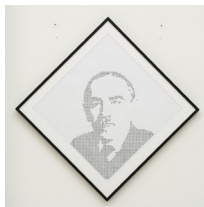
The long run (John Maynard Keynes 1883-1946) , 2026 Pen on paper, framed 50 x 50 cm