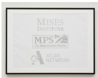
Think tank , 2026 Pen on paper, framed 50 x 70 cm