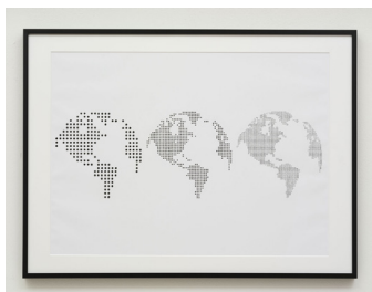
Conflict resolution , 2026 Pen on paper, framed 50 x 70 cm