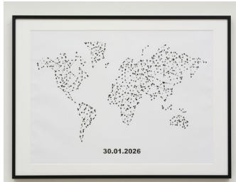
Portrait of the Landscape , 2026 Pen on paper, framed 50 x 70 cm