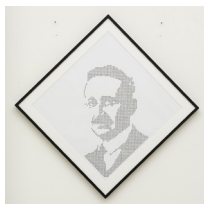
How to minimize your taxes (Friedrich Hayek 1899-1992) , 2026 Pen on paper, framed 50 x 50 cm