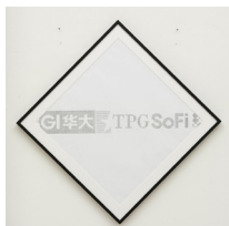
Post-painterly neo-pointillism , 2026 Pen on paper, framed 50 x 50 cm