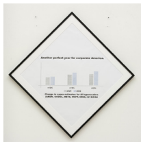
Techno-libertarian realism , 2026 Pen on paper, framed 50 x 50 cm