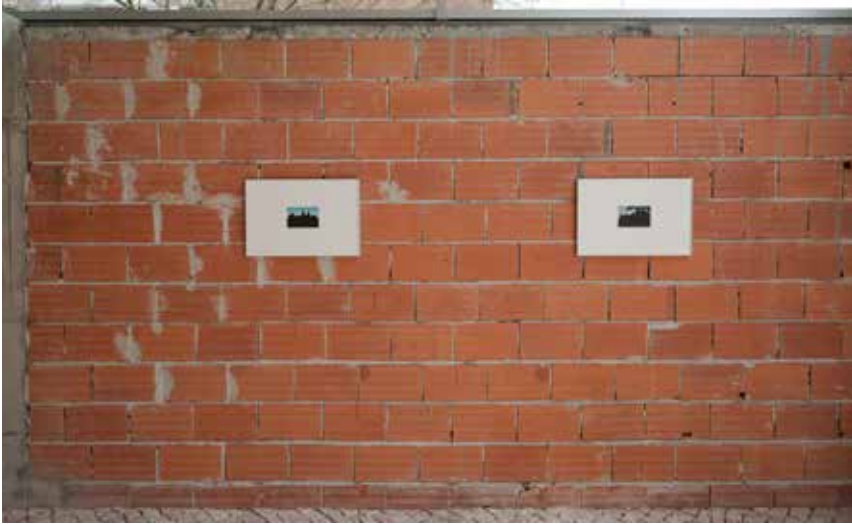
Willem de Rooij, Hut Hut , 2026 Willem de Rooij-4.jpeg