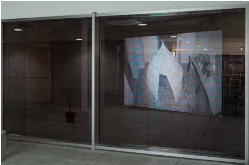
Willem de Rooij, Hut Hut , 2026 Willem de Rooij-8.jpeg