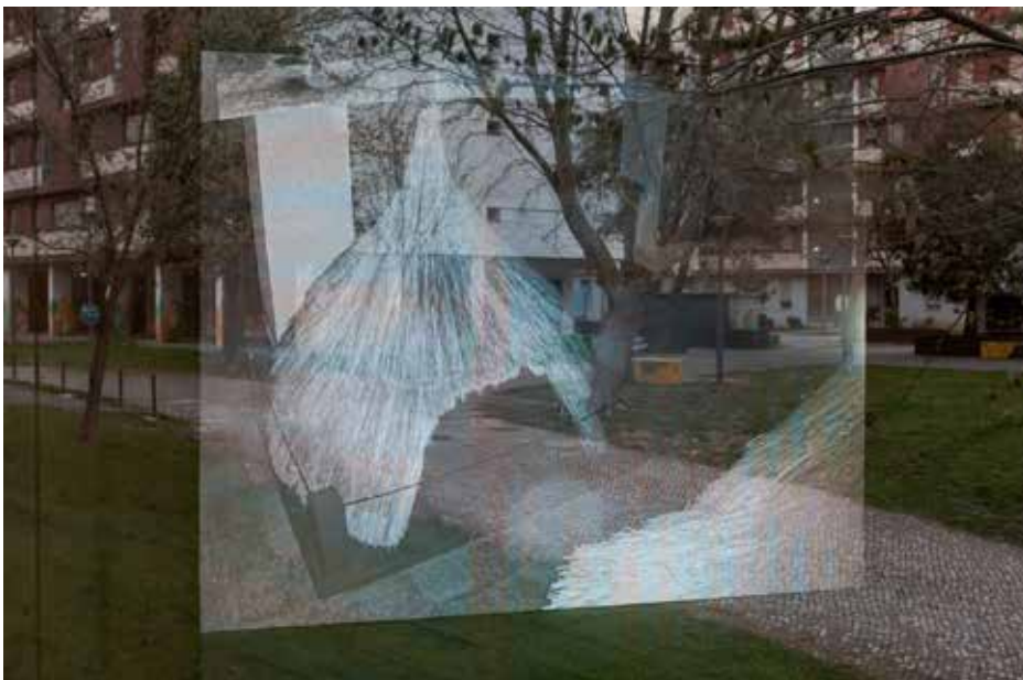
Willem de Rooij, Hut Hut , 2026 Willem de Rooij-10.jpeg