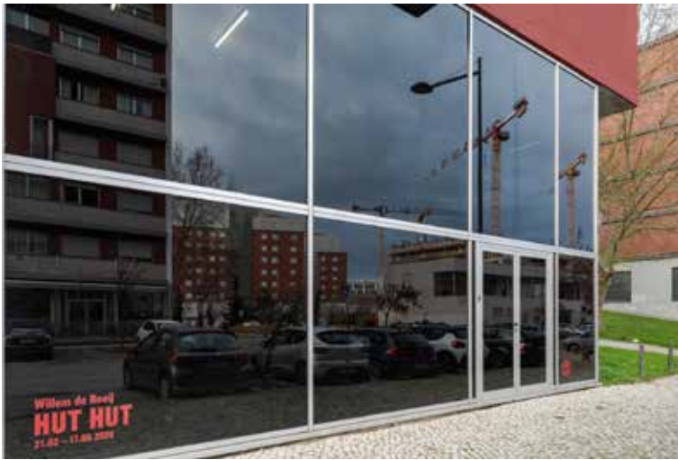
Willem de Rooij, Hut Hut , 2026 Willem de Rooij-1.jpeg