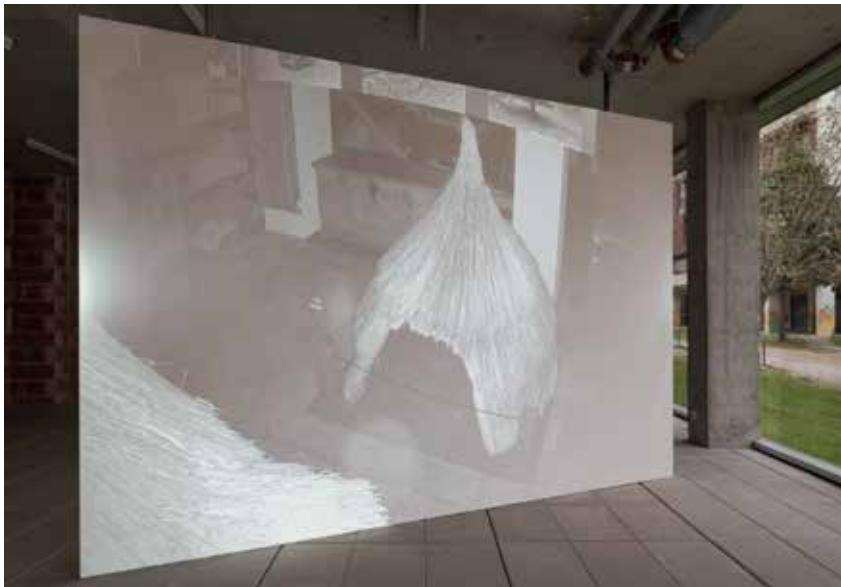
Willem de Rooij, Hut Hut , 2026 Willem de Rooij-6.jpeg