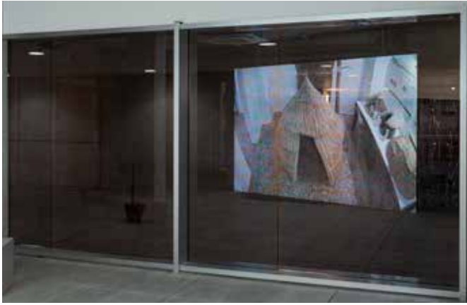
Willem de Rooij, Hut Hut , 2026 Willem de Rooij-9.jpeg