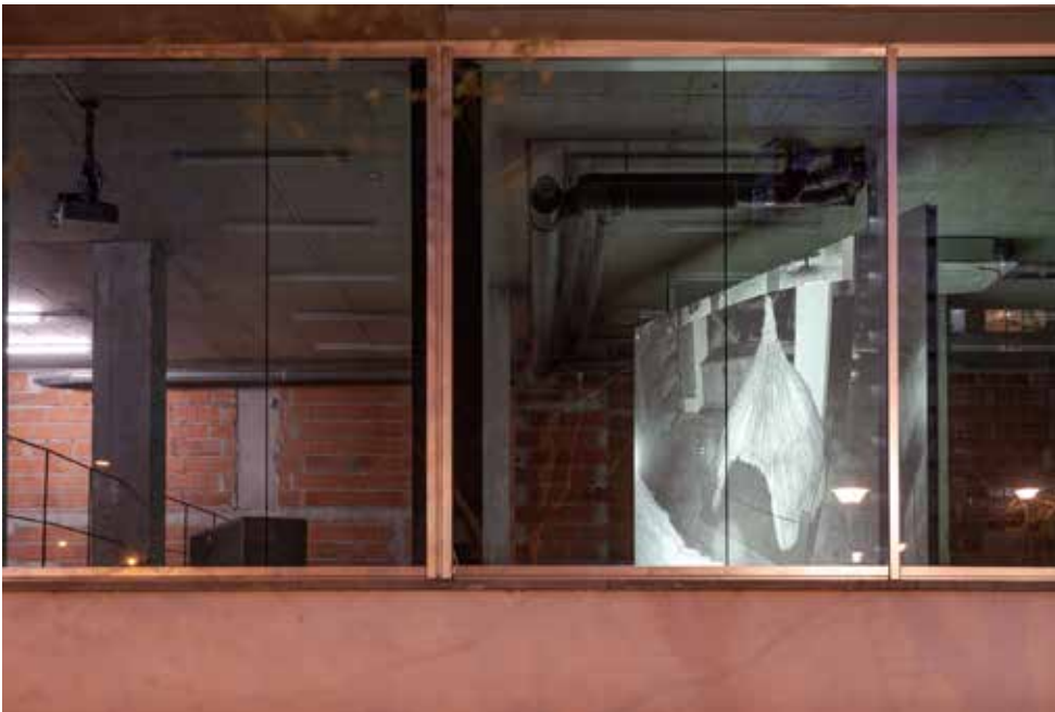
Willem de Rooij, Hut Hut , 2026 Willem de Rooij-11.jpeg