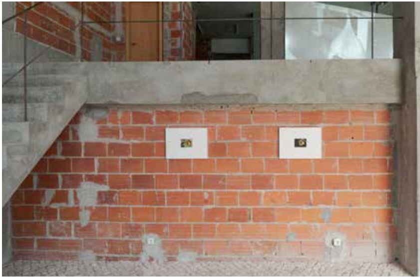
Willem de Rooij, Hut Hut , 2026 Willem de Rooij-5.jpeg