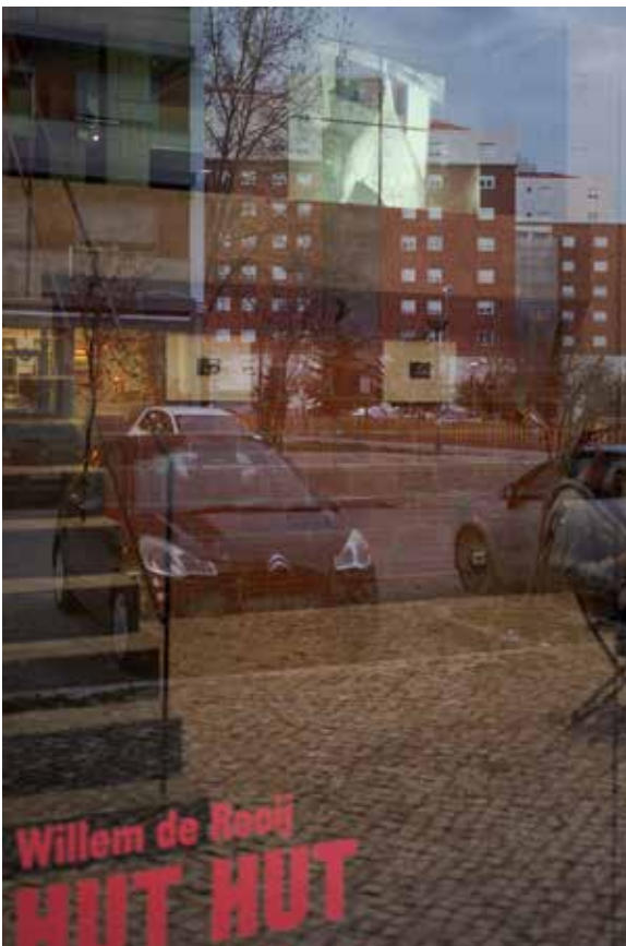
Willem de Rooij, Hut Hut , 2026 Willem de Rooij-2.jpeg