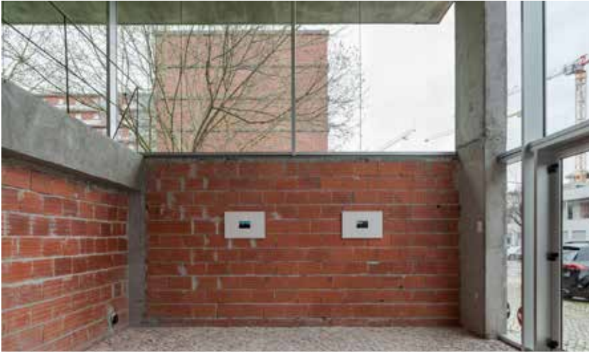
Willem de Rooij, Hut Hut , 2026 Willem de Rooij-3.jpeg