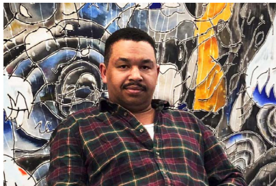
Uli Okujeni b. 1985, Zaria, Nigeria Lives and works in Karlsruhe, Germany

Tunji Adeniyi-Jones' boldly coloured paintings are set within a flat, shallow space located in modernist abstraction – in particular the overlapping planes of Cubism and the colourful papier découpé of Matisse – as well as the narratives and symbolism of West Africa. 'The bodies and forms depicted in these works can all be derived from the African continent, and more specifically rooted in a mythology emanating from the West African coast [...].' The figures in my work are expressions of my identity and there is something very rewarding about using the body as a vehicle for storytelling' he has said.