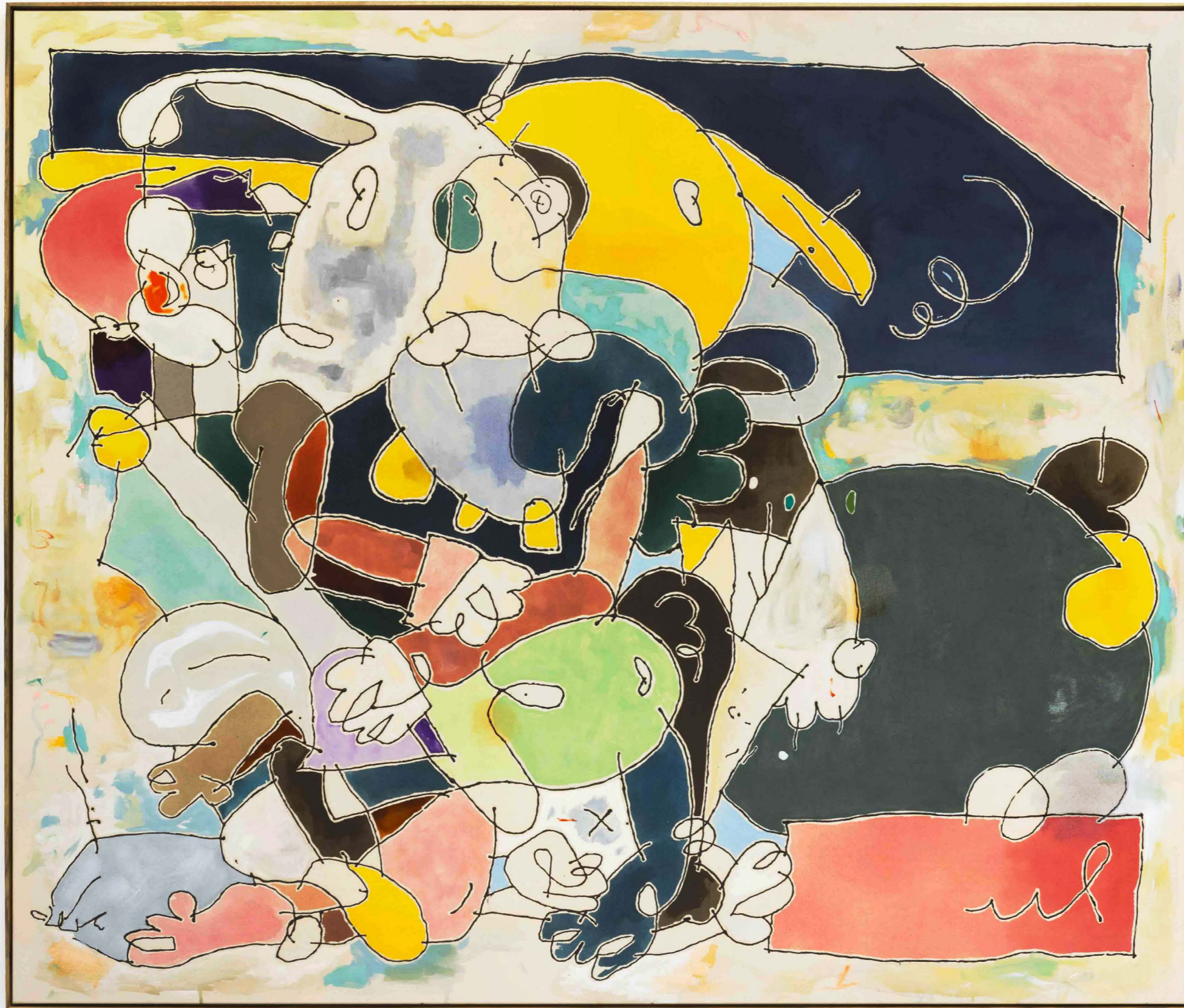
Uli Okujeni Spring Can Really Hang You Up the Most , 2026 acrylic, ink, oil on canvas 86 5 / 8 x 72 7 / 8 in. / 220 x 185 cm