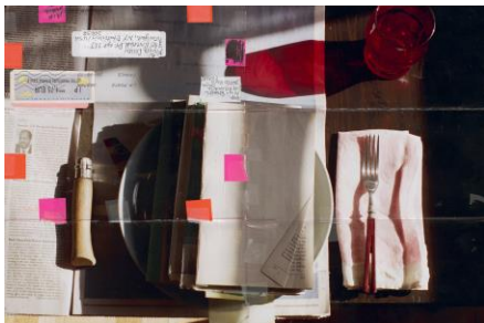
Moyra Davey, Ruby Glass , 2013, Digital C-print, tape, postage, ink, 12 x 18 inches.

experience as viewers, and helps make us readers of Davey's art.