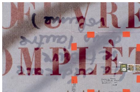
Moyra Davey, Dédicace , 2013, Digital C-print, tape, postage, ink, 12 x 18 inches.