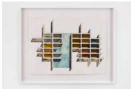
Study for Cellular Grid #5 2019 Watercolor and gouache on paper Framed Dimensions: 29 5/8 x 37 1/8 x 1 1/2 inches (75.2 x 94.3 x 3.8 cm)