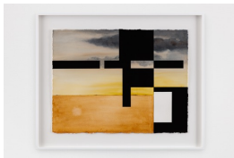
Planar Studies: Vast and Specific 12 2020 Watercolor and gouache on paper Framed Dimensions: 30 1/8 x 37 1/8 x 1 1/2 inches (76.5 x 94.3 x 3.8 cm)