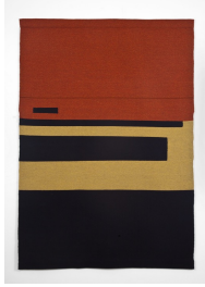
A-Z Cover Series 2: Subjective Composition (Rust and Gold Geometric) 2012 Wool 74 x 51 1/2 inches (188 x 130.8 cm)