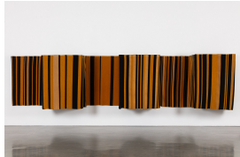
A-Z Cover Series 1 (Gold and Black Stripes) (detail) 2012 Woven wool and steel Dimensions variable, 10 panels