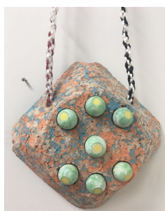
Paul Salveson Drupe , 2019 Paper, jawbreakers, plastic Bags, wood