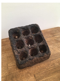
Paul Salveson Untitled , 2018 Paper, acrylic, wood, ball bearings, wood glue 3 1/2 x 5 x 5 in (8.9 x 12.7 x 12.7 cm)