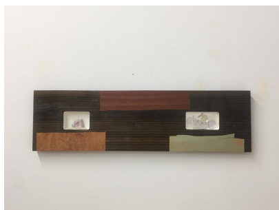
Eric Veit Better for Earth , 2019 Wood, shellac, plaster, wine foil, resin, plastic, wine, silver 10 1/4 x 36 1/2 x 1 1/2 in (26 x 92.7 x 3.9 cm)