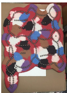
Paul Salveson Failed Conversion , 2019 Paper, ball bearings, wood 28 3/4 x 22 1/2 x 2 (73 x 57.2 x 5.1 cm)