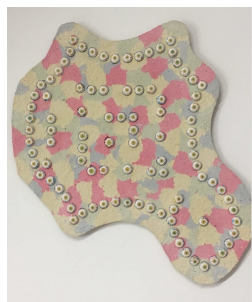
Paul Salveson Ideal Configuration , 2019 Paper, jawbreakers, wood 28 1/4 x 25 x 2 in (71.8 x 63.5 x 5.1 cm)