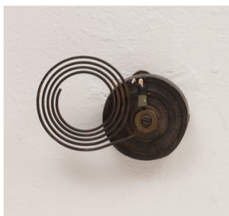
Image 28 × 15 in (71.1 × 38.1 cm) / Framed 30 3/4 x 17 3/4 (77.1 x 45.1 cm)

Graphite, ink, vinyl paint, and photo transfer on paper