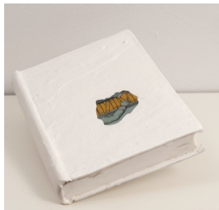
Liliana Porter The Book , 2018 Acrylic on vintage book 7 1/2 x 5 1/2 x 1 1/4 in (19.1 x 14 x 3.2 cm)