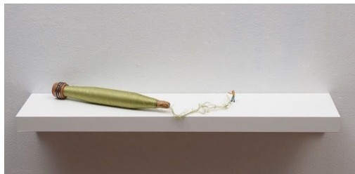
Liliana Porter The Unravel (green thread) , 2019 Figurine and thread spool on white shelf 4 x 22 x 5 in (10.2 x 55.9 x 12.7 cm)