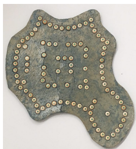
Paul Salveson Elastic Mask , 2018 Paper, jawbreakers, wood, wood glue 28 1/4 x 25 x 2 in (71.8 x 63.5 x 5.1 cm)