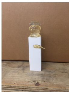
Eric Veit Sweet Potato Baby Doll , 2019 Wood, shellac, plastic, chocolate foil, resin $2000 8 1/2 x 3 x 2 in (21.6 x 7.6 x 5.1 cm)