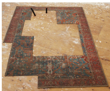
Ana Tiscornia Rug and chair , 2017 Digital print on fabric and painted wood 88 x 60 x 8 in (223.5 x 152.4 x 20.3 cm)