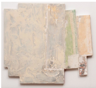
Ana Tiscornia Side by side , 2019 Acrylic, plaster, and fabric 12 1/2 x 13 1/2 in (31.8 x 34.3 cm)