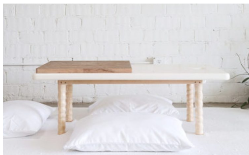
Benjamin Reiss Writing Table , 2018 Pine, oak, basswood, MDF, paint, glue, steel 16 x 47 x 23 in (40.6 x 119.4 x 58.4 cm)