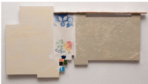
Ana Tiscornia Remaining flowers , 2018 Acrylic, plaster, paper and wood 12 x 23 1/2 in (30.5 x 59.7 cm)