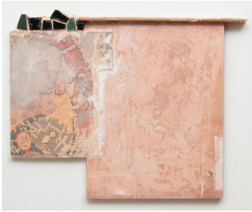
Ana Tiscornia It was next to the rug , 2019 Acrylic, plaster, digital print, mosaic and wood 11 1/4 x 14 3/4 in (28.6 x 37.5 cm)