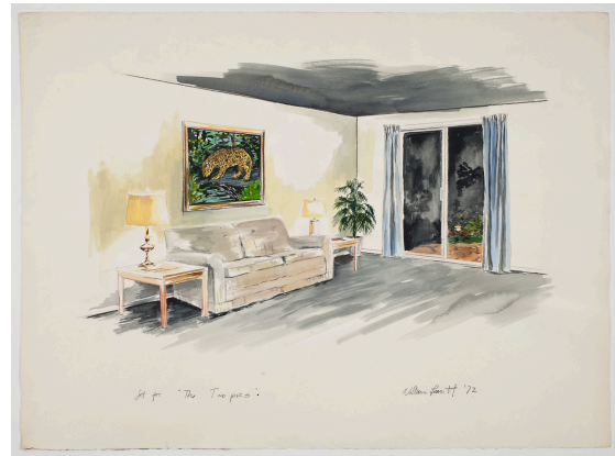
Set for " The Tropics ", 1972