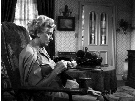
Night Call , Season 5 (2/7/64)