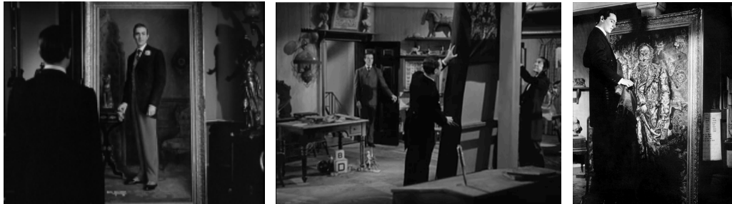
Stills from The Picture of Dorian Gray , directed by Albert Lewin, 1945

In line with her career-long scrutiny of cinematic representation, Cindy Sherman chose to display Henrique Medina's Portrait of Hurd Hatfield as Dorian Gray , painted for the 1945 film The Picture of Dorian Gray . Based on the Oscar Wilde 1890 novel of the same name, the black and white motion picture featured the rare appearances of Dorian Gray's evolving portrait in Technicolor inserts. Medina's work, which depicts the ever-youthful Dorian Gray of the film's beginning, is shown here next to a twin painting covered by a cloth, mimicking the way the character conceals his increasingly hideous portrait.