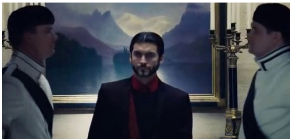
Still from The Hunger Games , directed by Gary Ross, 2012