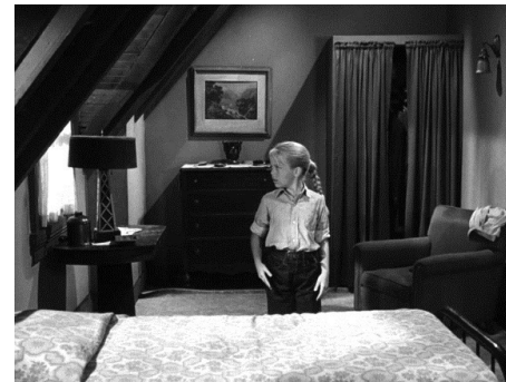
The Fugitive 2 , Season 3 (3/9/62)