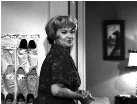
What's in the Box , Season 5 (3/13/64)