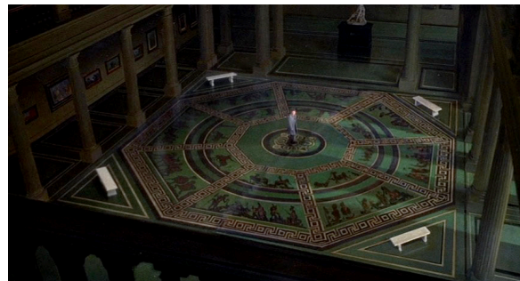
Still from Torn Curtain , directed by Alfred Hitchcock, 1966