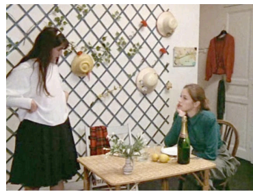
Still from 4 Aventures de Reinette et Mirabelle , directed by Eric Rohmer, 1987