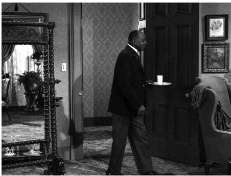
The Masks , Season 5 (3/20/64)