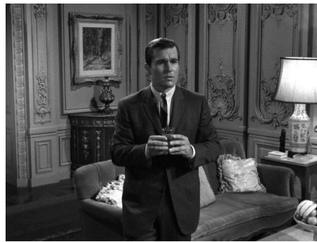
A Piano in the House 1 , Season 3 (2/16/62)