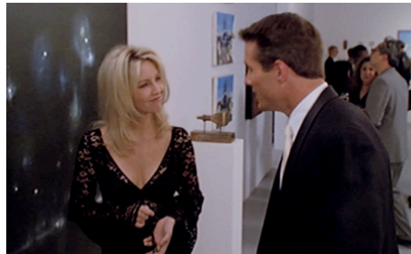
Still from Melrose Place , "Déjà Vu, All Over Again" (Season 5, Episode 28, 4/14/97)

Conceived as a viral, conceptual, public artwork to be conducted on primetime television, the GALA Committee's project, entitled In the Name of the Place , was hosted by soap opera, Melrose Place . The GALA Committee was formed at the University of Georgia and California Institute of the Arts ("GA" for Georgia and "LA" for Los Angeles) to create props and make slight script revisions as "product placements" for Melrose Place , not in service to commercial interests but to initiate the possibility of using the medium to assist in the generational transfer of ideas. This project of covert insertion was not intended to be solely subversive, but to offer a blueprint on how artists can collaborate with commercial production from the "inside."