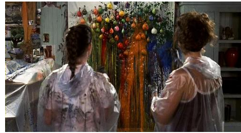
Still From The Princess Diaries , directed by Garry Marshall, 2001

For the series, Walt Disney Productions , Bertrand Lavier mines Mickey and Minnie Mouse comic strips for images of abstract and modern art and recreates these cartoon objects as paintings and sculptures. For this exhibition, Lavier explored the inclusion of art to live-action Disney films, appropriating the “balloon painting” from The Princess Diaries (2001, dir. Garry Marshall). A vague homage to Niki de Saint Phalle’s “Shooting Picture” series from the early ‘60s, the creation of the painting, made by throwing darts at paint-filled balloons, provides an opportunity for the film’s teenage protagonist to bond with her eccentric artist mother.