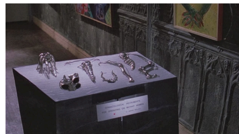
Still From Dead Ringers , directed by David Cronenberg, 1988

Dora Budor has created a sculptural installation based on a series of speculative ‘instruments for performing gynecological experiments on mutant women’ which feature in David Cronenberg’s film Dead Ringers (1988). The objects appear in the movie not only as medical instruments, but also as artifacts or art objects in a museum. Budor has imagined a third context for the objects as well: fossilized remains that pre-exist events of the narrative as relics of an imagined past, presented as though they might be ancient artifacts in a museum of natural history.