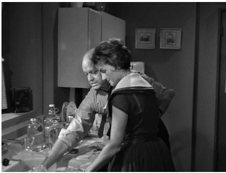
The Shelter 1 , Season 3 (9/29/61)