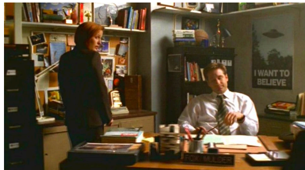
Still from The X-Files (1993-2002)