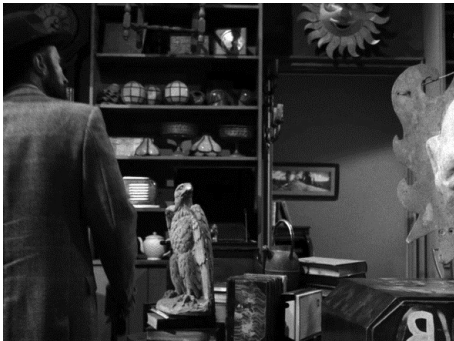
A Piano in the House 2 , Season 3 (2/16/62)