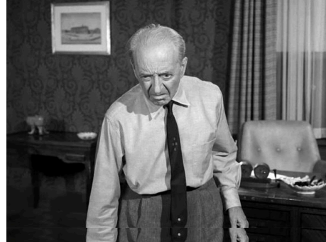
Long Live Walter Jameson 2 , Season 1 (3/18/60)