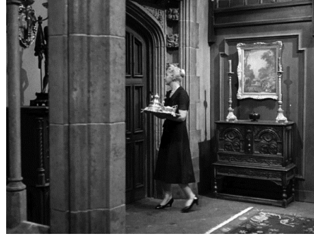
The Sixteen-Millimeter Shrine 1 , Season 1 (10/23/59)