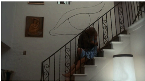
Still from Minni & Moskowitz , directed by John Cassavettes, 1971