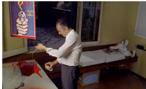
Still From Dillinger is Dead , directed by Marco Ferreri, 1969