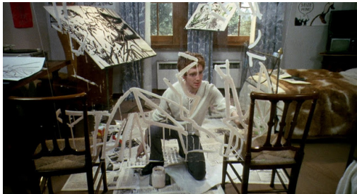
Stills from Teorema , directed by Pier Paolo Pasolini, 1968