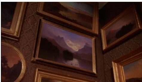
Still from The Age of Innocence , directed by Martin Scorsese, 1993