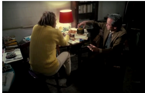
Still from La Collectionneuse , directed by Eric Rohmer, 1967