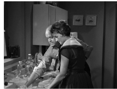
The Shelter 1 , Season 3 (9/29/61)