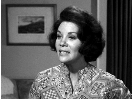
Ring-a-Ding Girl , Season 5 (12/27/63)