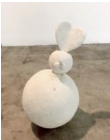
Bienvenue Dickhead, 2018 Paper mache, feathers 12" x 12" x 19"