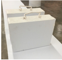
Bags, (1-2, 3-4, 5-6, 7-8, 9-10), 2018 Foam core, paper mache 3" x 9" x 6.5" each

Exhibition Checklist (clockwise from entrance)