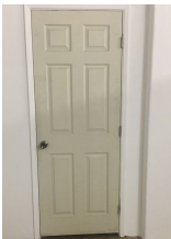
Door , 2018 Found door 30" x 1.5" x 78"