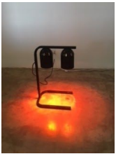
Untitled (lamp) , 2018 Heat lamp, electric tape, infrared light 20" x 15" x 28"