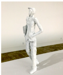
Business Professional, 2018 Epoxy, wood, acrylic 7" x 8" x 22"