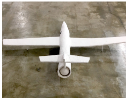
Privacy, 2018 Paper mache, wood, plastic, feathers, acrylic 52" x 66" x 17"