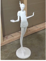
Waitress (b) , 2018 Epoxy, found object, acrylic 6" x 12" x 19"