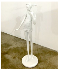
Waitress (a), 2017 Epoxy, found object, acrylic 6" x 7" x 19"