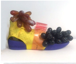
No Time for Decadence , 2016 Shoe, grapes, lighting gel 6" x 5" x 11"