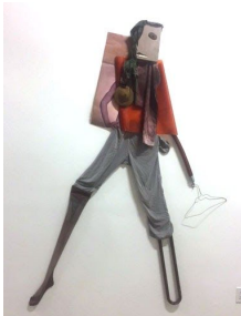
To be Real, 2016

Canvas, fiberglass, acrylic, ceramic, gouache, driftwood, mesh, wood, paper clay, felt, early 20 th c. mukluk 104" x 32" x 8"