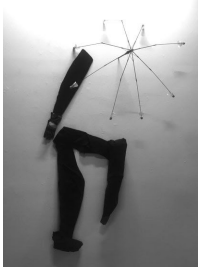
Revving the Target, 2016

stir stick, ceramic, wood, rubber glove, cement, paper clay, stage paint, masonry and dry pigment, driftwood, club, shellac, quilt 94" x 55" x 8"