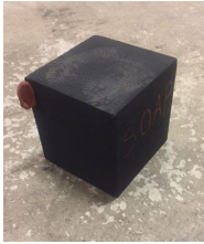
Soap Box , 2016 Sally Haley's plinth, ceramic, chalk 12.5" x 12.5" x 14"

Companion (After Both) , 2014-2016 Wood, stage paint, gouache 52" x 8" x 12"