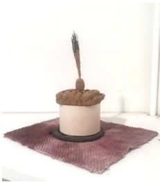
Disabled Ration , 2016 Cash register tape, Chinese wooden ornamental shard, African clay bead, towel, straw, thread, gouache, hive 8" x 9" x 9"