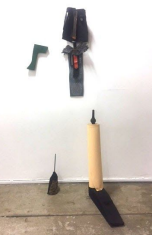
Poem of Force, 2016

Ball, metal, canes, lead, steel, silver, sweatshirt, shirt, apron, dyed linen, beaded bag, wood, clay, wire, photogravure, marker, acrylic, plastic bucket 82" x 20" x 11"