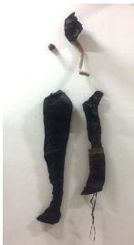
Tonic (Adjacent Yerba Buena and Poison Oak), 2016

Umbrella, birdies, polystyrene, fiberglass, shoe, ceramic, burlap, wood, speed glove 105" x 66" x 12"