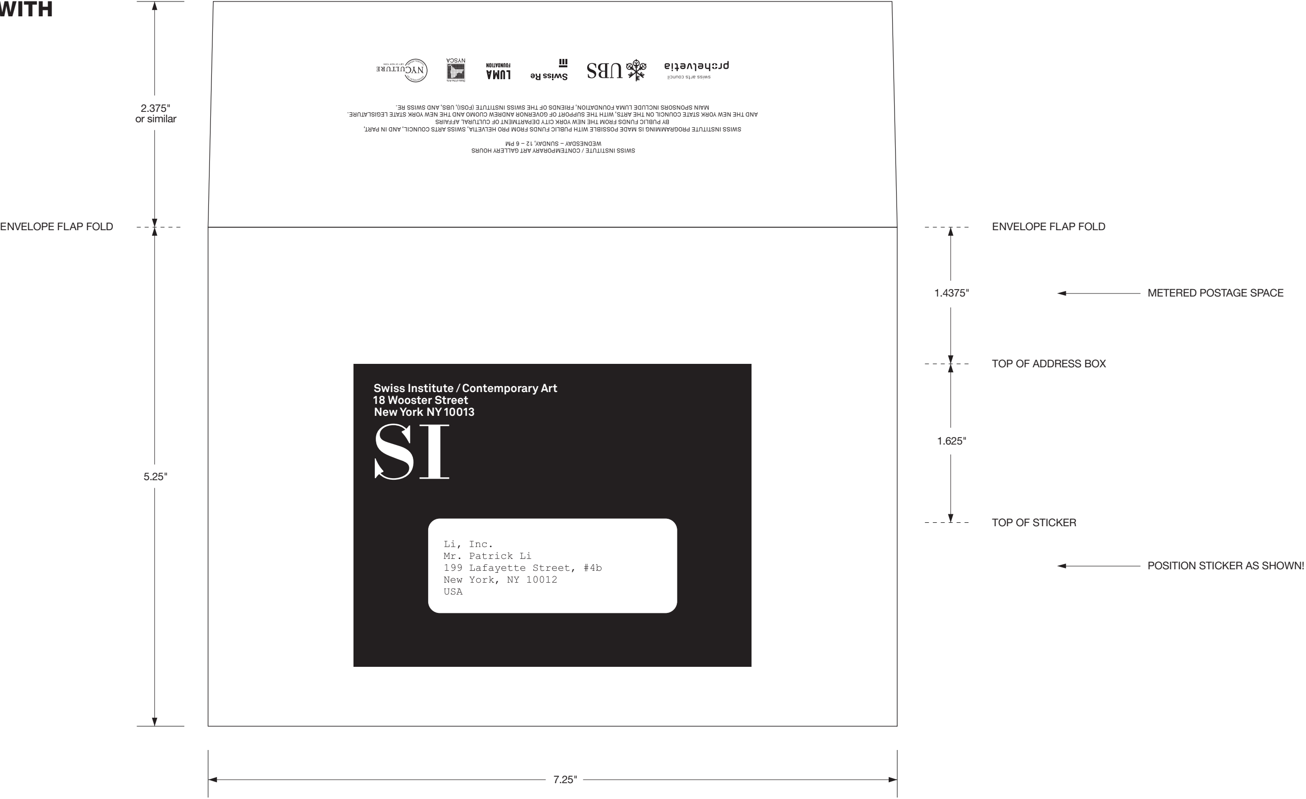
A7 STOCK ENVELOPE – FRONT WITH FLAP OPEN

ENVELOPE FRONT WITH FLAP OPEN 1-SIDED PRINTING 1-COLOR