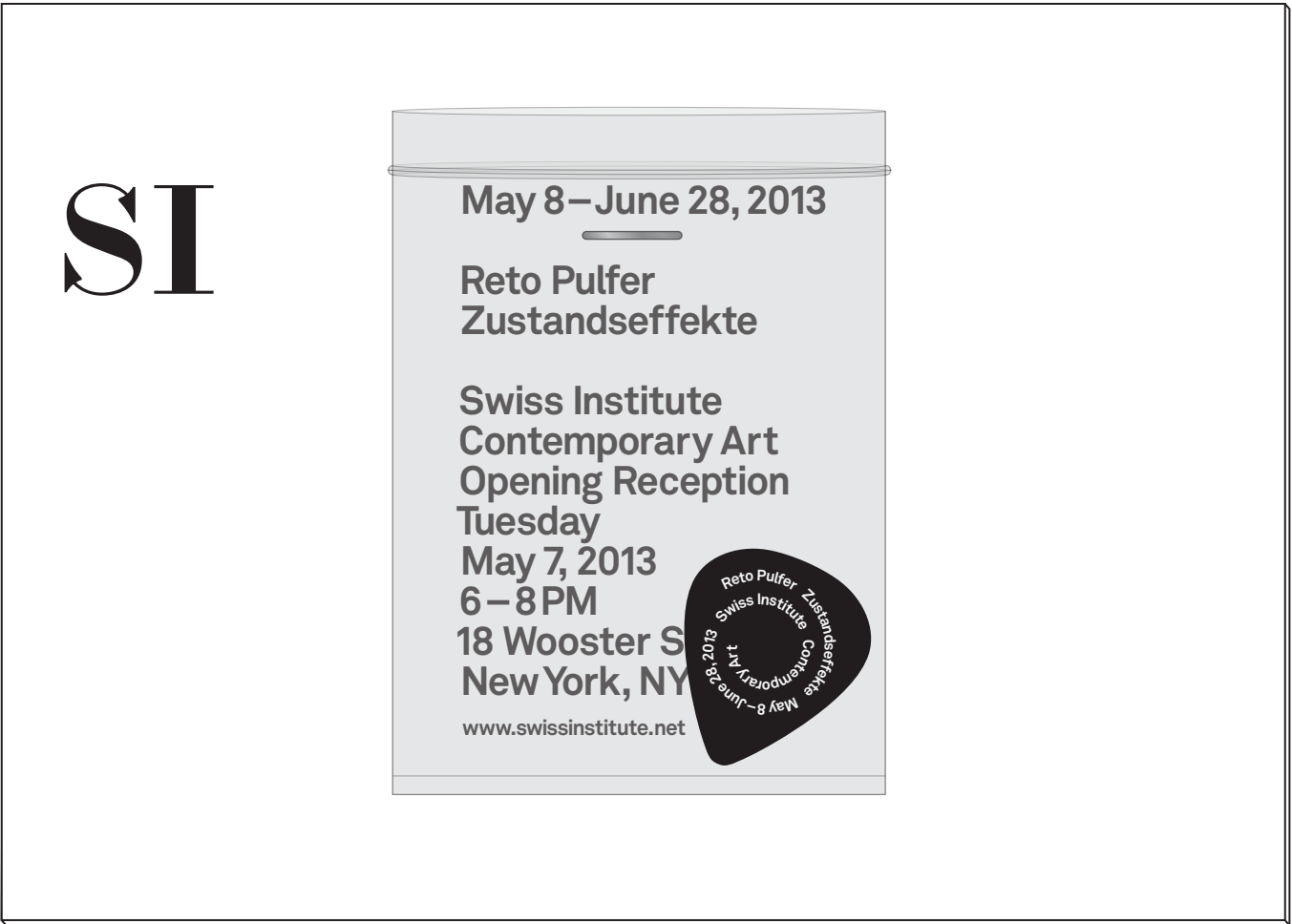
COMPONENT VIEW STAPLE, POLY BAG, PICK AND INSERT CARD WITH 1-COLOR OFFSET PRINTING