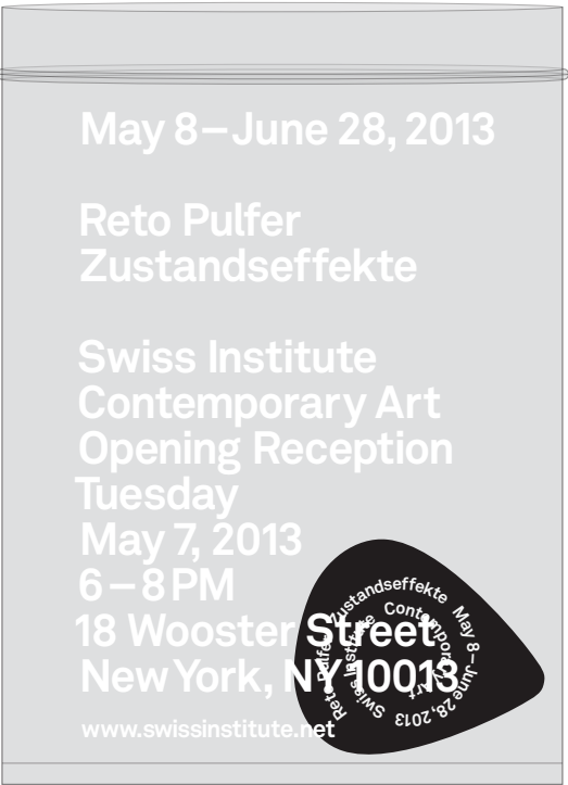
ASSEMBLED VIEW PICK IN POLY BAG WITH 1-COLOR SILKSCREEN PRINTING